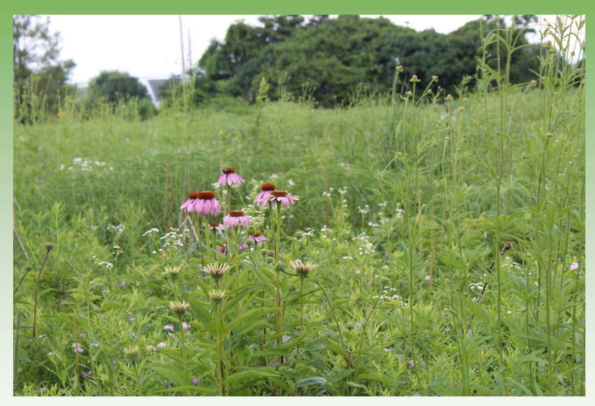
Jacobsburg Environmental Education Center