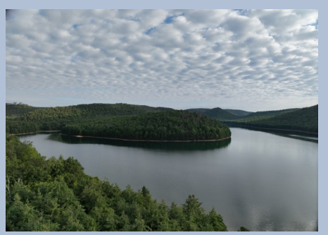
Long Pine Run Reservoir