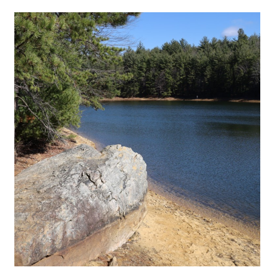
A view from the fishing pier.