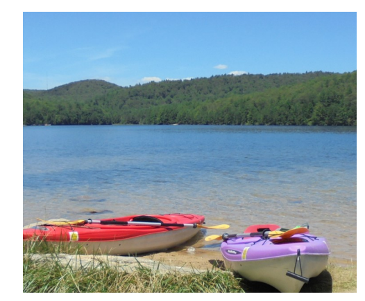
Kayaking at Long Pine Run Reservoir.