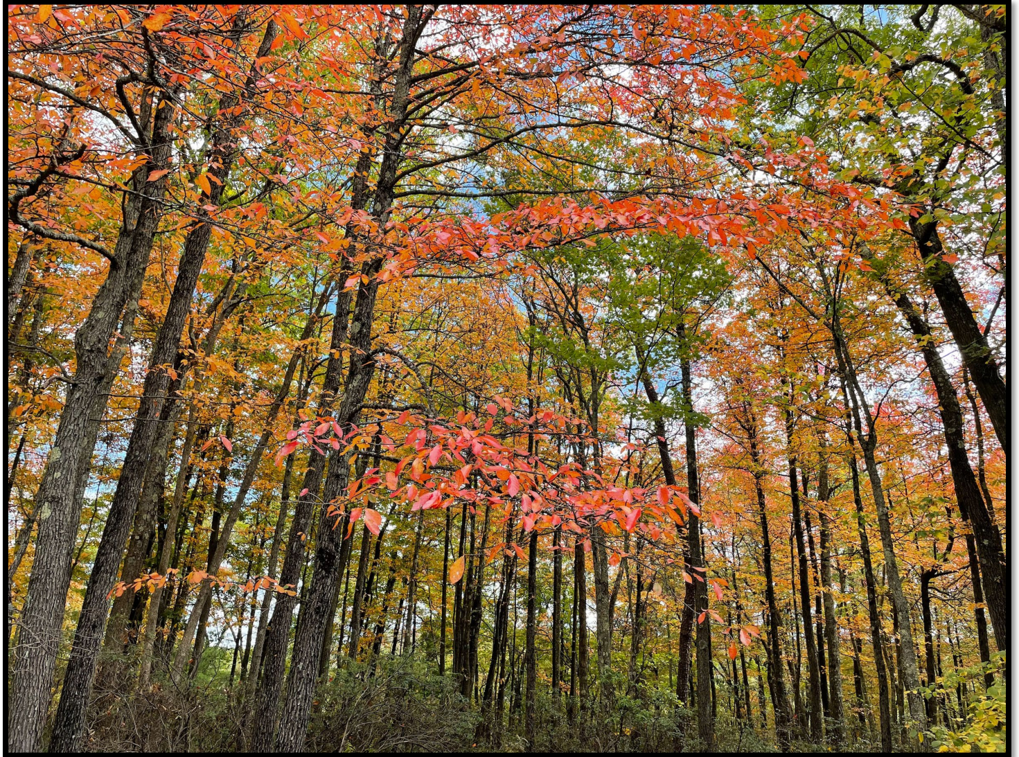
Bull Run Road, Tiadaghton State Forest.

Staff in Tiadaghton State Forest said much green remains on the mountainsides, but fall color is progressing. Sugar maple, birch, sassafras, black gum, walnut, and hickory are showing their colors mainly on the mountaintops, but red maples, oaks, and beech have just begun to turn. Mountaintop roads are the best corridors to see the striking colors, currently. A hike on the George Wills Ski Trail would offer some pretty views as well. The Pine Creek Rail Trail will also present a scenic walking or bike riding venue through the changing scenery.