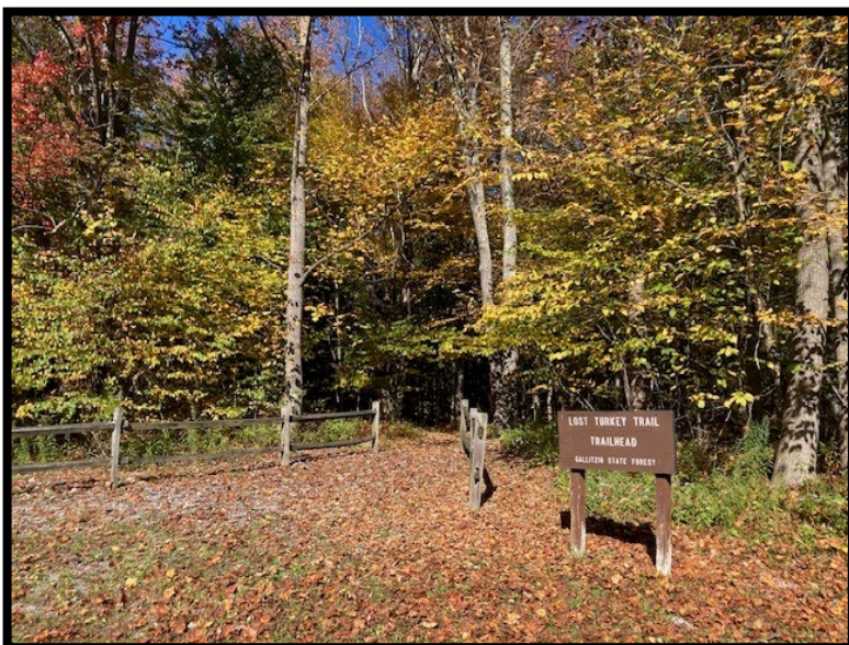
Pleasant color at Lost Turkey Trail trailhead.

Gallitzin State Forest staff (Indiana, Cambria, Blair counties) reported area forests are approaching best color, but leaves seem to be falling fast. Maples are at peak and cherries have begun to fade. Oaks are still very green but provide a nice contrast with the brighter shades. A hike on the Lost Turkey Trail is a great way to experience the beauty of the season.