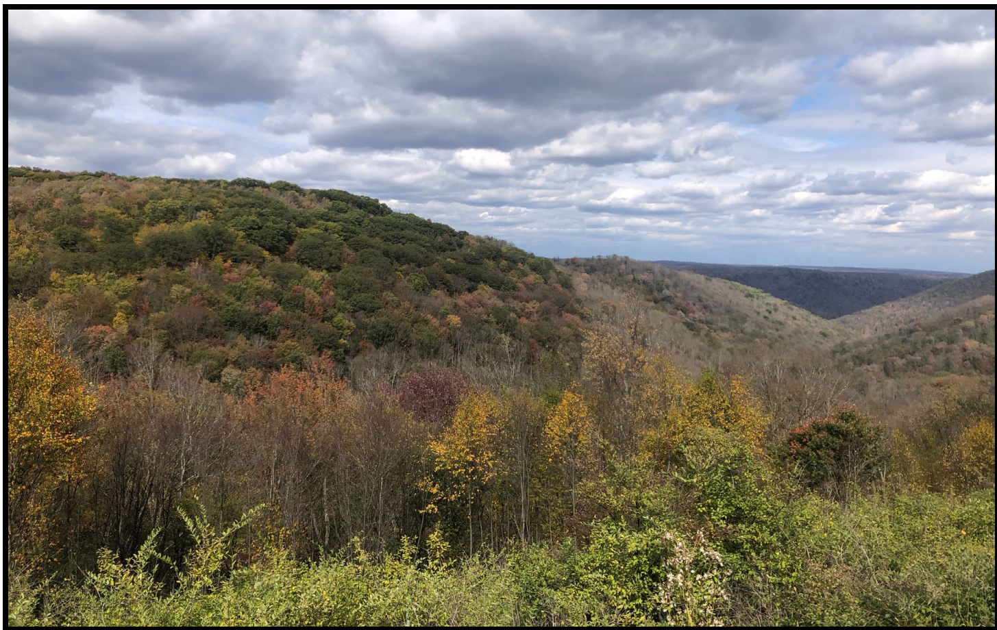
Stark contrast between the oak forest and northern hardwoods (right) from Water Tank Vista along Route 44.

The Tioga County service forester said the state forest is still exhibiting best color. Impressive colors can be seen on northern hardwoods as orange, red, and yellow have filled the mountain landscape. Red maples are still beautiful while oaks remain mostly green. Any drive in the region will reveal beautiful foliage, but the eastern half of the county is slightly fading. A recommended drive is along the west rim of the PA Grand Canyon along Colton, Painter Leetonia, and West Rim roads. In the same area, a suggested hike is on the northern half of West Rim Trail. Good color is still expected later into the fall foliage season with oaks yet to peak.