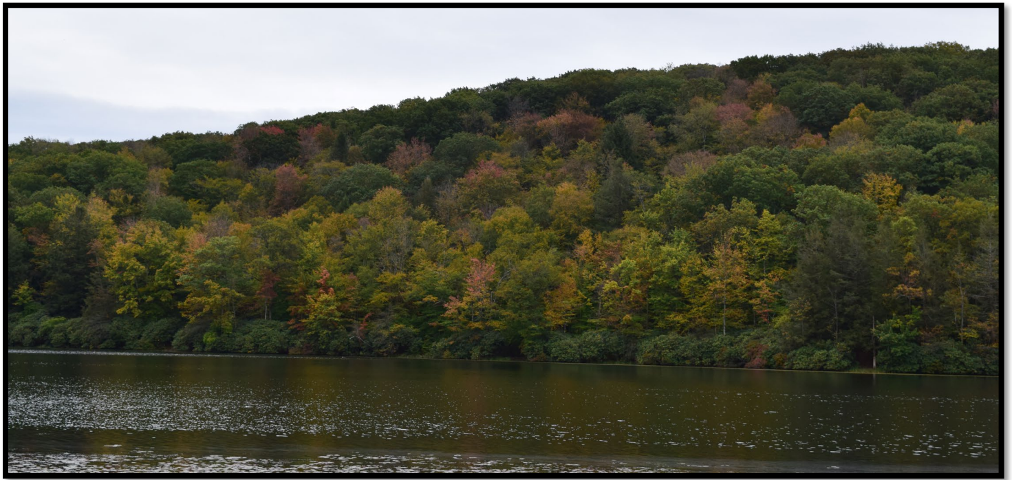
View at Merli Sarnoski Park, Lackawanna County.

The Pike/Monroe County service forester (Delaware State Forest District) said the region's forests are entering a period of high variability based on elevation and exposure; much of the forest has not yet peaked and is still approaching best color. Exposed areas with slightly more pronounced elevation or weather exposure may be peaking within this forecast period while lower elevations with less exposure are still in the beginning stages. Red maple is exhibiting a vibrant red and ash is displaying bright yellow/orange. Black gum has become bright red and sweet birch is sporting vivid yellow. Recommended destinations for great fall color are the Stairway Wild Area (particularly close to the river), Tobyhanna Lake, Peck's Pond, and Promised Land Lake.