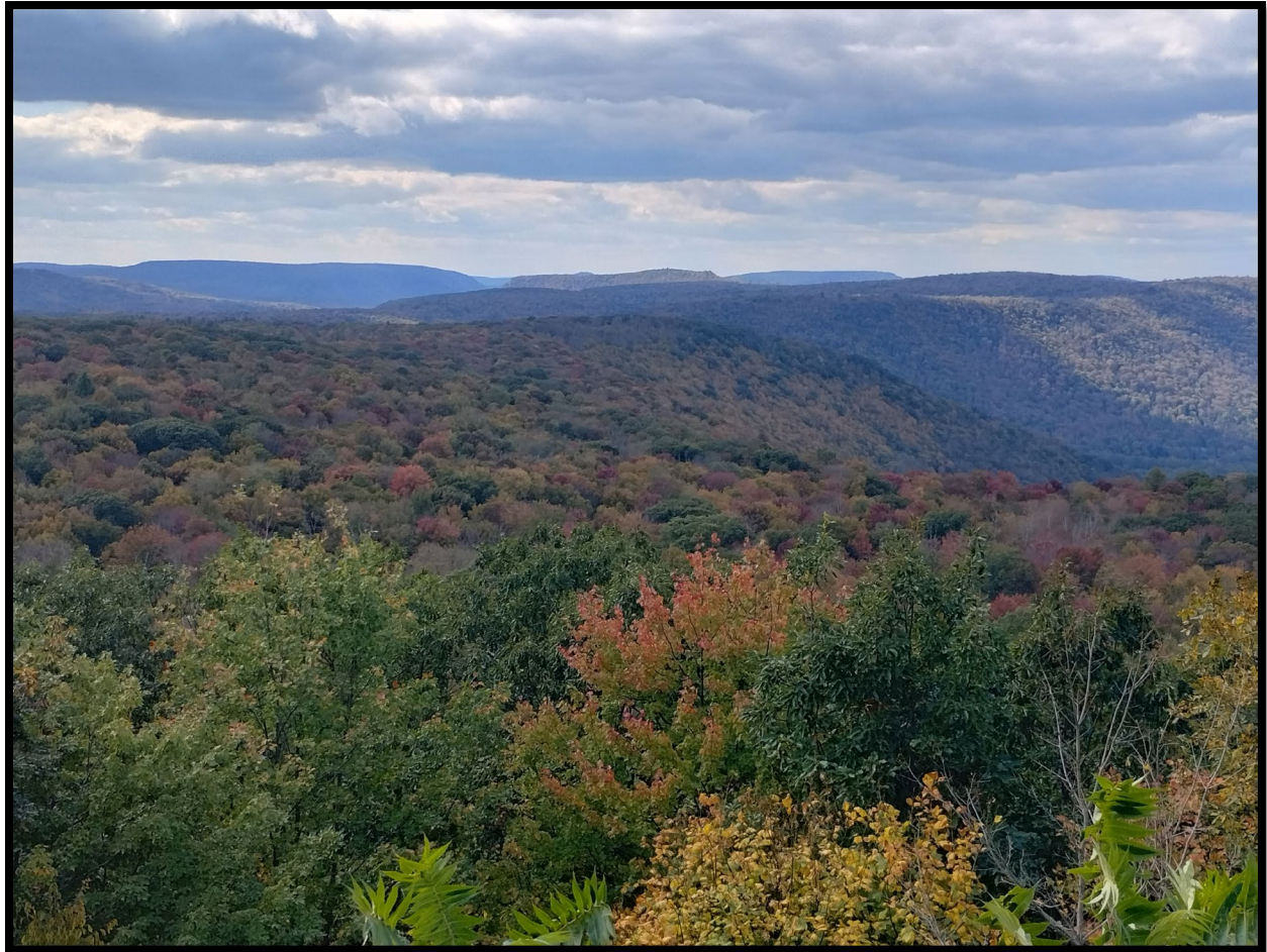
Beautiful fall shades at High Knob Overlook, Loyalsock State Forest.

Foresters in Loyalsock State Forest (serving Lycoming, Sullivan, Bradford counties) reported peak foliage throughout the district, with gorgeous shades of yellows and oranges, especially in the northern half of the district. Oak stands are still green, and many maples have lost their leaves last week. Some maple leaves are still hanging on, showing off their reds and golds. A slow drive to High Knob Overlook or a hike along Angel Falls Trail will show vivid autumn color.