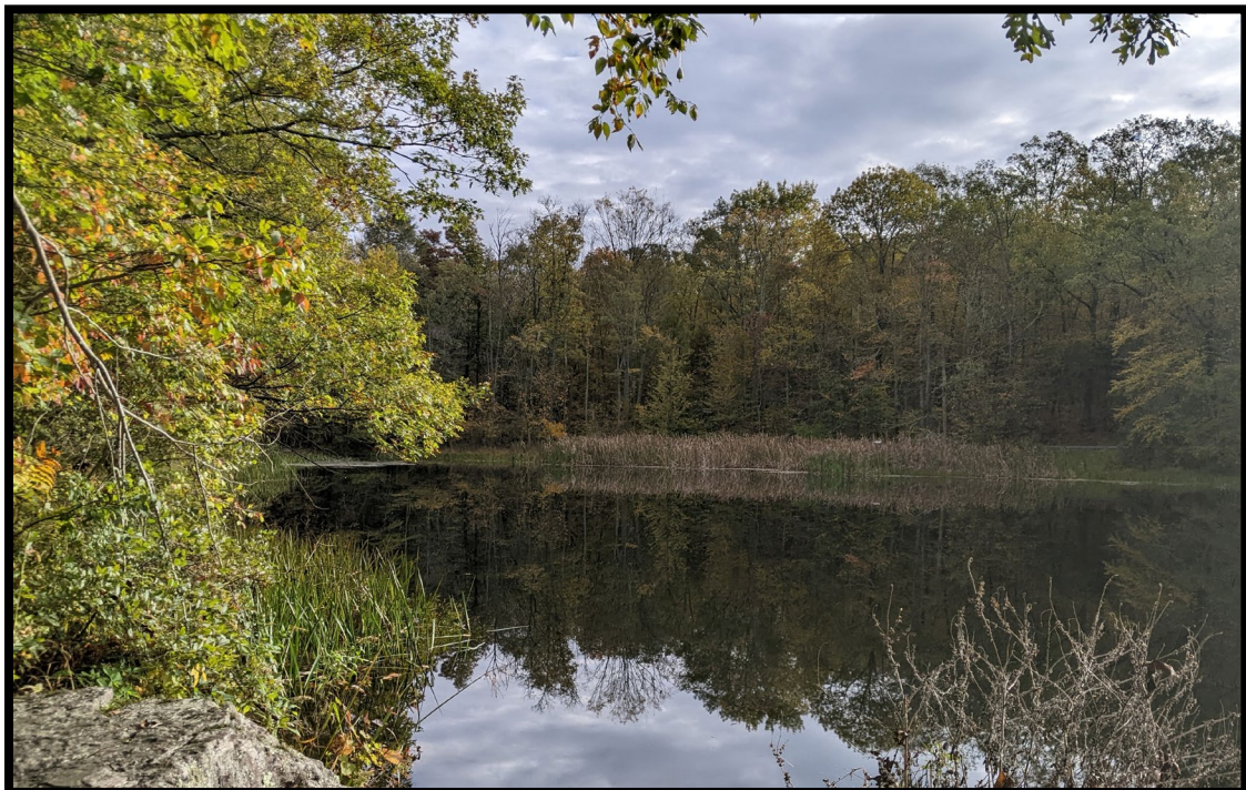
View at Rod Flad Memorial Park.

The Pike/Monroe County service forester (Delaware State Forest District) said the region's forests are entering a period of high variability based on elevation and exposure; much of the forest has not yet peaked and is still approaching best color. Exposed areas with slightly more pronounced elevation or weather exposure may be peaking within this forecast period while lower elevations with less exposure are still in the beginning stages. Red maple is exhibiting a vibrant red and ash is displaying bright yellow/orange. Black gum has become bright red and sweet birch is sporting vivid yellow. Recommended destinations for great fall color are the Stairway Wild Area (particularly close to the river), Tobyhanna Lake, Peck's Pond, and Promised Land Lake.