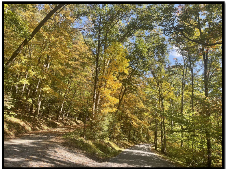
Licking Creek Drive, Tuscarora State Forest, Juniata County.

In Bald Eagle State Forest, the Union, Snyder, and Mifflin County service forester said the region's woods are approaching best color. Black gum is vibrant and red maple, sassafras, sumac, and hickory are transitioning. Oaks are still holding green. Brush Hollow Trail (Centre/Union County) and Little Mountain Trail (Snyder County) are recommended to view some great autumn sights.