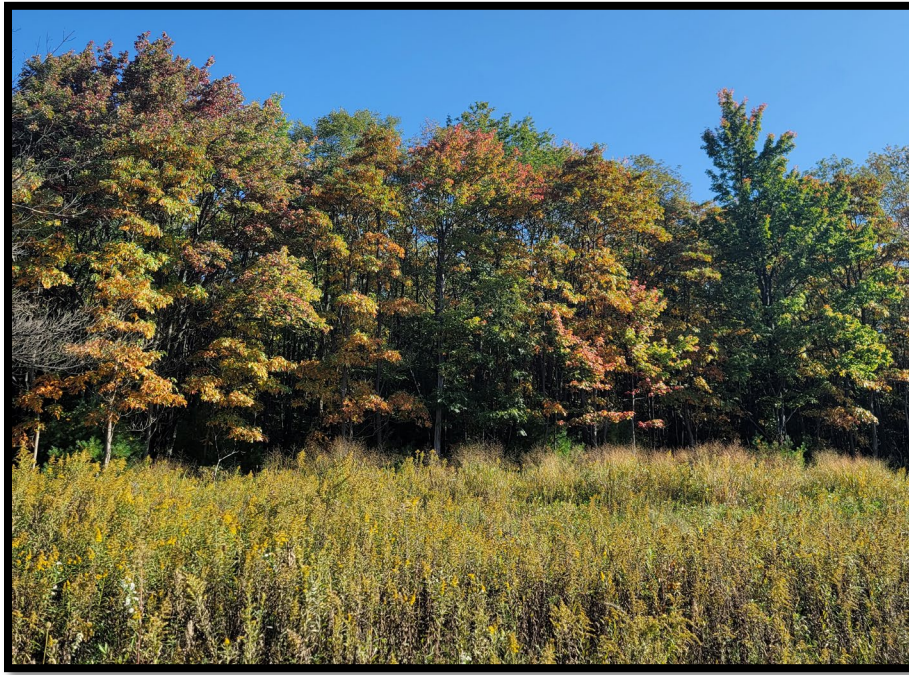
View from Beech Creek Road, Sproul State Forest.

Forestry staff at the Mira Lloyd Dock Resource Management Center (Centre County) said a drive on Route 45 showed a remarkable color shift in the valley as the oak species are catching up to the northern hardwoods. Peak conditions began during the latter part of the last forecast period and should continue into next week. Suggested destinations to admire the vibrant shades are Poe Paddy, Poe Valley, Penn-Roosevelt, or Reeds Gap State parks.