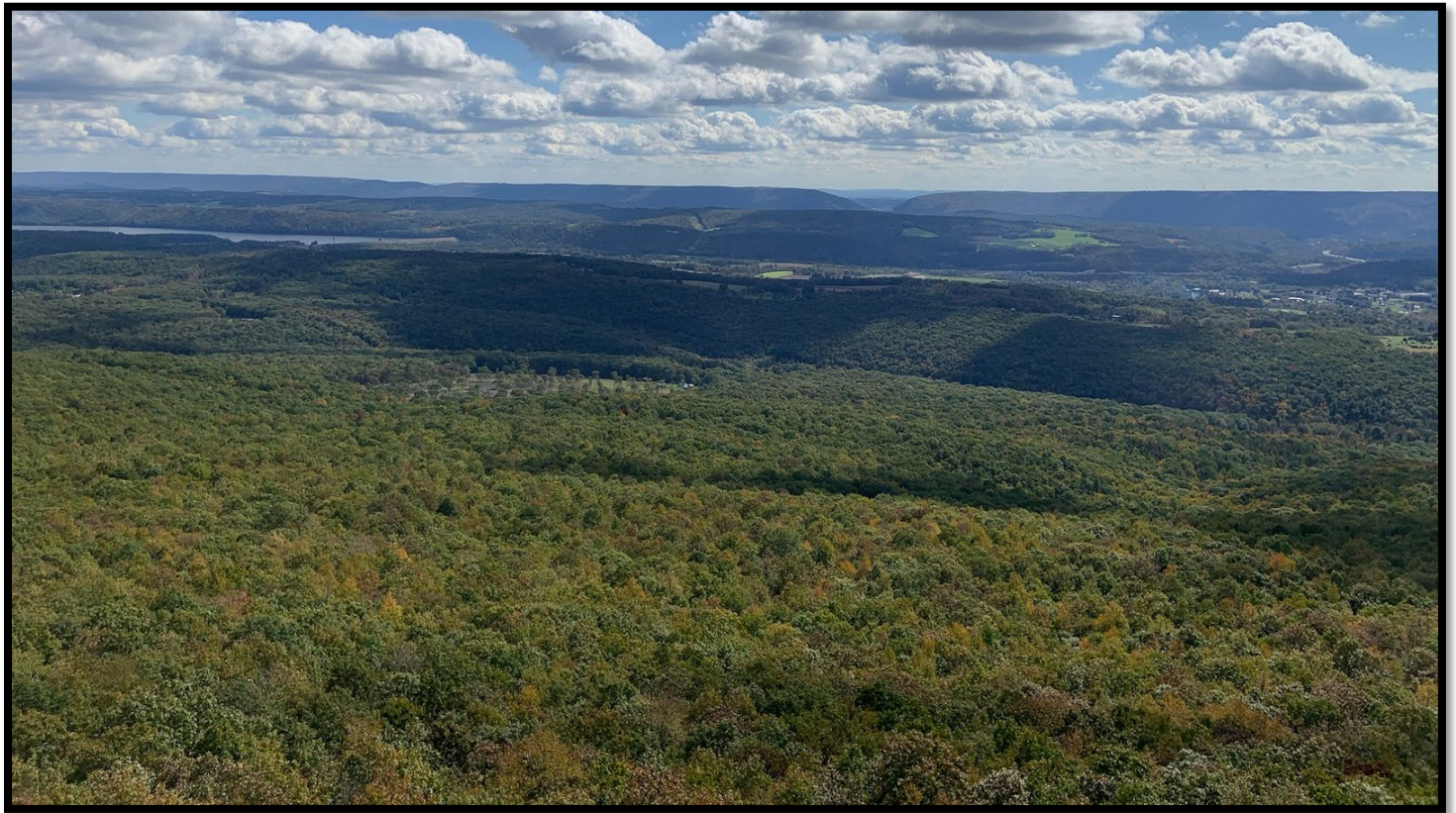
The view from Mauch Chunk fire tower, Jim Thorpe area.

tracts are great options to view fall colors. Hickory Run and Lehigh Gorge State parks are recommended for pleasant foliage viewing in Carbon County. Peak color is expected on approximately October 22 for the northern half of the district.