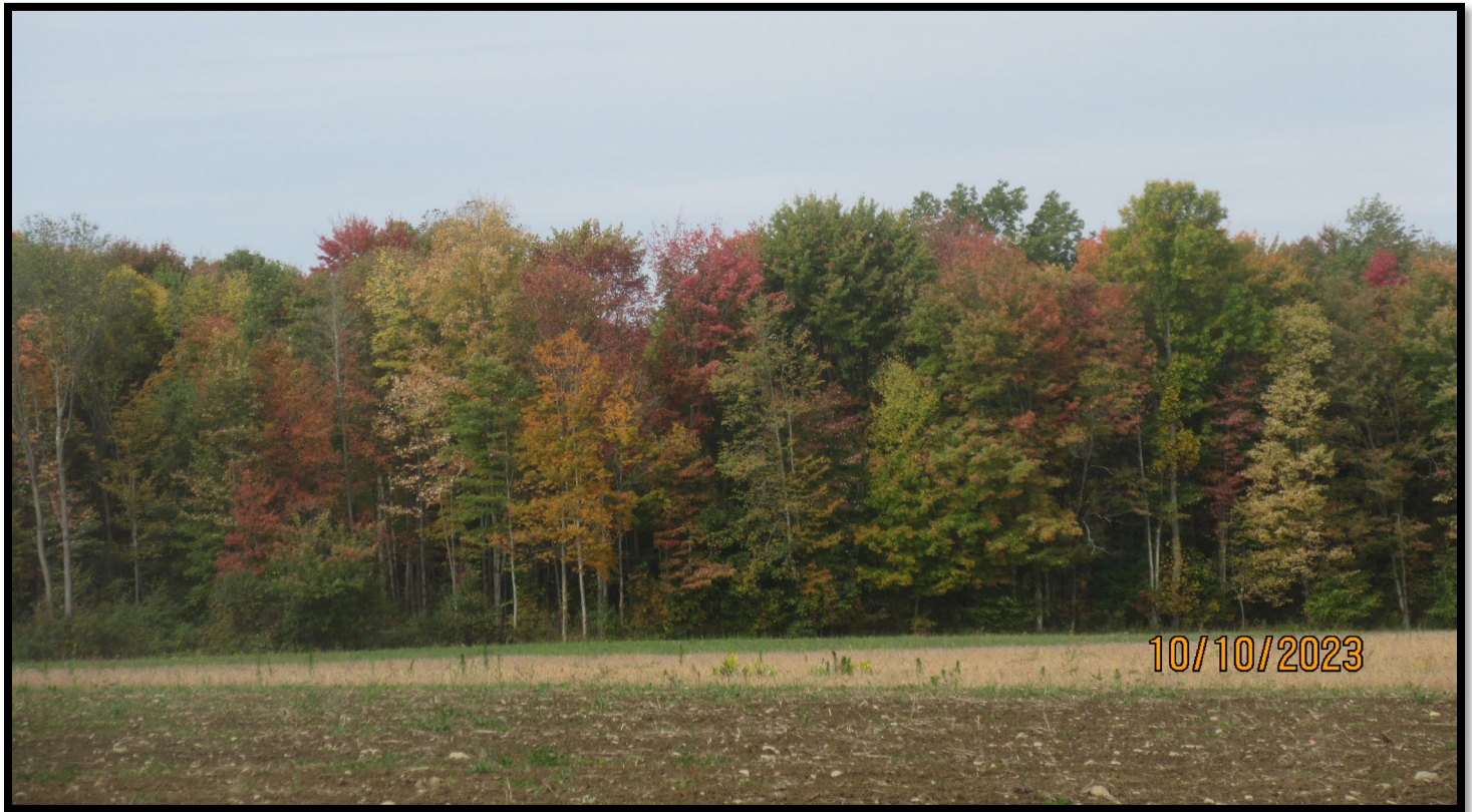
Mercer County is alight with color.

The Mercer/Lawrence County service forester (Clear Creek State Forest District) indicated the area lost some leaves last week because of heavy rain, but there is still plenty of foliage and color. The region is approaching best color with maples putting on a fine show of yellow, orange, and red. Oaks are changing in a few areas, and there is still color on birch, aspen, walnut, and elm. Peak for the region is expected on about 10/18.