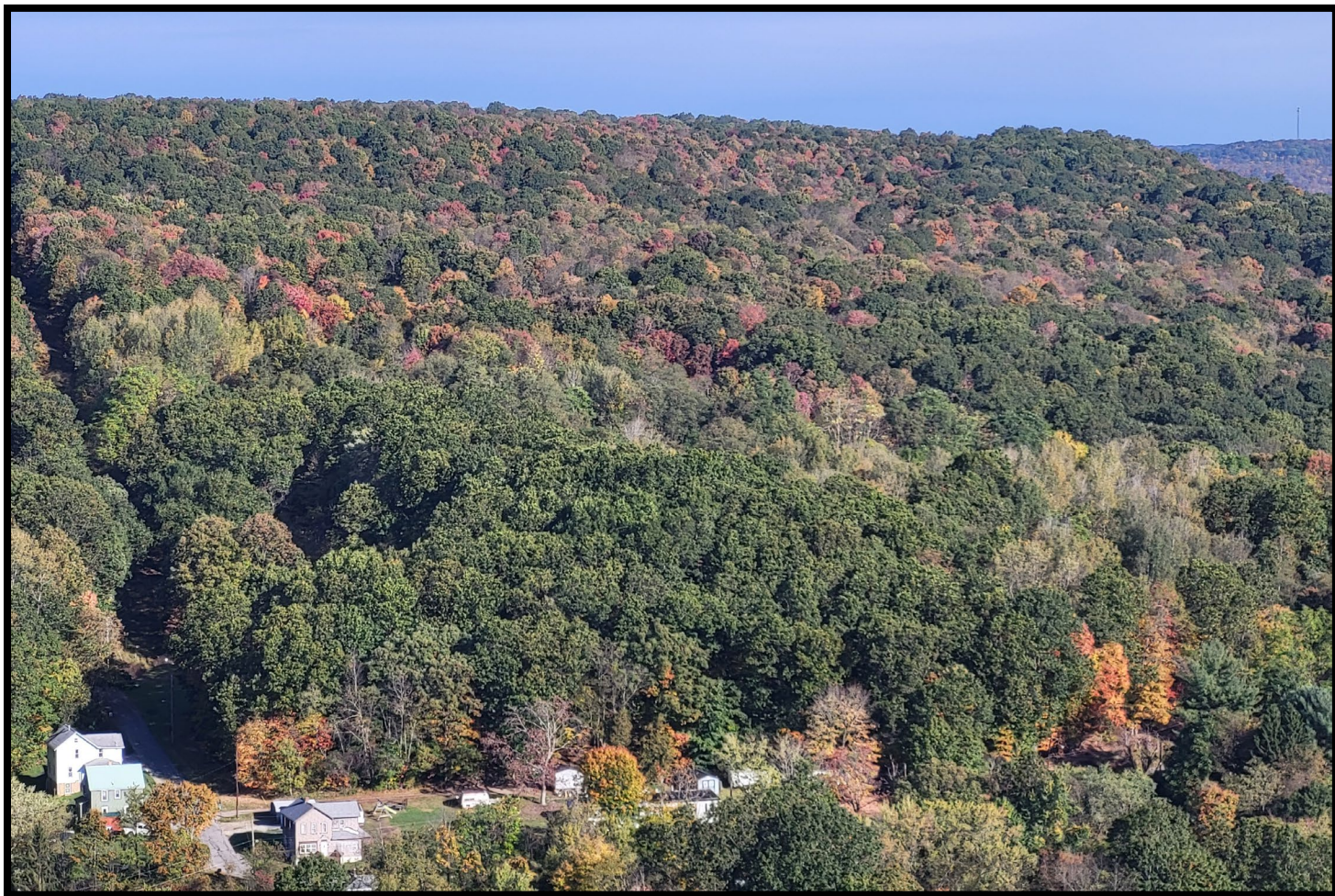
Cornplanter Hill near Oil City, Venango County.