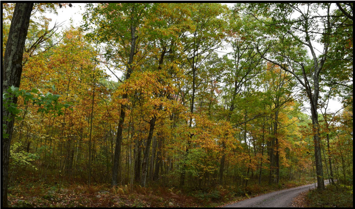
Sassafras Road, Thornhurst Tract, Pinchot State Forest.