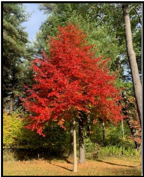
Vivid black gum.

Moshannon State Forest staff reported best color in Clearfield County forests. Red/sugar maple, black gum, sassafras, sweet birch, and ferns are displaying full color. Oaks are showing some yellow and red, as well. Suggested drives to see the fall color in Centre County are State Beaver and Strawband Beaver roads. In Clearfield County, suggested paved routes are Route 879 and the Quehanna Highway. State Forest Roads in Clearfield County with the best color are Caledonia Pike, Medix Grade, and Jack Dent roads. Rain and wind this weekend could cause many leaves to fall, so don't wait to experience the fall scenery.