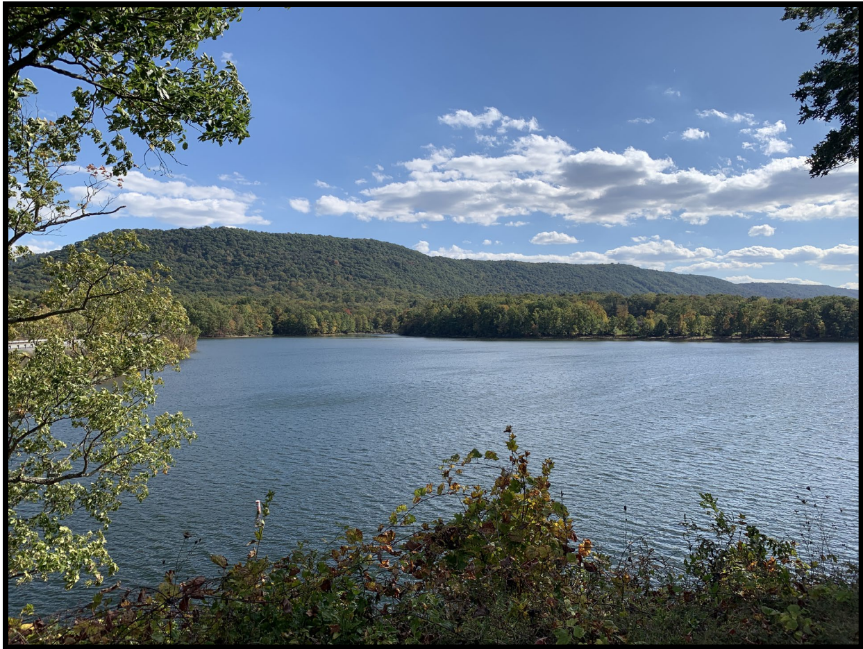
Raystown Lake at Entiken.