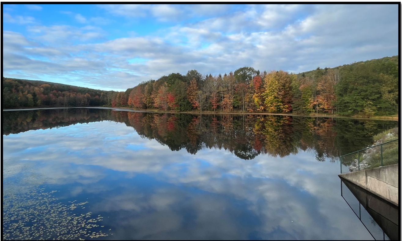
Irrigation pond at Penn Nursery, Spring Mills.

Forestry staff at the Mira Lloyd Dock Resource Management Center (Centre County) said a drive on Route 45 showed a remarkable color shift in the valley as the oak species are catching up to the northern hardwoods. Peak conditions began during the latter part of the last forecast period and should continue into next week. Suggested destinations to admire the vibrant shades are Poe Paddy, Poe Valley, Penn-Roosevelt, or Reeds Gap State parks.