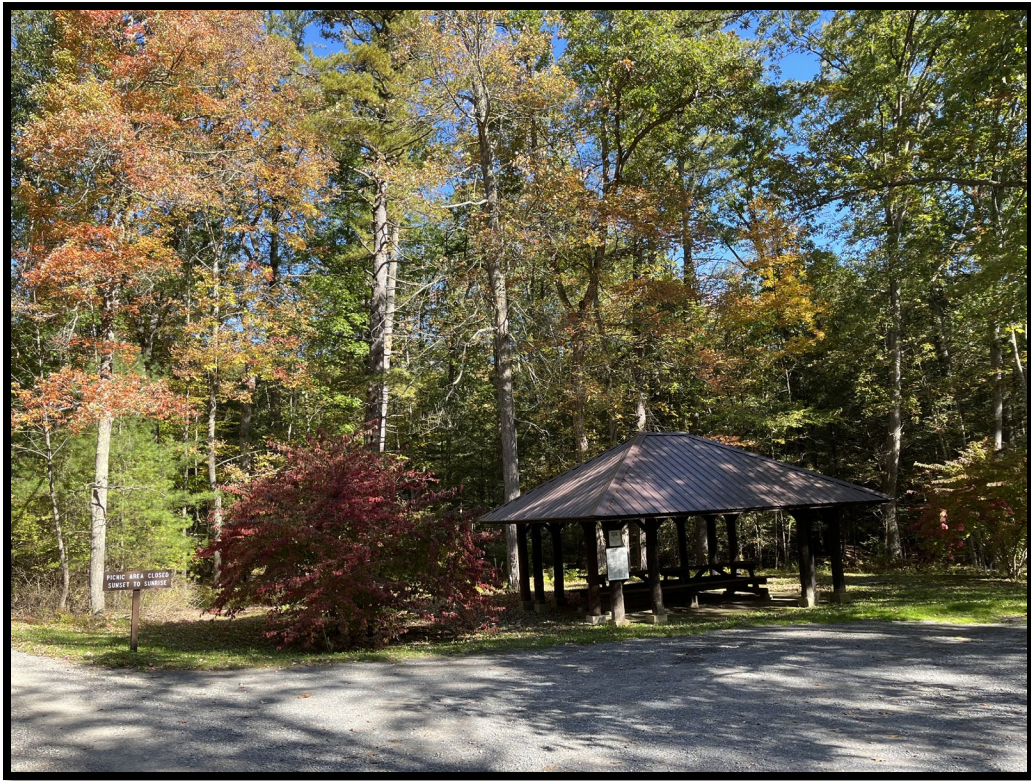
Warm colors at Hairy Johns Picnic Area, Bald Eagle State Forest.

displaying peak color. Because these species are not dominant, green oak leaves are most prominent across the landscape. Huntingdon County colors are mixed with a few pockets of good color, but peak is still roughly two weeks away. The best places to see some colorful foliage this weekend will be on ridgetops and areas where there is a greater component of maple and birch trees. Nice color can be observed on the northern stretches of the Mid-State Trail and Raystown Lake.