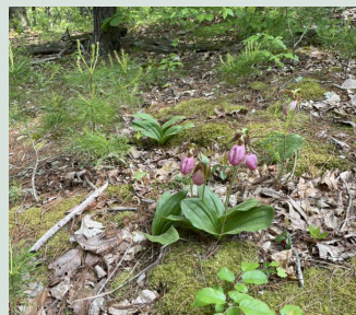
Pink ladies slipper wildflowers appear in early spring.