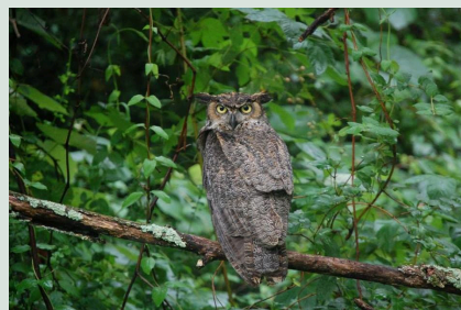
Great horned owl