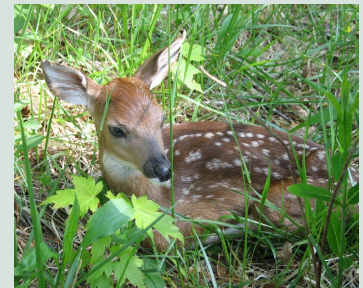
White-tailed deer are common in the natural area.