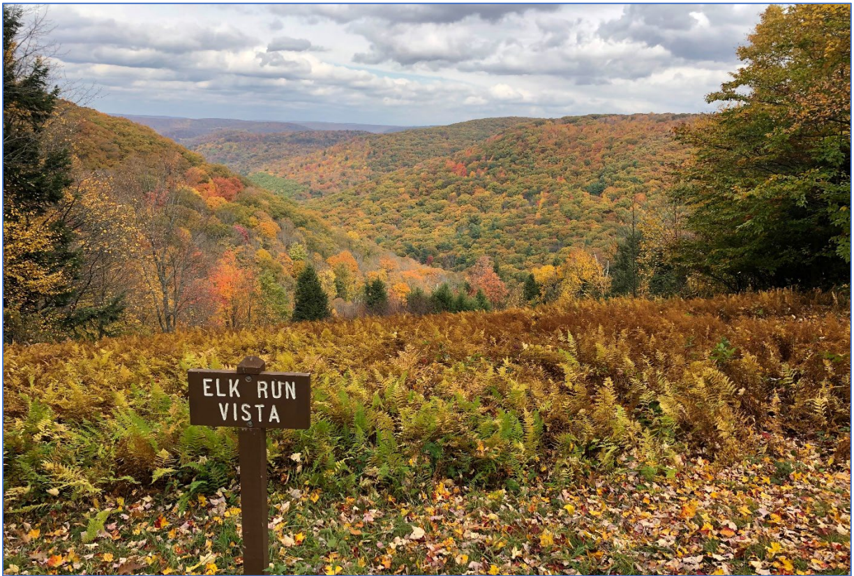
Elk Run Vista on Cedar Mountain Road, Tioga State Forest.

Staff in Tiadaghton State Forest said northern hardwoods are past prime in the district, but oak stands are now colorful. Routes 414 and 44 offer pleasant, scenic drives in the area. Hikers should focus on Miller Run Natural Area or either of Algerine or Wolf Run Wild areas for attractive fall color.