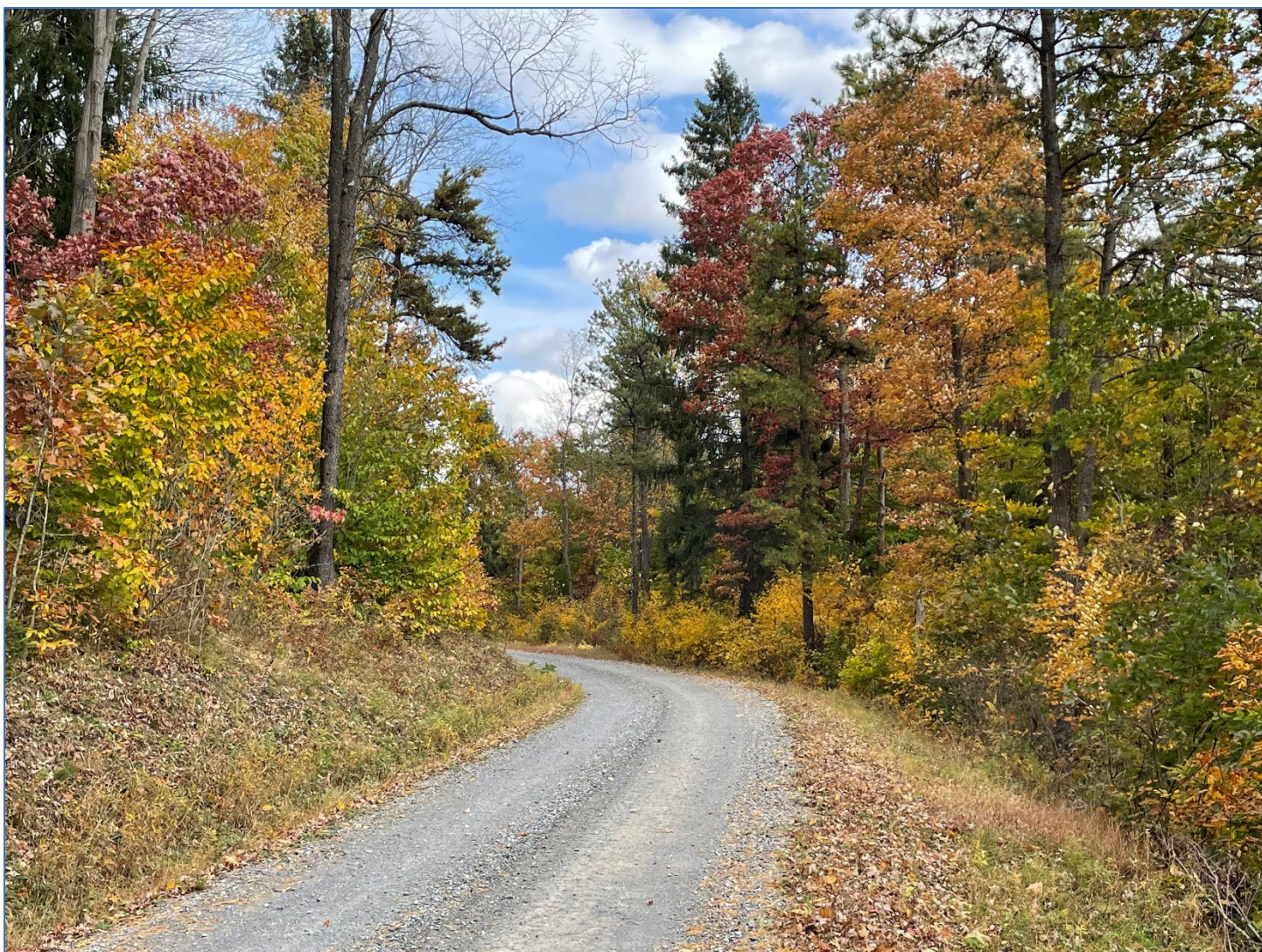
Warm fall colors on Blackwell Road, Moshannon State Forest.