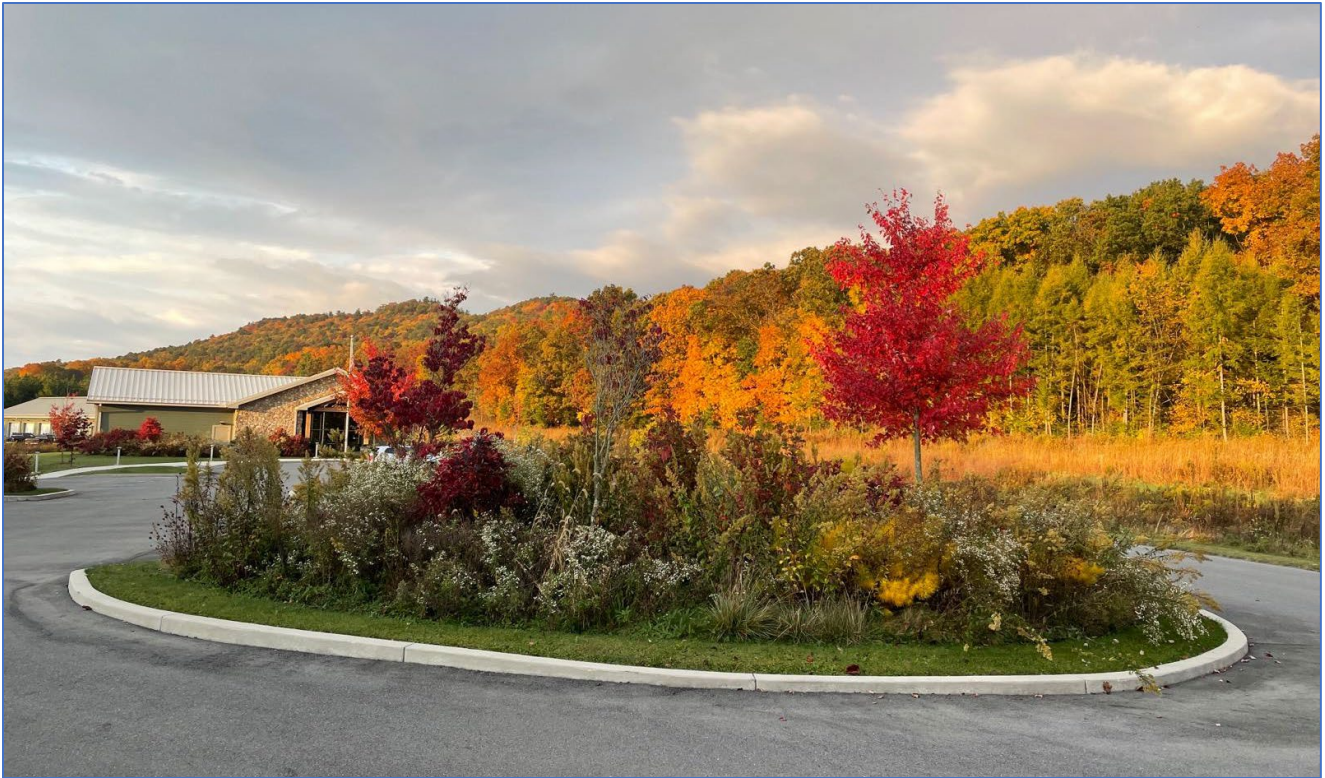
Fantastic scenery around the Buchanan State Forest Resource Management Center.

Forestry staff at Weiser State Forest are noticing brilliant tones of yellow on hickory, tulip poplar, black birch, and some oaks. Variable shades of orange and red are displayed by black gum, maples, sassafras, white oak, and dogwoods. Conditions in the area are very favorable for fall color viewing now. The Roaring Creek Tract and Haldeman Tract hang glider launch area are great spots to enjoy the fall colors occurring on state forest and beyond. In the northern end of the district, peak colors are still present except in oaks, and some leaves are falling. Recommended scenic drives are routes 42 or 54 from Columbia County into Schuylkill County.