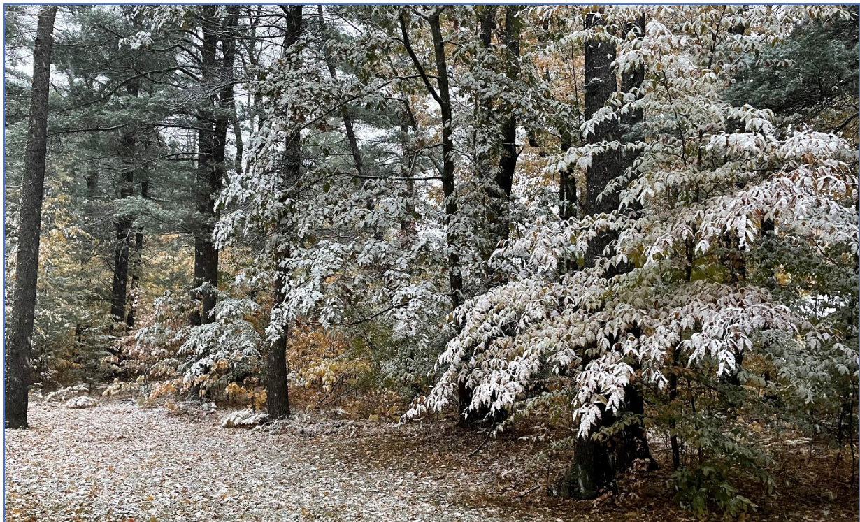
Heavy, wet snow yesterday took down many leaves in Moshannon State Forest.

The Clearfield County Service Forester (Moshannon State Forest) said good color remains but it is starting to fade. Frosty nights and windy days have caused maples to shed leaves. Remnants of last week's show remain, but bare spots are developing. Bright yellow is now found on American beech, witch-hazel, sassafras, and striped maple. These species, many of which occupy the lower canopy, provide a pleasant contrast with the taller oaks. Most oaks are beginning to change from green to muted yellow and orange. A recommended driving loop on Moshannon State Forest is Mud Run Road, Tyler Road, Blackwell Road, Saunders Road, Caledonia Pike, McGeorge Road, back on Tyler Road to Mud Run Road.