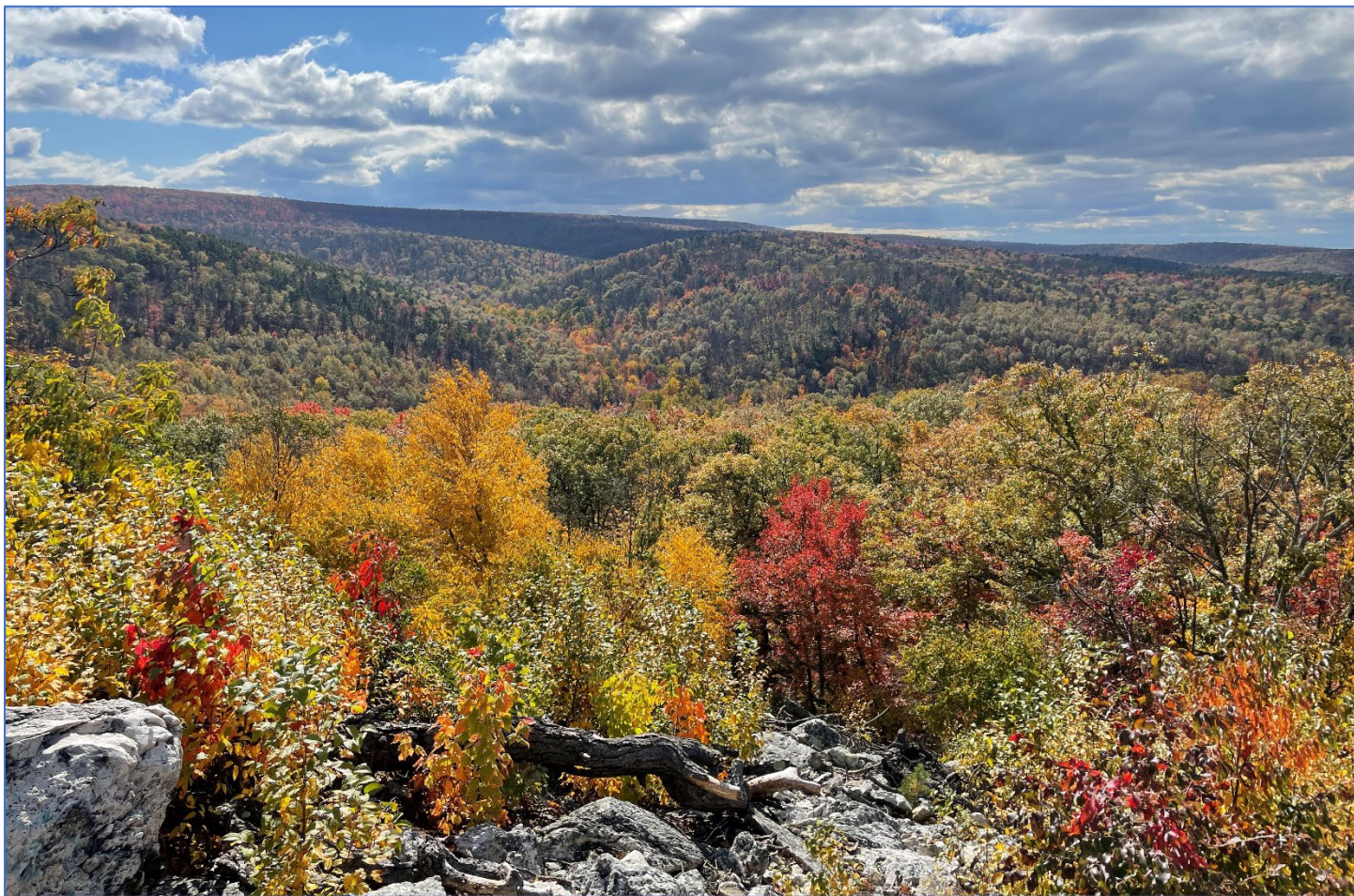
The view from Buzzard's Rock, Michaux State Forest.