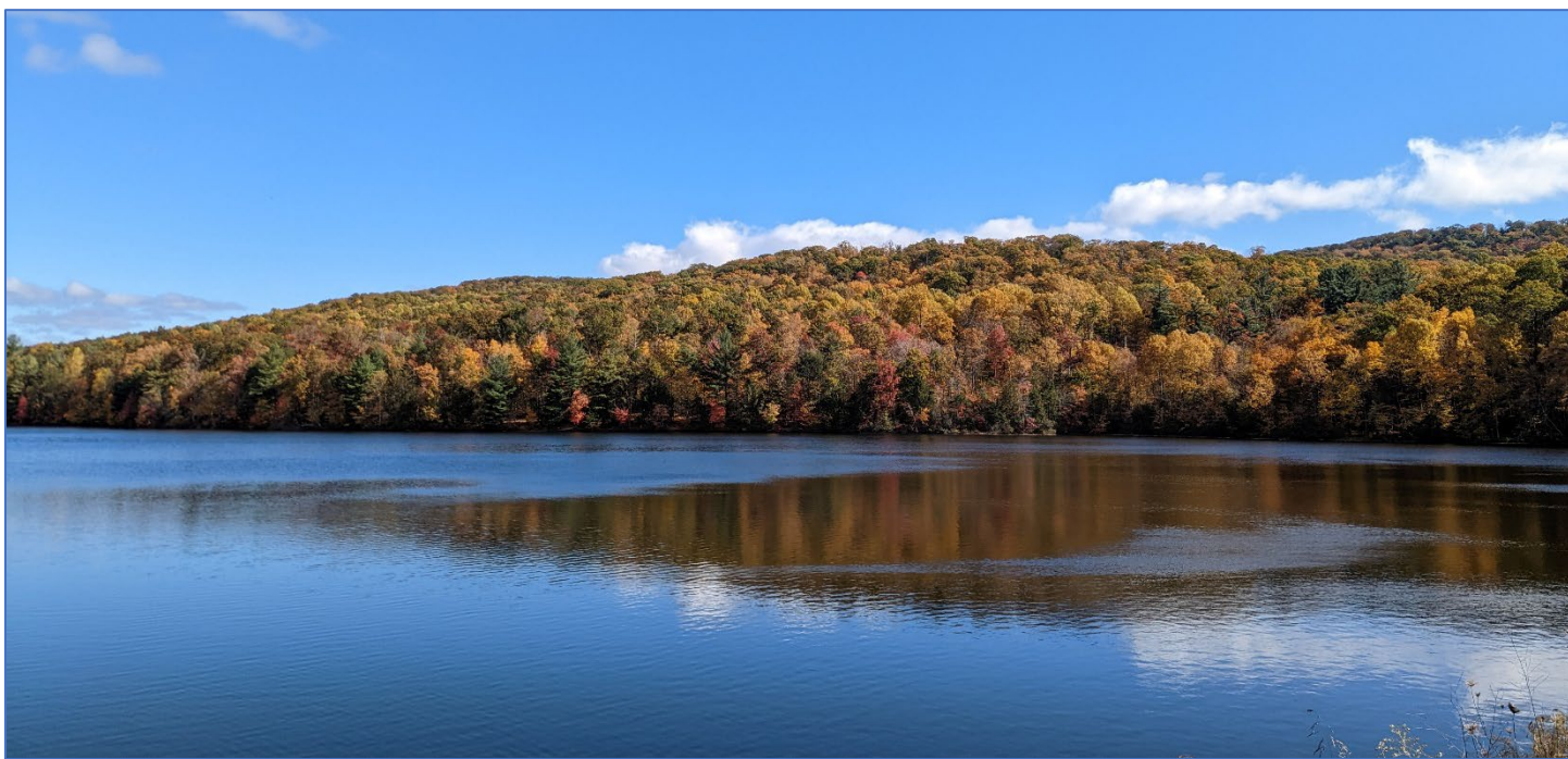
The beautiful Waynesboro Reservoir.

In the Trough Creek Division of Rothrock State Forest (Huntingdon County), colors were stunning last weekend and peak color should hold on through the early part of this forecast period. In many parts of the district, best leaf color is