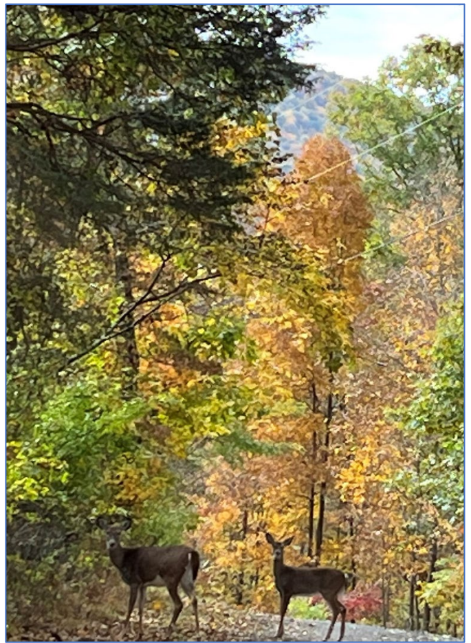
L: Flaming sugar maple color, southern Huntingdon Co. R: Even the deer seem to be appreciating the fall color.