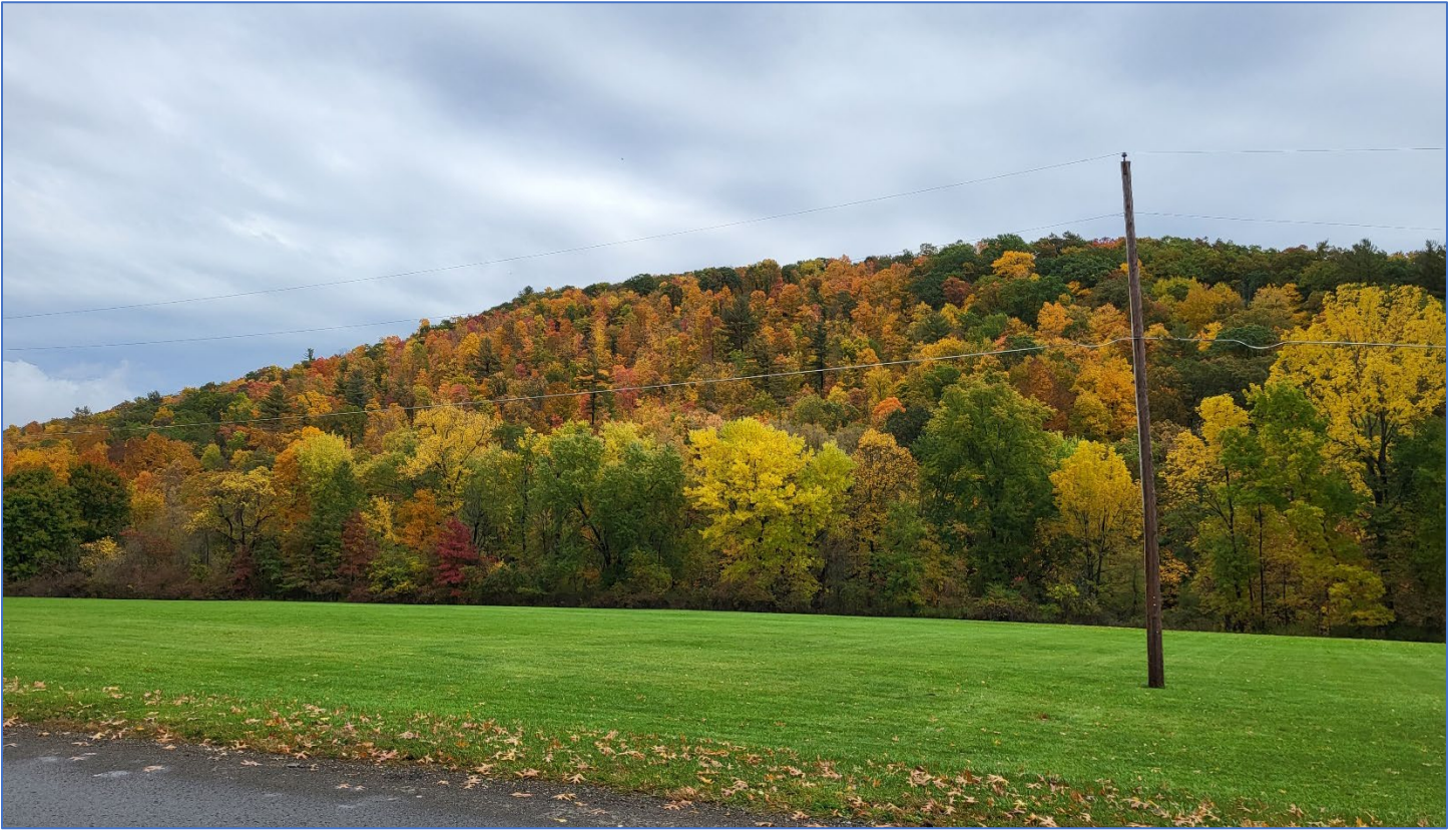
Fall color is still amazing in Warren, PA.

The district manager in Cornplanter State Forest District (Warren, Erie counties) reported oaks and hickories are displaying brownish-red and bright gold, respectively. Many other species have already displayed their best colors and are now dropping their leaves, especially with the recent rains. Some green spots are still visible on the hillsides so there are still opportunities to catch the fall colors, but don't delay. Drives to view the beautiful scenery continue to be Route 62 along the Allegheny River, US 6 in the Warren area, and Route 8 from southern Venango into Erie County.