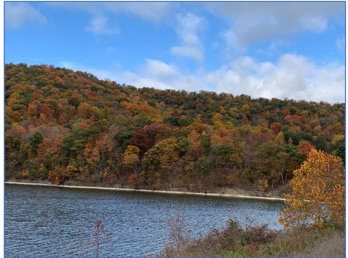
Raystown Lake.

The Clearfield County Service Forester (Moshannon State Forest) said good color remains but it is starting to fade. Frosty nights and windy days have caused maples to shed leaves. Remnants of last week's show remain, but bare spots are developing. Bright yellow is now found on American beech, witch-hazel, sassafras, and striped maple. These species, many of which occupy the lower canopy, provide a pleasant contrast with the taller oaks. Most oaks are beginning to change from green to muted yellow and orange. A recommended driving loop on Moshannon State Forest is Mud Run Road, Tyler Road, Blackwell Road, Saunders Road, Caledonia Pike, McGeorge Road, back on Tyler Road to Mud Run Road.