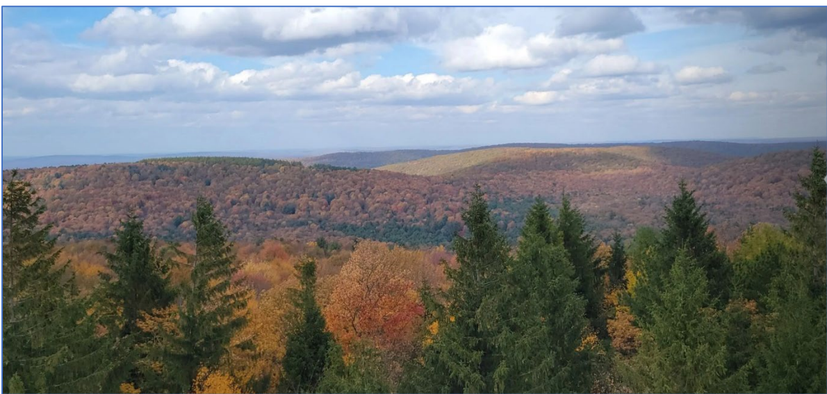
View from Coffin Rock Fire Tower, Sprout State Forest.

The Clinton County service forester (Sprout State Forest) reported peak conditions now, with all the ridges “ablaze with color.” The upper plateau region is fading, but there will still be plenty of color to be seen by visitors this weekend.