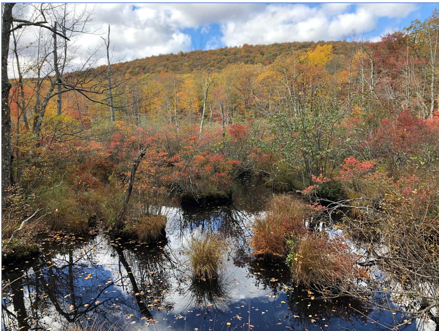
Headwaters of Tarkill Creek, Delaware State Forest.