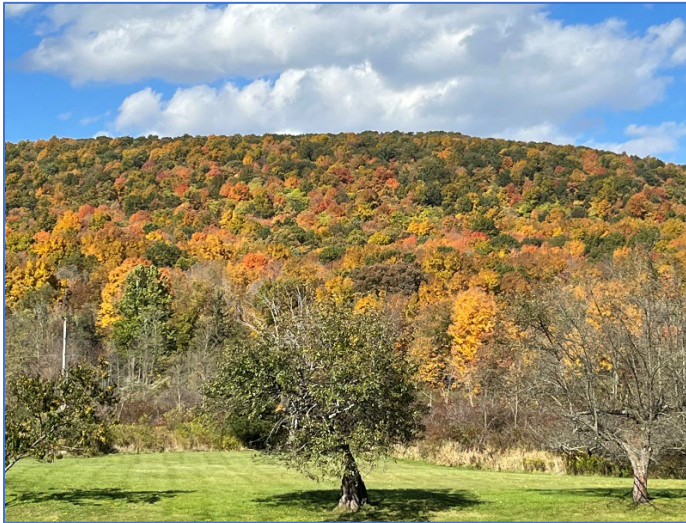
Route 994 near Cooks.

beginning now and will likely continue through the next week or so. Hickory, poplar, and maple are contributing vivid shades of yellow, orange, and red. Oaks and beech have also started to change, dappling the ridgetops with more vibrant colors. This weekend should be the best chance to catch a glimpse of this yearly spectacle, especially with the beautiful weather expected this weekend. To enjoy the fall scenery, recommended drives include routes 994, 913, and 655, or take a hike at Raystown Lake or Warriors Path State Park. Ridgetop vistas will always be the best places to observe maximum color, but everywhere in the forest is beautiful right now.