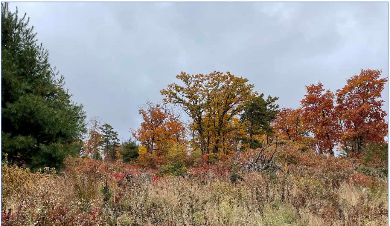
Sand Mountain region, Centre County.

In Bald Eagle State Forest District, the Mifflin, Juniata, and Union County service forester said most deciduous species are still showing peak color, which should remain through the weekend. Oaks are also contributing to the color palette now, with a few still showing green for excellent contrast. Visitors to the district should consider a picnic in the beautiful Hairy Johns Picnic Area, or an excursion to Poe Valley, Reeds Gap, or R.B. Winter State parks.