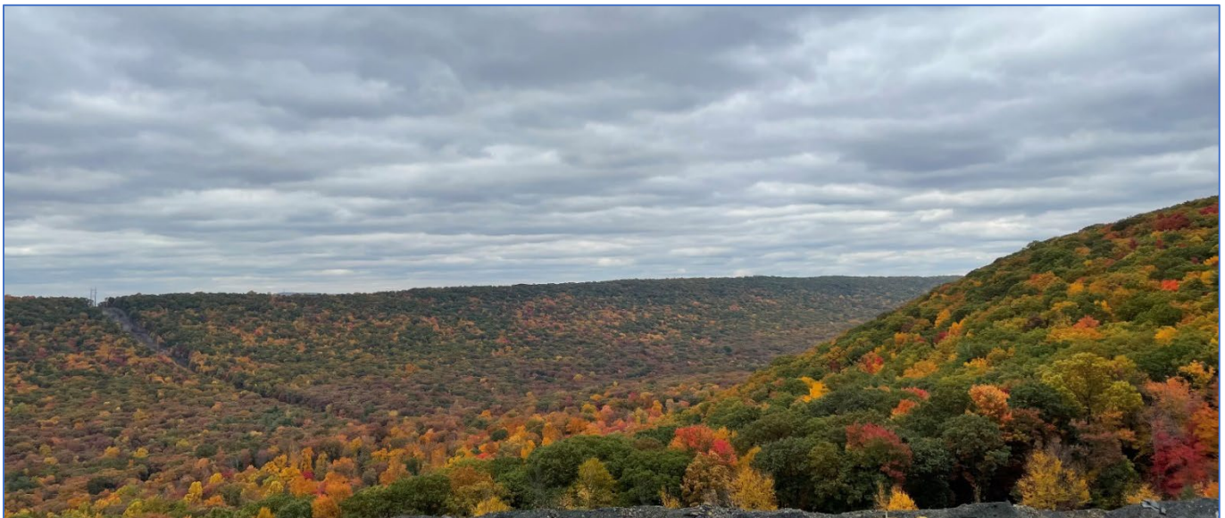
View from the Natalie Culm Bank looking north to Roaring Creek Tract, Weiser State Forest.

Forestry staff at Weiser State Forest are noticing brilliant tones of yellow on hickory, tulip poplar, black birch, and some oaks. Variable shades of orange and red are displayed by black gum, maples, sassafras, white oak, and dogwoods. Conditions in the area are very favorable for fall color viewing now. The Roaring Creek Tract and Haldeman Tract hang glider launch area are great spots to enjoy the fall colors occurring on state forest and beyond. In the northern end of the district, peak colors are still present except in oaks, and some leaves are falling. Recommended scenic drives are routes 42 or 54 from Columbia County into Schuylkill County.