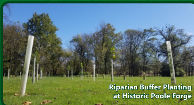
Riparian Buffer Planting at Historic Poole Forge