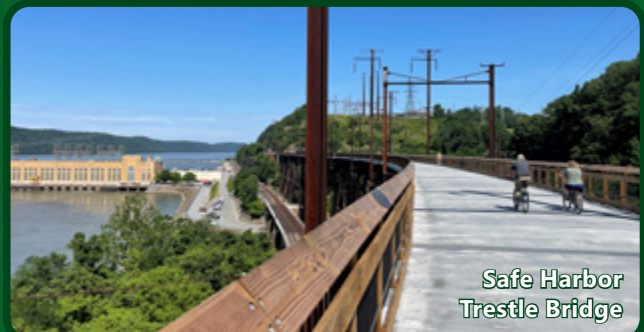
Safe Harbor Trestle Bridge

Scan this QR code to view the latest regional advisor contact information.