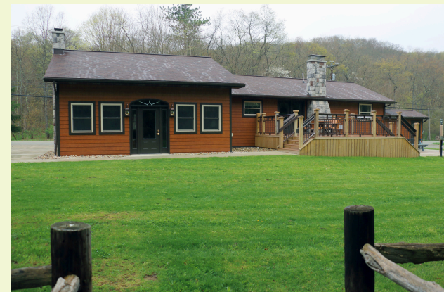
Copper Kettle Lodge