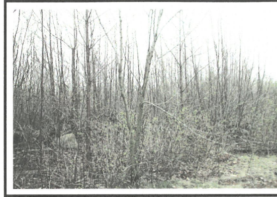
13 yr old clearcut

Please be advised that some of our newer clearcuts and shelterwood cuts have been fenced in order to keep deer from eating the new flush of tree seedling growth.