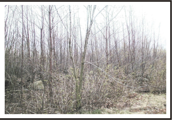
13 yr old clearcut

Please be advised that some of our newer clearcuts and shelterwood cuts have been fenced in order to keep deer from eating the new flush of tree seedling growth.