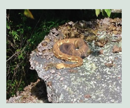
Hikers beware, rattlesnakes are found in the wild area.