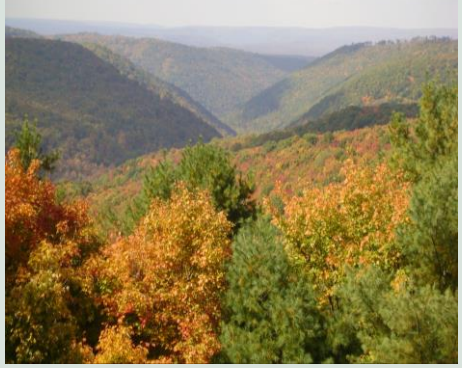
Fish Dam Overlook.