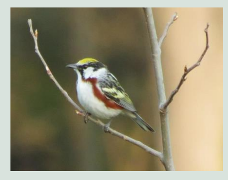
Chestnut-sided warblers can be found in the wild area.