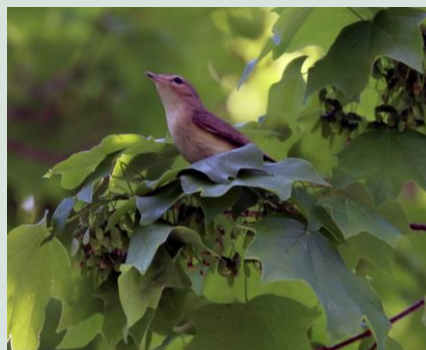
The red eyed vireo prefers the northern hardwoods found in the wild area.