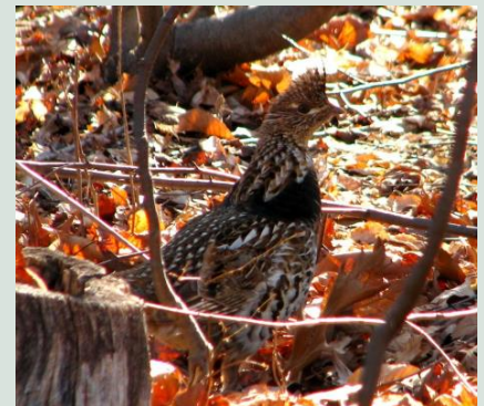
Although much less common now due to West Nile virus, ruffed grouse can still be found in the wild area.