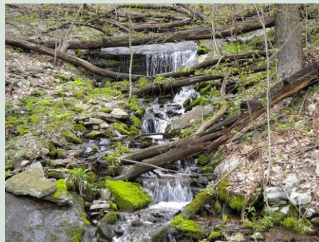
Tributary of Clear Shade Creek