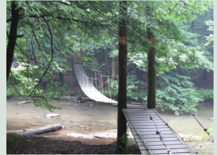
Clear Shade Creek supports wild brook and brown trout.