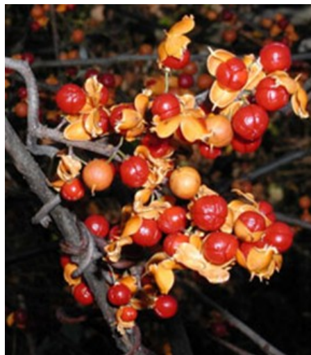
Leslie Mehrhoff, Univ. of Connecticut

Oriental bittersweet is a deciduous, climbing, woody vine that can grow up to 60 feet in length. Vines can grow up to four inches in diameter. The alternate, elliptical leaves are light green in color, finely toothed and two to five inches in length. Fruits are round and yellow, splitting to reveal bright red berries through the fall and winter months.