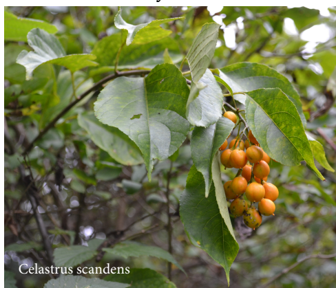
Brett Pifer, DCNR - BOF

Oriental bittersweet closely resembles the native American bittersweet ( Celastrus scandens ), but American bittersweet has flowers and fruits at the ends of its branches, rather than in the axils of the leaves, like the Oriental variety.