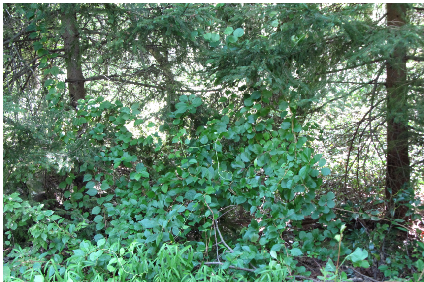
Oriental bittersweet along state forest road