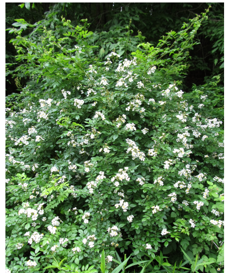
Deric Case, DCNR - BOF

Multiflora rose forms impenetrable thickets that exclude native plant species. This shrub grows very prolifically in riparian areas, where its inedible leaf litter can change the composition of the aquatic macroinvertebrate community. Its occasional habitat of climbing can weigh down trees, making them susceptible to breakage.