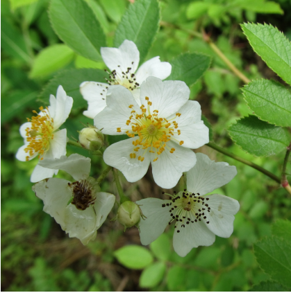
Deric Case, DCNR - BOF