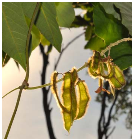
Greg Czarnecki, DCNR

Kudzu is a climbing, deciduous vine that can reach lengths of over 100 feet. Leaves are alternate, compound (with three lobed leaflets), hairy and up to five inches in length. Clusters of purple, fragrant flowers appear in midsummer. Fruits are green to brown, hairy, flat seed pods that are roughly three inches in length and contain three to 10 seeds.