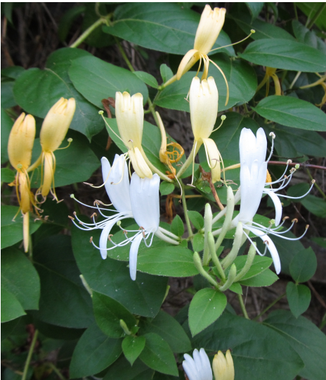
Deric Case, DCNR - BOF