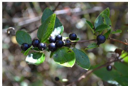
Brett Pifer, DCNR - BOF

This evergreen to semi-evergreen woody vine can grow up to 80 feet in length. It has opposite leaves that are typically oval in shape, although the leaves close to the ground may be lobed ( see photo right ). Fragrant white to yellow flowers appear from the leaf axils between April and July. Small, shiny black fruits develop in the fall.