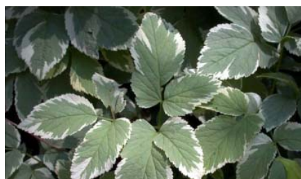
Leslie J. Mehrhoff, Univ. of Connecticut

Goutweed is an herbaceous perennial with branching white rhizomes and compound basal leaves, the latter which can be green or variegated in color. In mid-summer, tall leafy stems produce flat-topped clusters of white flowers.