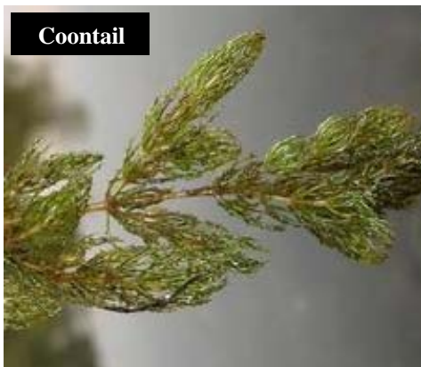
Graves Lovell, Alabama DCNR

There is a native version of watermilfoil – Northern watermilfoil ( Myriophyllum sibiricum ) that looks very similar to the Eurasian species, so extreme care must be taken when treating a waterbody. It also resembles our native coontail ( Ceratophyllum spp.) and the invasive parrot's-feather ( Myriophyllum aquaticum ).