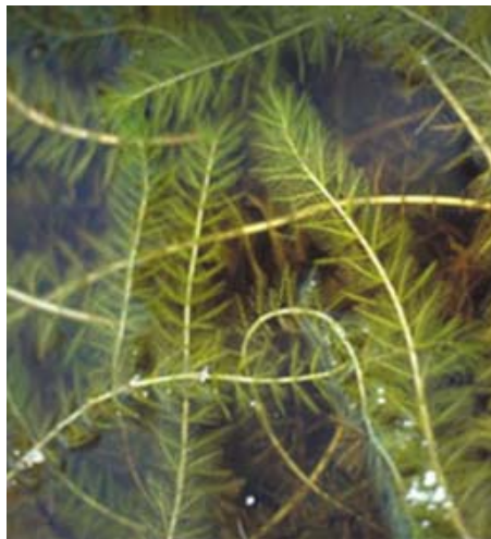
Alison Fox, Univ. of Florida

Found in lakes, ponds and other aquatic environments where stagnant to slow moving water is found. It prefers fresh water but can tolerate brackish conditions. This plant thrives in disturbed areas.