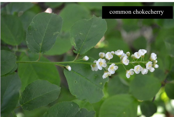
Brett Pifer, DCNR - BOF

Common buckthorn may be confused with native buckthorns ( Rhamnus spp.) and cherries ( Prunus spp.).