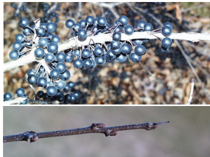
Paul Wray, Iowa State Univ.

Common buckthorn is a dioecious shrub or small tree growing up to 22 feet high. Twigs are often tipped with a spine. Cutting the stems reveals distinctive yellow sapwood (bottom photo) and pink to orange heartwood. The glossy, dark green leaves remain late into fall, and are broadly oval with up-curved veins and toothed margins. In spring, dense clusters of yellow-green flowers emerge from stems near the bases of leaf stalks. Small black fruits appear in fall.