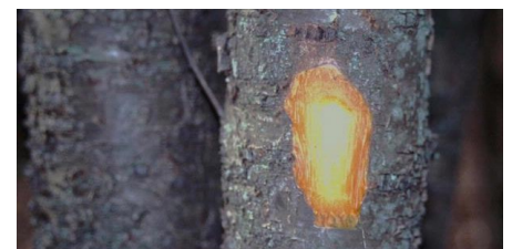
John M. Randall, The Nature Conservancy

Common buckthorn forms dense, even-aged thickets, which crowd out native shrubs and herbs and prevent woody plant regeneration. When open woodlands, savannas and prairies are invaded, fire is suppressed, changing the disturbance regimes of these ecosystems. Invasive shrubs like common buckthorn are population sinks for nesting songbirds due to higher predation rates. Common buckthorn is also an alternate host of oat crown rust, which lowers oat yield and quality.