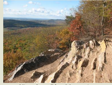
View from Blue Mountain