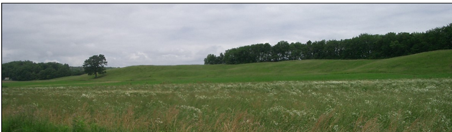
View of the Jacksville Esker from West Liberty Road.

The esker's configuration gives clues to its formation and the thickness of the glacier. The winding ridge of sand and gravel was deposited as meltwater dropped sediment inside a tunnel at the base of the glacier. Upstream where the ice was thicker, the esker is more sinuous. Toward the front of the glacier where ice was thinner, the esker is straighter. This is because surface fractures extending through the ice to the base of the glacier controlled the orientation of the "tunnel." At the end of the esker lies fan-shaped glacial deposits of sand and gravel. These deposits are the result of the melting glacier dumping sediment as a delta into a glacial lake.