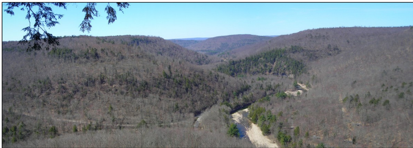
View looking to the northwest over Loyalsock Creek.

The plateau is capped by resistant sandstone and conglomerate of the Pottsville Formation. Below the Pottsville are less-resistant shale and siltstone of the Mauch Chunk Formation. This unit, along with the underlying Burgoon Sandstone, makes up the rim and canyon walls. The Huntley Mountain Formation, below the Burgoon, is present at the Loyalsock Creek area below. All these rocks are nearly flat lying and have been subject to erosion for millions of years. Glacial ice also covered the entire area but did not drastically change the landscape here.