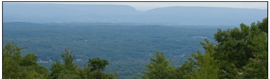
View of the Delaware Water Gap in Kittatinny Mountain, about 13 miles to the southeast.