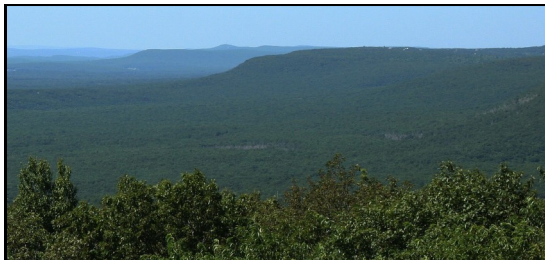
View to the west of the Pocono Plateau escarpment.