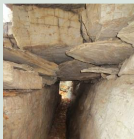
Interesting rock formations can be found along the Mid State Trail.