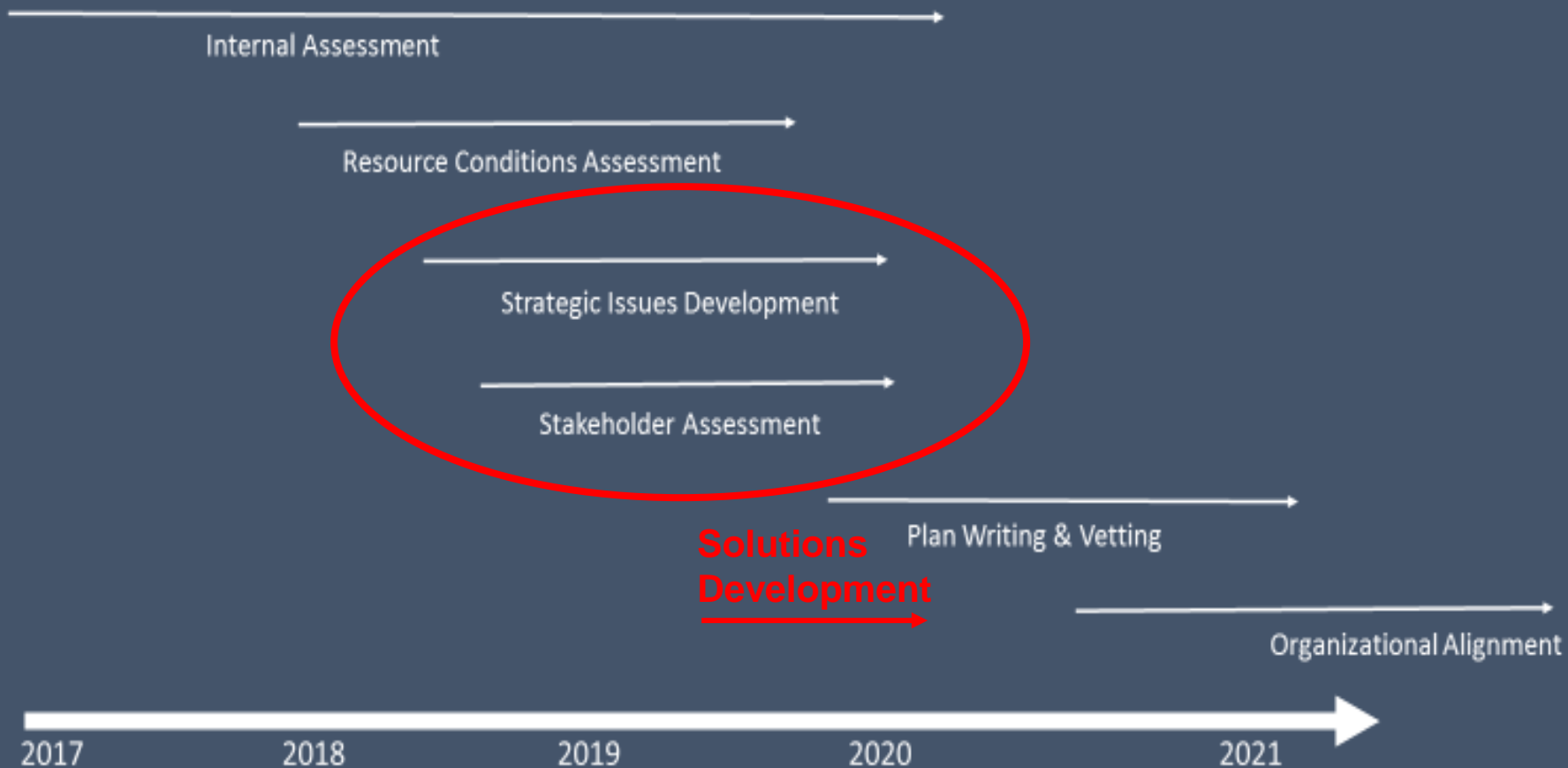
Bureau of Forestry Strategic Planning Timeline