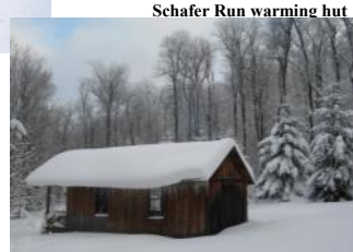
Schafer Run warming hut