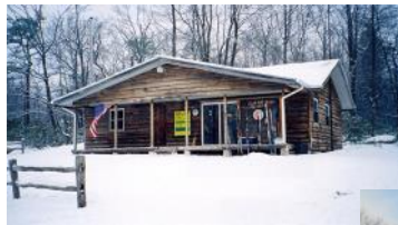
Laurel Mountain warming hut

The Laurel Summit Nordic Ski Patrol can be reached on the weekends during the winter by contacting the warming hut at: 724-238-6568.