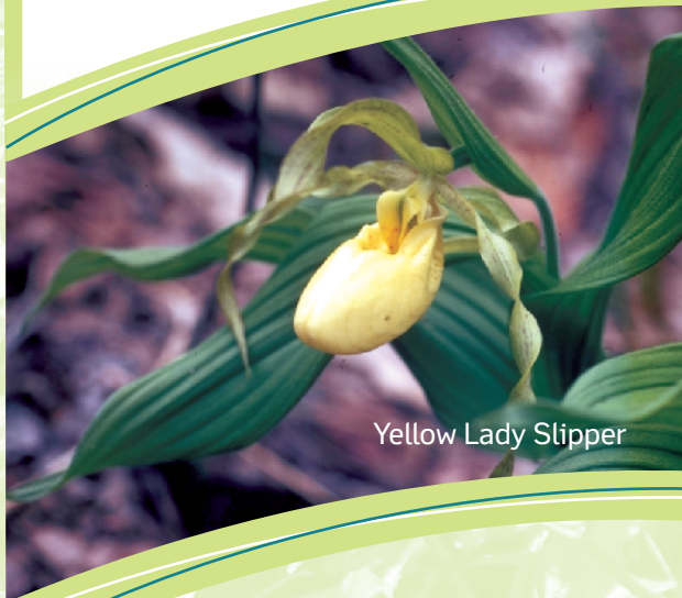
Yellow Lady Slipper