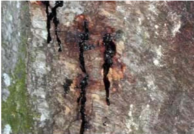
Ooze bleeds from a canker on an infected oak.

season by insects or pathogens may appear dead, but leaves usually reflush later in the season. Canker rots, slime flux, leaf scorch, root diseases, freeze damage, herbicide injury, and other ailments may cause symptoms similar to those caused by P. ramorum . Oak wilt, oak decline, and red oak borer damage are potentially the most confusing. See the reverse of this sheet for comparisons with sudden oak death symptoms.