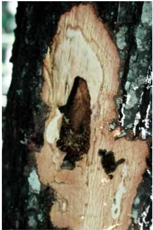
Tunnels in the inner bark indicate the presence of red oak borer.

Oak Wilt: http://www.na.fs.fed.us/spfo/pubs/howtos/ht_oakwilt/toc.htm