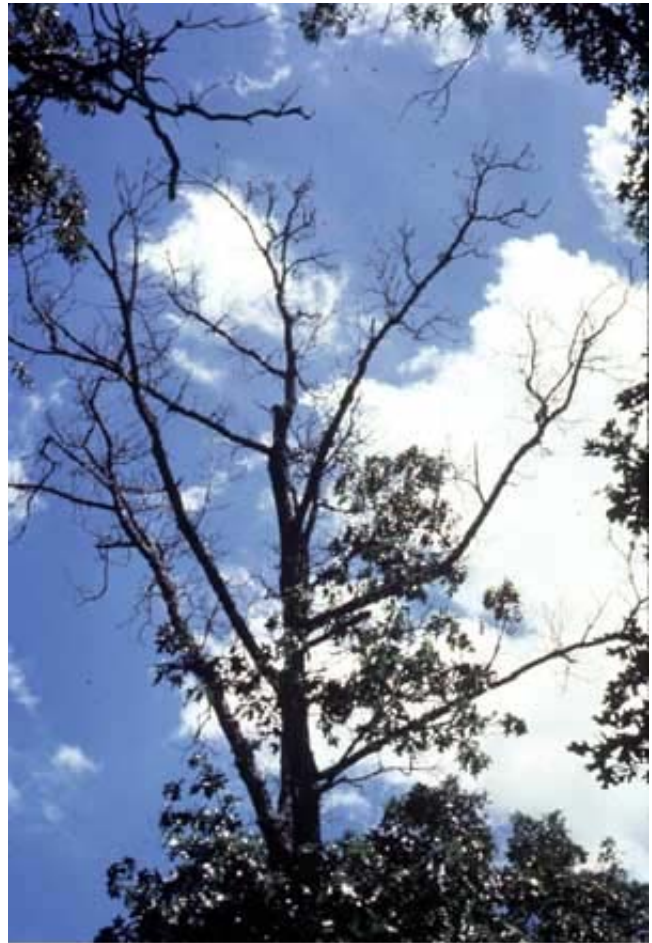
Oak decline can take years to kill an entire tree.