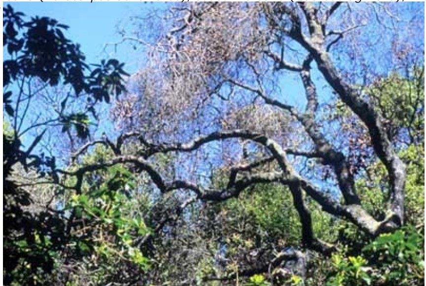
In California Phytophthora ramorum causes crown symptoms and tree mortality.

A phenomenon known as Sudden Oak Death was first reported in 1995 in central coastal California. Since then, tens of thousands of tanoaks ( Lithocarpus densiflorus ), coast live oaks ( Quercus agrifolia ), and California black oaks ( Quercus kelloggii ) have been killed by a newly identified fungus, Phytophthora ramorum . On these hosts, the fungus causes a bleeding canker on the stem. The pathogen also infects Rhododendron spp., huckleberry ( Vaccinium ovatum ), bay laurel ( Umbellularia californica ), madrone ( Arbutus menziesii ), bigleaf maple ( Acer macrophyllum ), manzanita ( Arctostaphylos manzanita ), and California buckeye ( Aesculus californica ). On these hosts the fungus causes leaf spot and twig dieback.