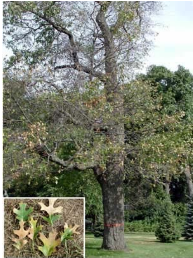
Oak wilt quickly kills most infected trees. Wilting leaves turn brown at the margins (inset) and fall as the tree dies.