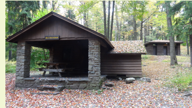
Cabin 2 - Buchanan