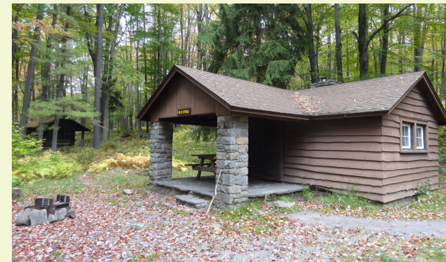
Cabin 10 - Sproul