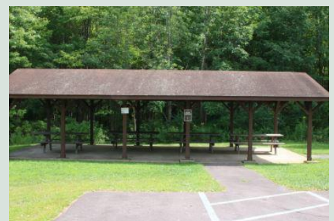
Moon Lake group camping pavilion