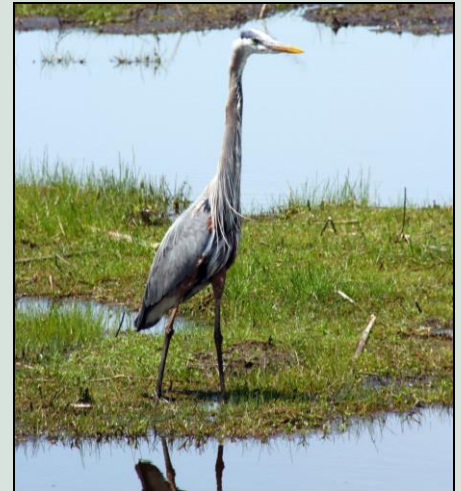
Great blue herons are often observed and nest in the natural area.