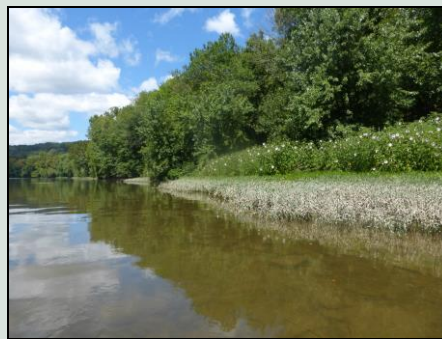
Shores of the islands comprising the archipelago show layers of vegetation with differing tolerances to inundation.