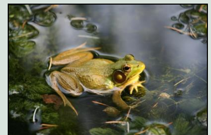
Green frogs are common on Sheets Island.