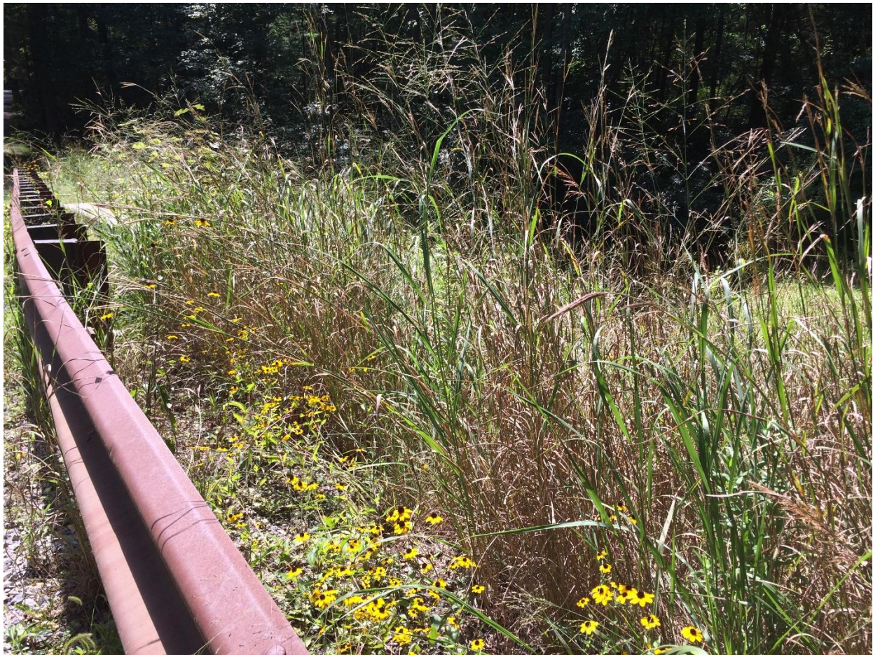
Native seed mix planted at site of new bridge construction, Michaux State Forest.

The Bureau of Forestry's mission includes the conservation of the commonwealth's native wild plants. While planning and carrying out any type of activity on state forest lands where seeding or planting is necessary, the Bureau is committed to planting native species as often as possible. As a leader in conservation in Pennsylvania, the Bureau of Forestry should serve as a leader in the use of native plants in all management projects and set an example to all citizens of the Commonwealth.