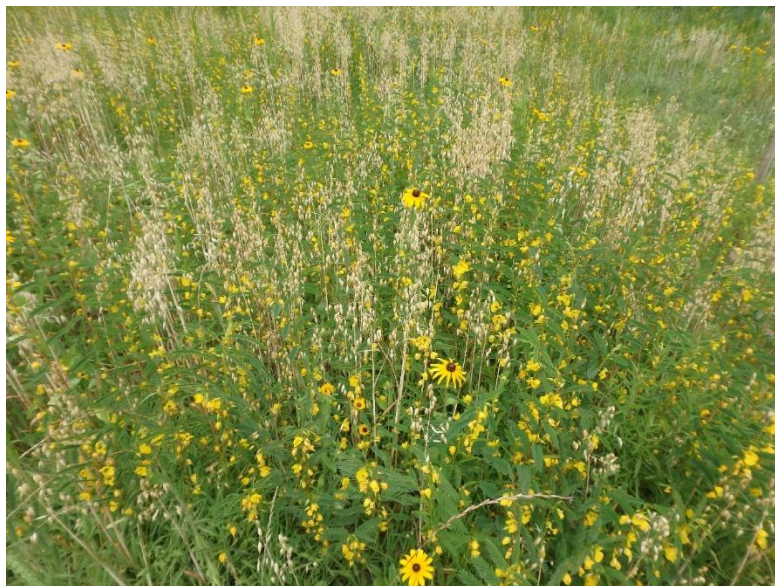
Partridge pea and black-eyed susan establishment – three months after Spring seeding