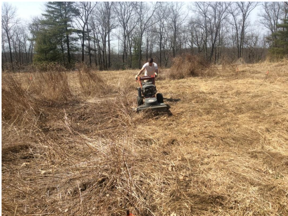
Dormant season maintenance mowing in early March