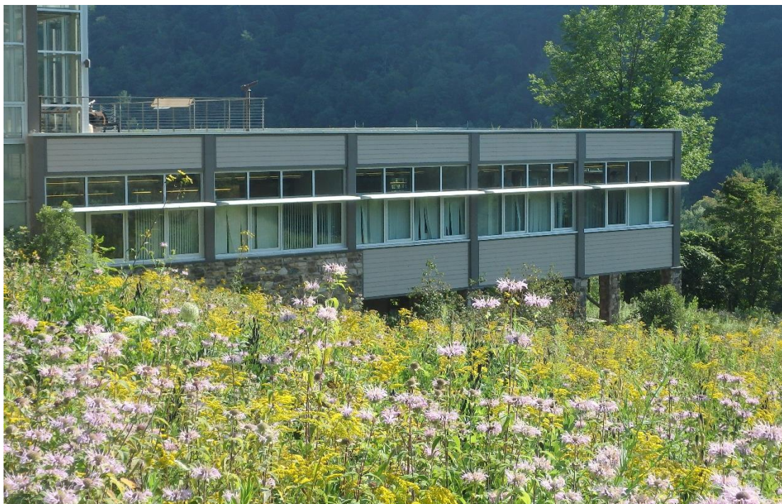
Native meadow planting at Tiadaghton Resource Management Center

* The seed awns of the wildryes ( Elymus spp. ) have been shown in certain circumstances to become ingested or attached to a dog's fur or paws, penetrating the skin and leading to the potential for grass awn migration disease. Use these species with caution in areas that may be utilized by hunters.