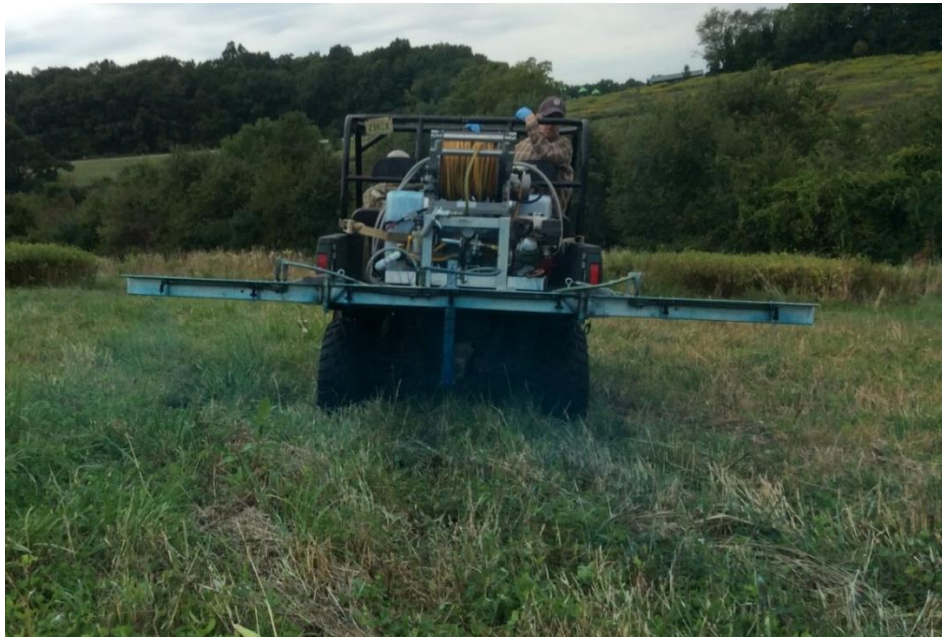
UTV-mounted sprayer applying herbicide to reduce existing cool-season grasses prior to meadow seeding.