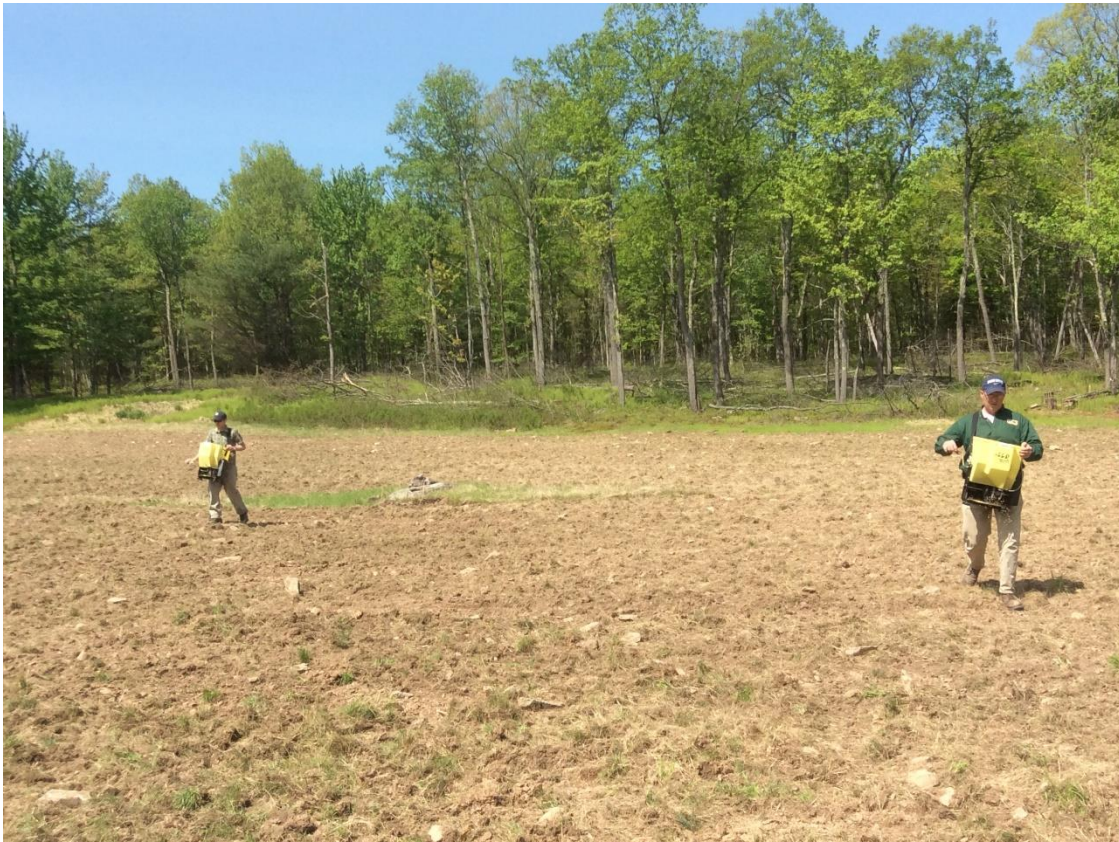
Seeding an opening using hand-crank native seed spreaders.