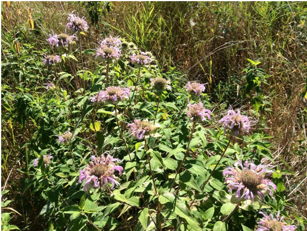
Wild bergamot growing on permanent herbaceous opening.

Non-native plant species in Category 1 (invasive) should not be planted. If they have been planted in the past, treatment or removal is recommended. Species listed under category 2 (potentially invasive) will require monitoring. Species listed under Category 3 (non-invasive) species may require monitoring after consultation with Ecological Services. This monitoring should take place once within 5 years of planting and should be completed by district staff. Ecological Services can provide identification assistance in the field if requested.