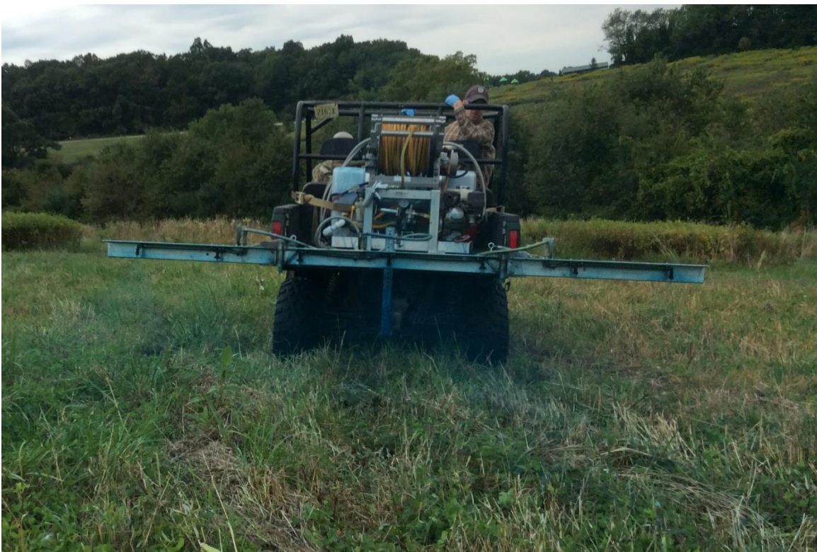
UTV-mounted sprayer applying herbicide to reduce existing cool-season grasses prior to meadow seeding.