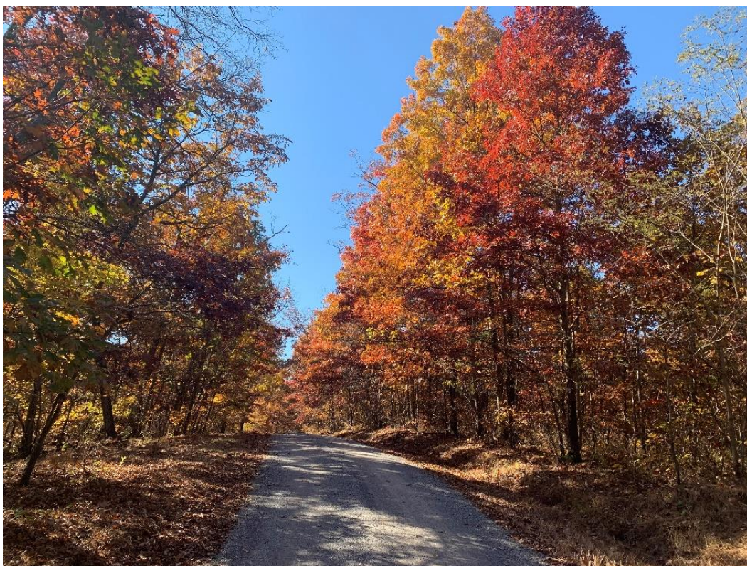
Laurel Run Road, Tuscarora State Forest.

Foresters in Perry County (Tuscarora State Forest) reported there is still some nice color to see in the district. Oaks are currently at peak, along with beech, hickory, and a few maple holdouts. A recommended scenic drive is Laurel Run Road in Perry County.