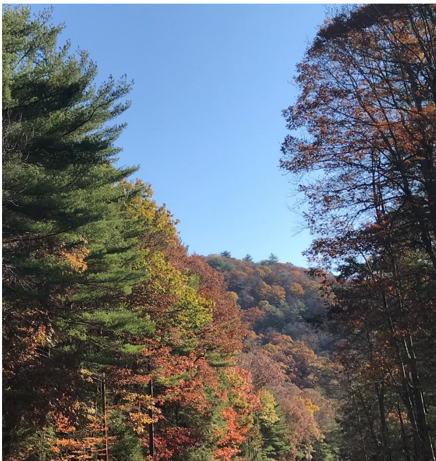
Warm colors from oaks in Bald Eagle State Forest.

Foresters in Rothrock State Forest said that most northern hardwood leaves have long since fallen and colorful hickory leaves are also falling more quickly by the day. Despite the loss of leaves, pockets of beautiful color remain where a few maples and hickories are vivid. Also, oak forests are just past peak after many freezing nights, offering the last phase of pleasant fall hues. While there are still a few oak trees holding onto some leaves out there, they are quickly changing from their yellow and bronze to brown and falling to the ground. The southern portion of Rothrock State Forest has a bit more color than the northern end, but it is fading rapidly.