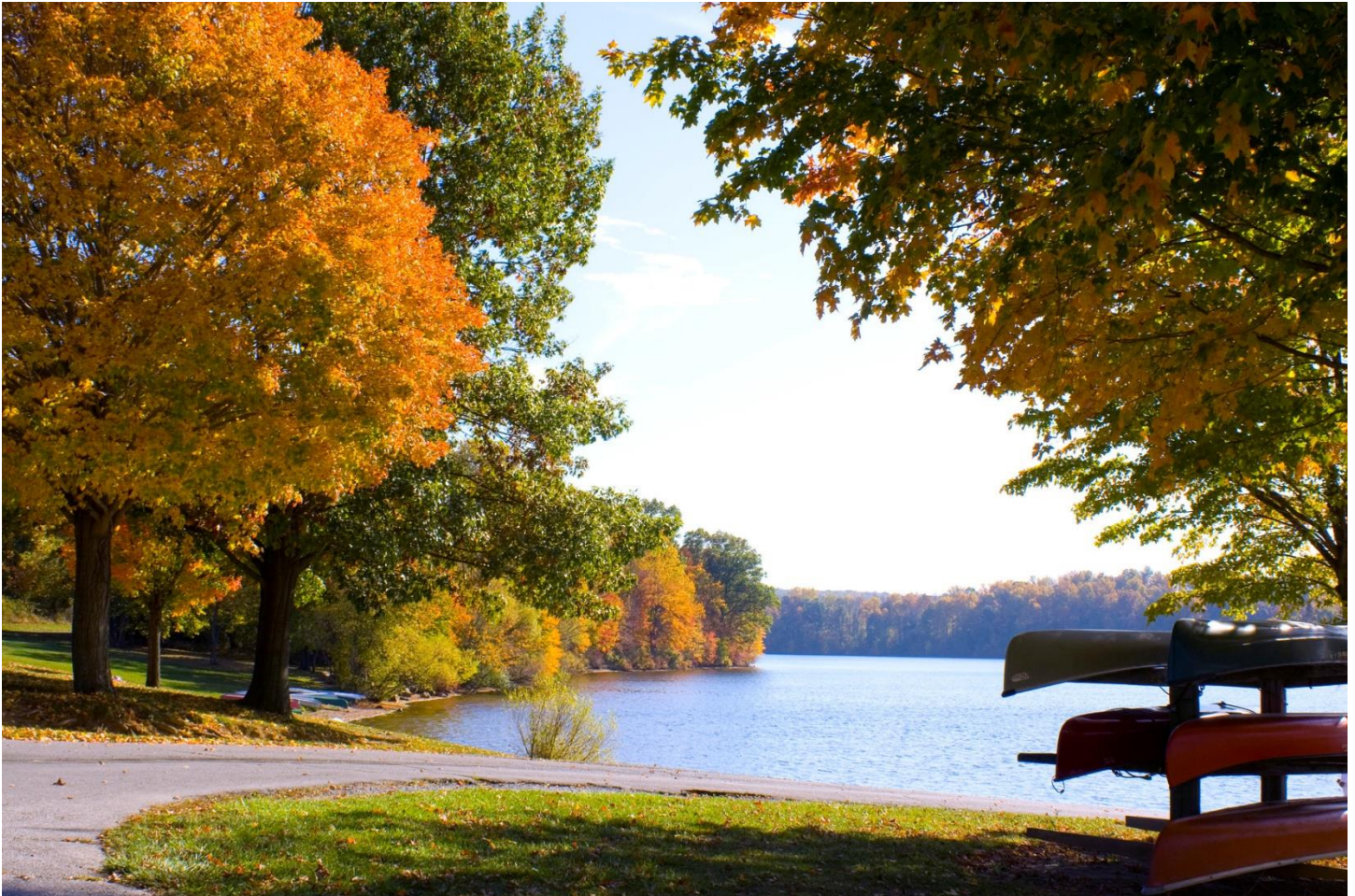
Marsh Creek Lake.

Forests within the southern counties comprising the William Penn Forest District, including Lancaster, Chester, Delaware, and Philadelphia counties are currently at the end of their peak foliage display, with fading conditions expected this forecast week. Maples, hickories, sassafras, oak, and beech are showing a wide array of colors ranging from bright yellow to deep red. Fall foliage sightseers are encouraged to visit Ridley Creek, White Clay Creek, Marsh Creek, Susquehannock, Benjamin Rush, or Neshaminy State parks to observe some of the last, most beautiful autumn color in Penn's Woods.