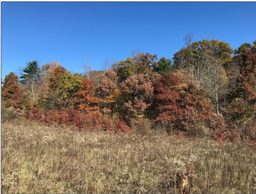
Oak color in Jefferson County off Route 949.

The service forester for Venango and Clarion counties (Clear Creek Forest District) said oaks are still going strong and holding their leaves. Rich maroons, burgundies, golds, greens, and browns provide gorgeous color in oak-dominated forests. Outside of small towns and urban areas, most other trees are bare.