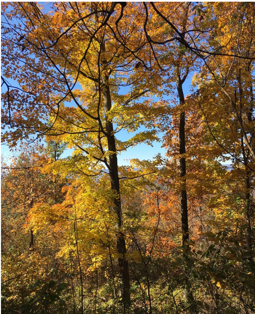
Some maples and hickories are still vibrant in southern Huntingdon County.

Foresters in Buchanan State Forest said the fall foliage season is winding down for the year and this will likely be the last weekend for good viewing. A few maples and hickories are holding onto their leaves, yielding mostly yellow and orange. Oaks have finally started changing, but are mostly brownish in color and are quickly losing their leaves as well. The best color in the district is currently found in the Martin Hill area, Chaneyville Division, Bedford County.