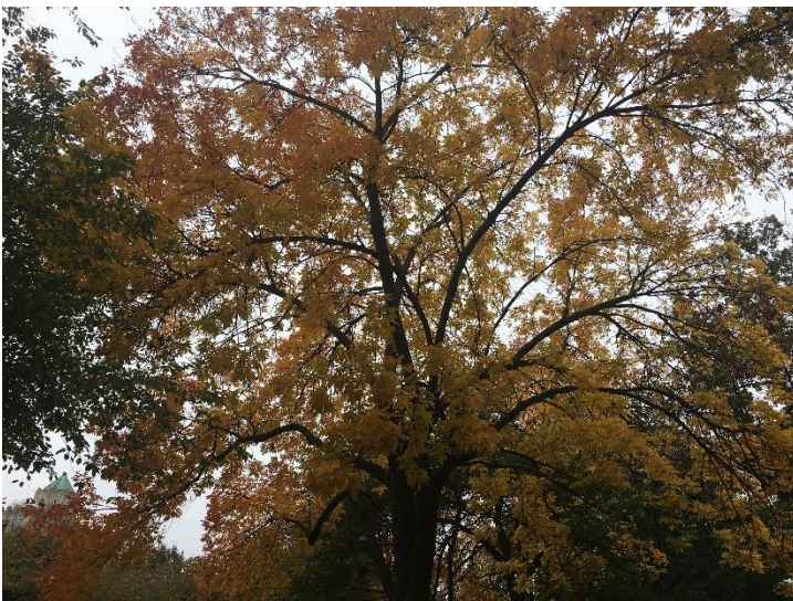
Vivid ash at the state capitol.

The assistant manager at William Penn State Forest said that colors have “popped” in the southern two-thirds of the district and that fall shades have reached peak in Berks County. Fall color enthusiasts are recommended to visit Hopewell Furnace and any state park south and east of Reading, or the Wertz Tract near Wernersville. Beautiful fall colors in beech, sassafras, hickory, and maple await.