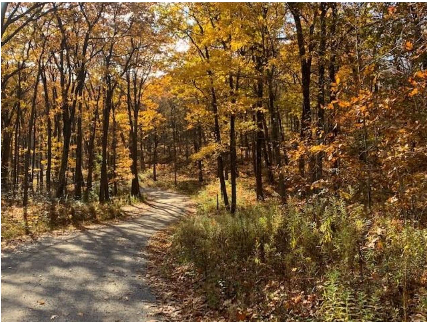
Underwood Road, Moshannon State Forest.