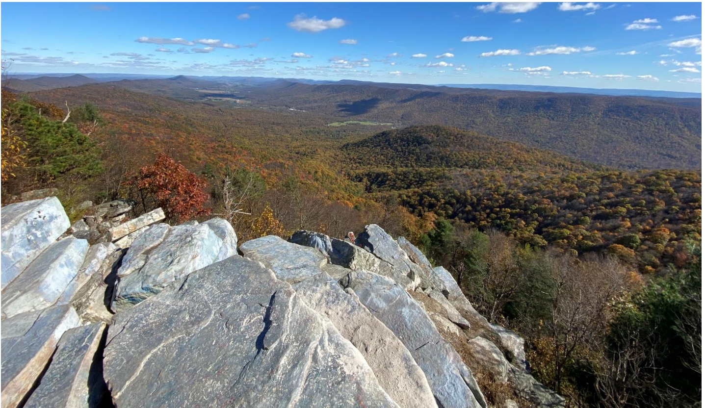
Tower Road vista in Allen's Valley, Bear Valley Division, Buchanan State Forest.

Foresters in Buchanan State Forest said this weekend will still be a great time to view leaves. Although just past prime, there is still plenty of color. With the cold, windy weather, fall color will not hang on much longer. Hickories and maples still have impressive color, but oaks are turning brown and falling off fast. Almost any road within the forest district will give great views of fall foliage.