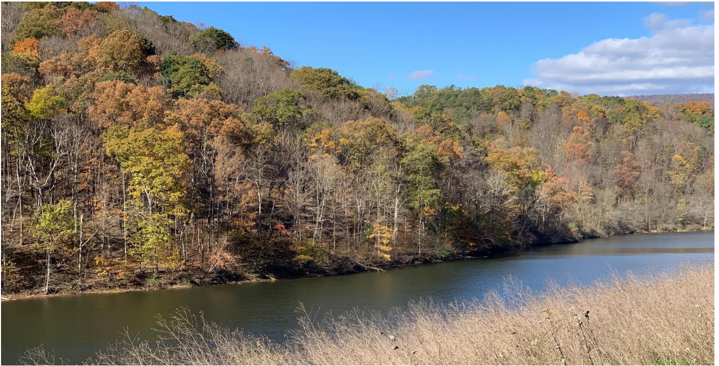
Pleasant fall color remains at Raystown Lake.

Foresters in Perry County (Tuscarora State Forest) reported continued peak colors across the district, with best fall color expected to diminish quickly through the forecast week. Licking Creek Valley is a recommended destination to experience some great fall color, or take a drive along the corridors that bisect the mountains of the Tuscarora, such as routes 233, 274, 17, 75, 35, 103, or US 522. For a scenic fall tour, consider cruising the country roads that surround Fowlers Hollow State Park, just south of New Germantown.