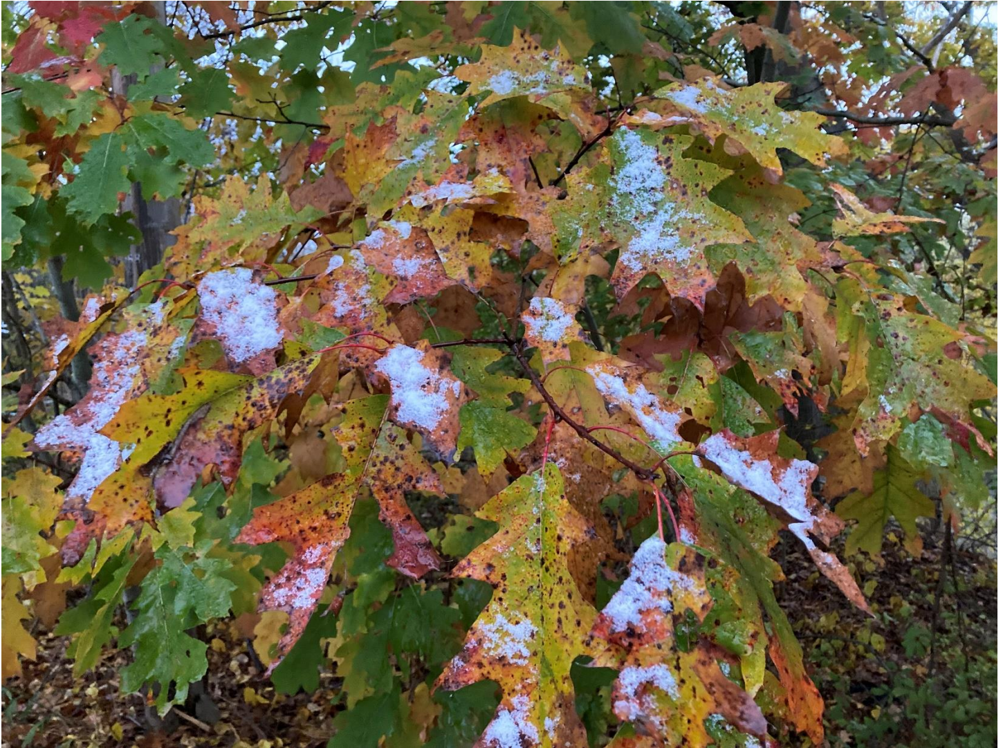
A recent, early snowfall clings to a colorful red oak, Warren County.

The manager in Cornplanter State Forest District (Warren, Erie, Crawford counties) reported that many of the trees in the northwest corner of Pennsylvania have lost or are losing their leaves as the fall foliage season draws to a close. Fall colors of rust, yellow, and maroon persist on the hillsides, providing some last glimpses of the season. Shorter days and predicted cold will hasten the final color changes.