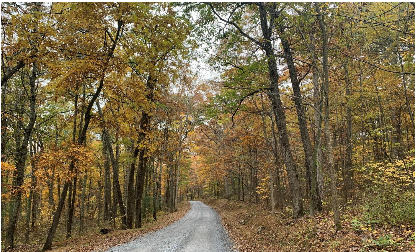
State Forest road near Licking Creek, Tuscarora State Forest.

Foresters in Perry County (Tuscarora State Forest) reported continued peak colors across the district, with best fall color expected to diminish quickly through the forecast week. Licking Creek Valley is a recommended destination to experience some great fall color, or take a drive along the corridors that bisect the mountains of the Tuscarora, such as routes 233, 274, 17, 75, 35, 103, or US 522. For a scenic fall tour, consider cruising the country roads that surround Fowlers Hollow State Park, just south of New Germantown.