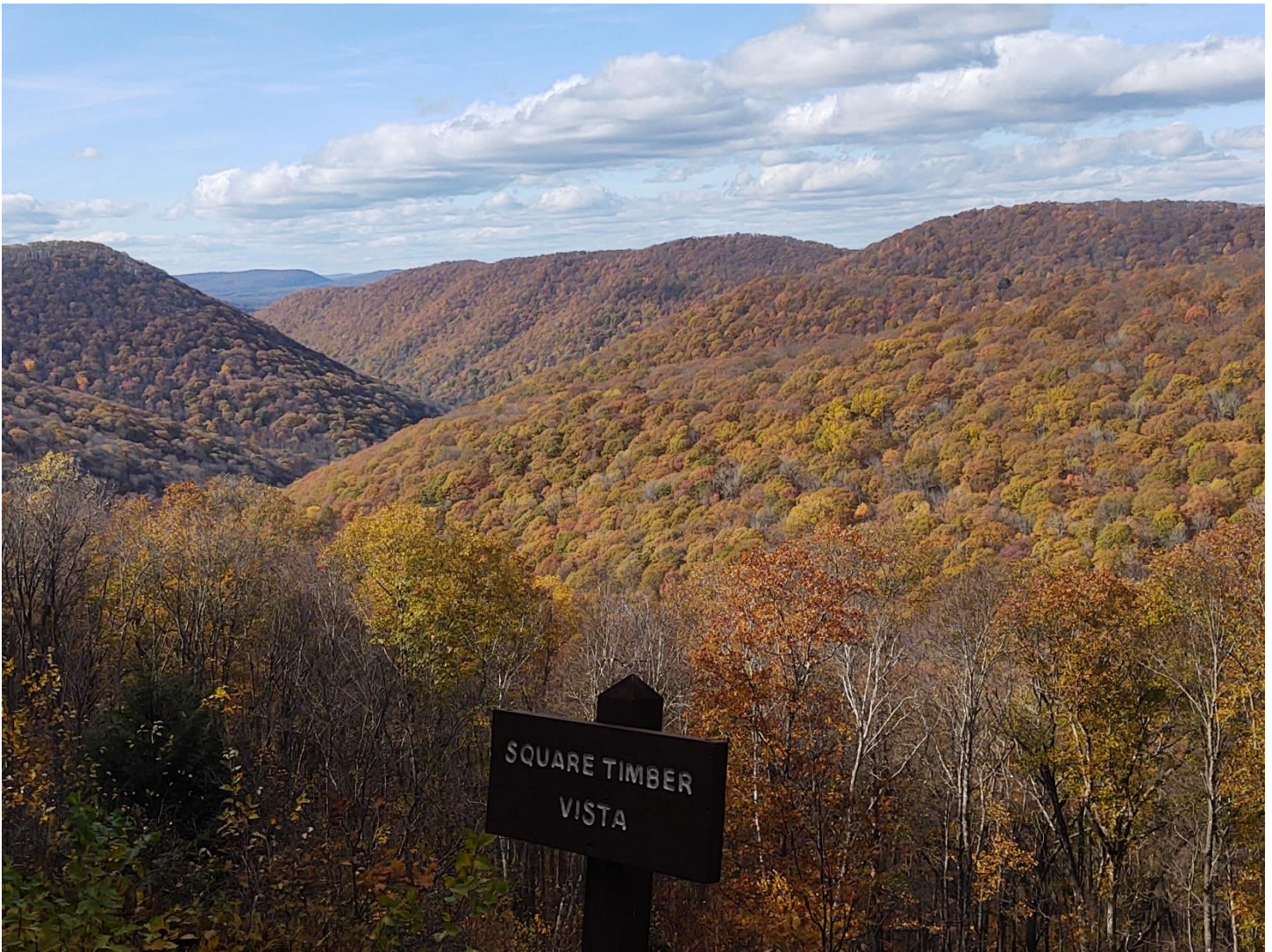
Square Timber Vista, Elk State Forest.

In Tiadaghton State Forest, western Lycoming County, the last remnants of autumn color can be observed on northern hardwood species. Oak dominated settings are showing some darker fall hues, but last week's wind and rain have taken many leaves. Recent and expected freezes will help drop many remaining leaves.