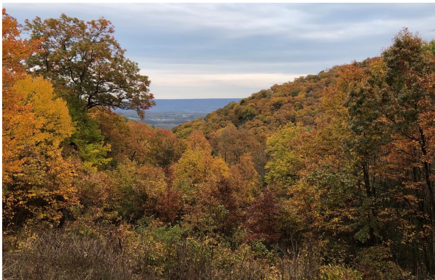
Eddie's Vista, Bald Eagle State Forest, Snyder County.

Foresters in Rothrock State Forest said that after a slow start, leaves finally peaked about a week ago. They were beautiful while they lasted but rain and wind brought many leaves to the ground. There is still some color on the landscape, especially in the valleys, but the higher elevations are generally lacking in color. Expected colder temperatures will only help bring the remainder of the leaves down progressing into November.