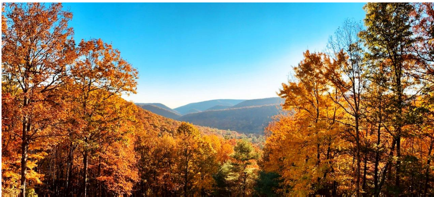
Spectacular view of fall color from Penns View Vista, Pine Swamp Road, Bald Eagle State Forest.