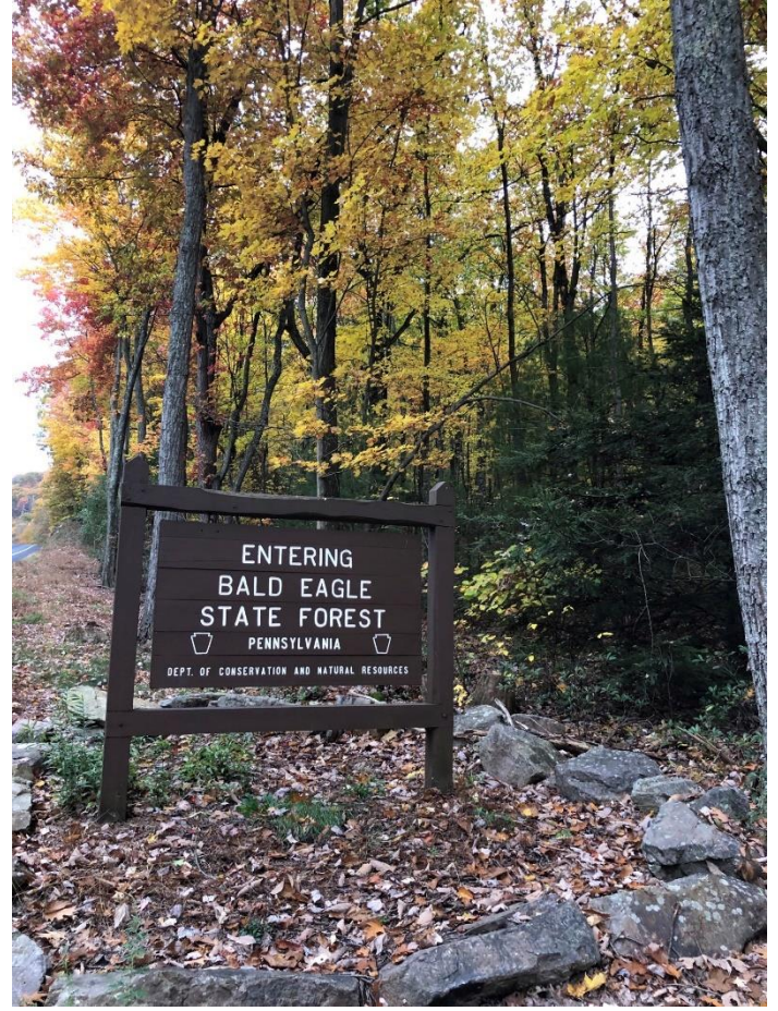
L: Mountain Streams area near Stalhlstown, Forbes State Forest. R: Bald Eagle State Forest at Shade Mountain.