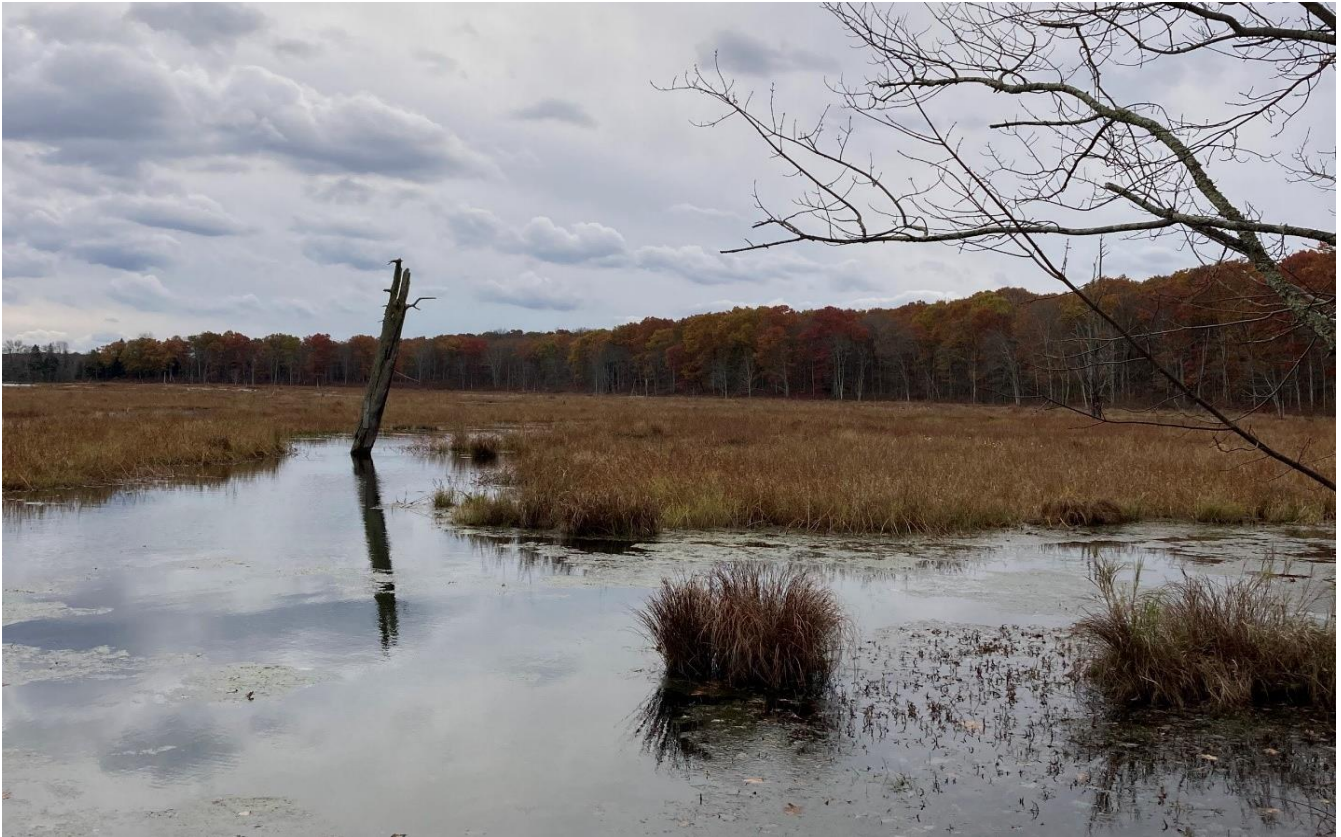
Painter Swamp, Delaware State Forest District.

Delaware State Forest staff said fall color is declining quickly. Recent hard frosts, coupled with strong gusty winds and waning daylight, are causing rapid loss of leaves of all species. The best fall colors in the district can still be viewed from Big Pocono State Park and along Blue Mountain in southern Monroe County.