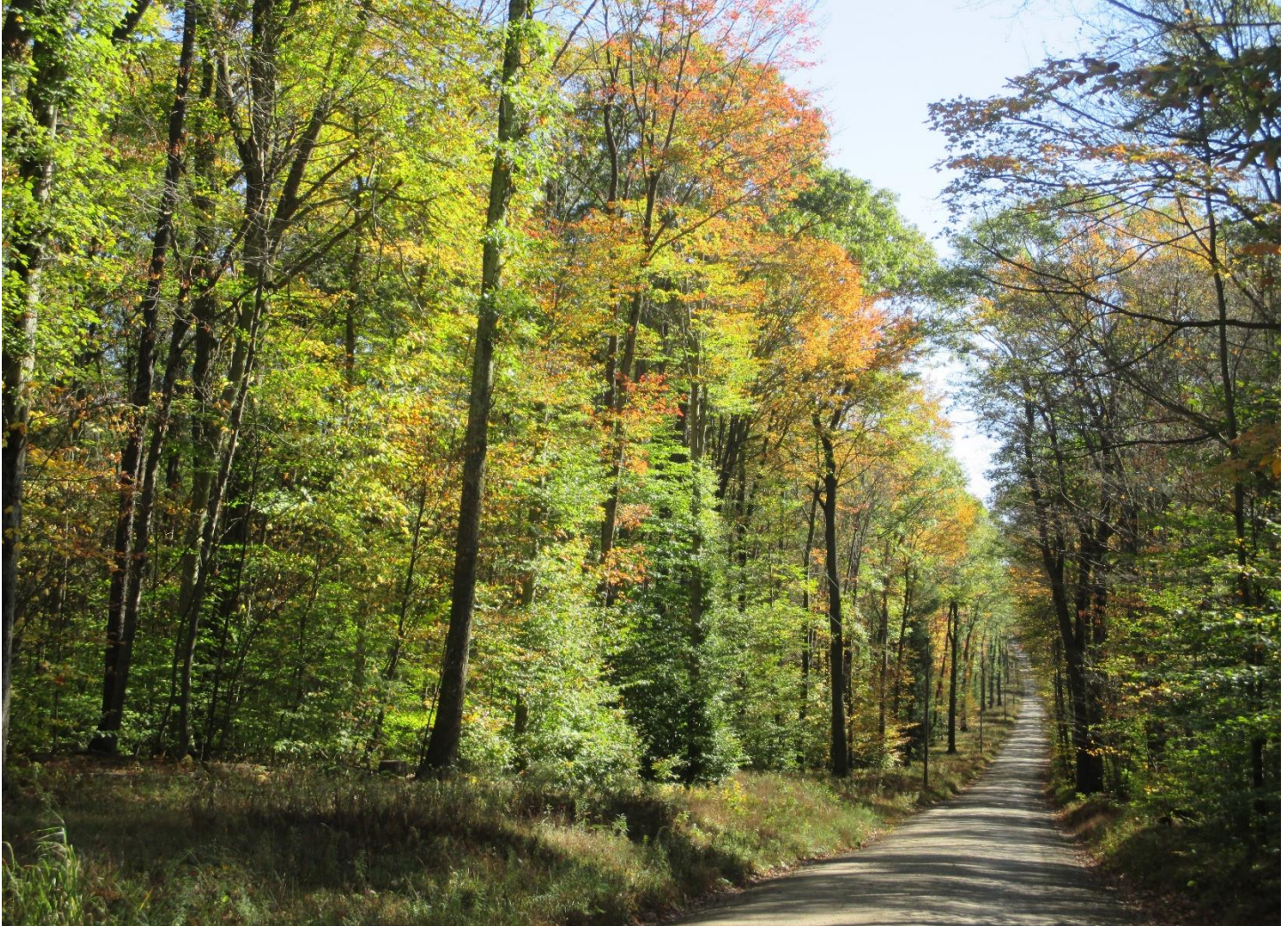
Gorgeous colors on Caledonia Pike, Moshannon State Forest.

Foresters in Moshannon State Forest stated that foliage is still at peak but will begin fading by the end of the forecast period. Maples are holding good color but starting to lose leaves. Sassafras is bright yellow and orange, and black gum is displaying vivid red. Beeches are showing a nice yellow green, contrasting nicely with the still green oaks. A recommended drive is the entire length of Caledonia Pike from the village of Caledonia on Route 555 to Route 879 at Frenchville. Notable stops are the Shaggers Inn Shallow Water Impoundment at the intersection with Shaggers Inn Road and the Gifford Run Vista on Lost Run Road.