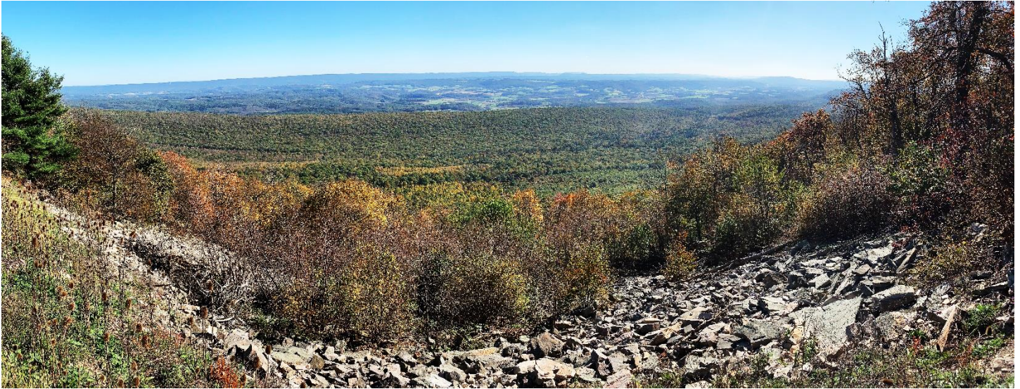
The view from a vista on Pennsylvania Furnace Road.

Foresters in Rothrock State Forest said the best leaf color is beginning now and will likely continue through next week. Oaks have finally begun to change in many areas, which will bring out pleasant color on hillsides across central PA. Many other species are still retaining brilliant foliage too. This weekend should be the best chance to catch a glimpse of this yearly spectacle since the long-term weather forecast is calling for cloudy, wet weather for the latter part of the month. Ridgetop vistas make great places to observe the maximum amount of color, but beauty will be found everywhere in the forest this week.