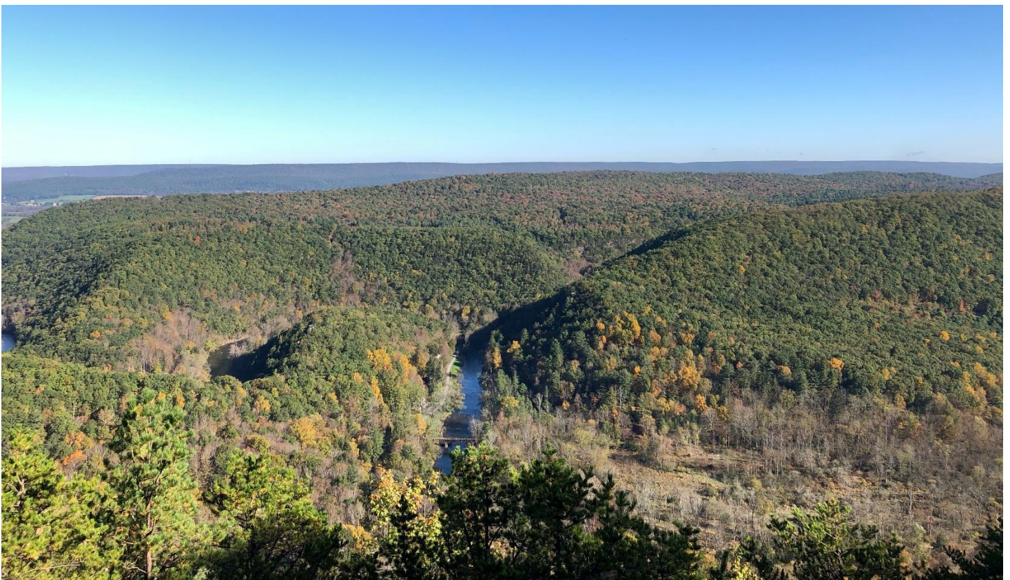
Beautiful colors from Penns View Vista.

The Union, Mifflin, and Snyder County service forester (Bald Eagle State Forest District) indicated peak conditions in the region. Birches have dropped most of their leaves, but most tulip poplars are yellow. Sugar maples and hickories are showing bright yellow to orange. Most black gums are reddish, and red maples are turning. Many oaks have begun the transition, although most remain mostly green. Beautiful foliage drives in the area include routes 45, 192, 104, and 235. For a fantastic fall hike full of color, take the White Mountain Ridge Trail (near Weikert) for a tour through the Penns Creek Wild Area.