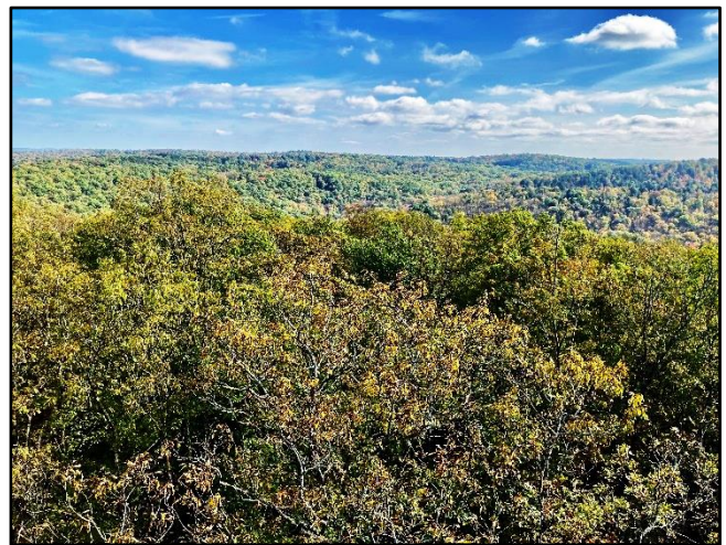
(L) Buffalo Creek, Armstrong County. (R) Seneca Fire Tower, Cook Forest State Park.

The Cambria County service forester (Gallitzin State Forest District) reported past peak conditions in higher elevations of the Babcock Division to the southeast of Johnstown. In the lower elevations near Altoona, leaf change has been slow, but recent cold has driven a rapid transition in birch, poplar, beech, and hickory. The widespread red oaks of the Rager Mountain Division northwest of Johnstown should provide some nice color toward the end of the month.