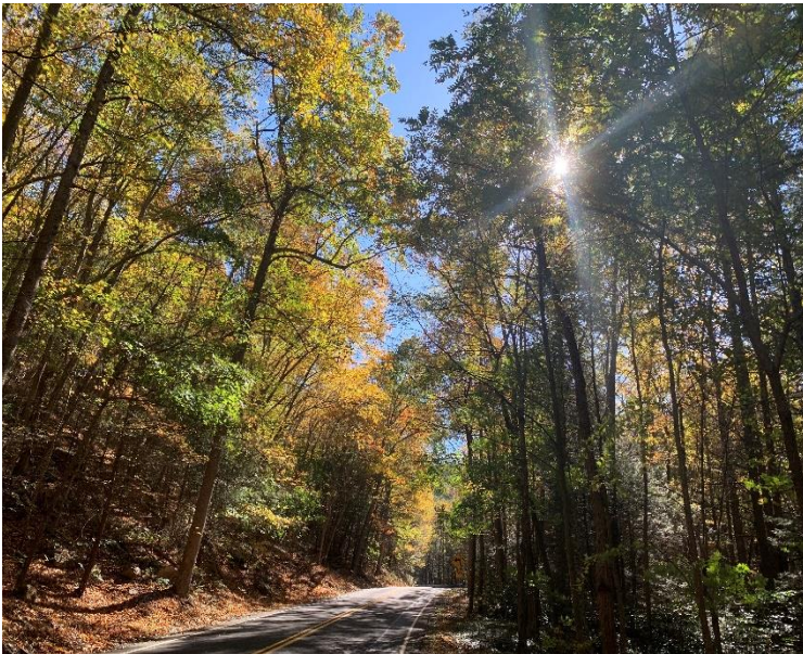
Fall color along Route 850, Perry County.

The Perry County service forester (Tuscarora State Forest) reported that oaks are still green but bright colors can be seen in birch, hickory, and maples. Views along stream valleys show nice color contrast with hemlocks. The ridges and valleys around Tuscarora State Forest are currently showing good color, but the next two weeks will get even better for fall foliage in the district.