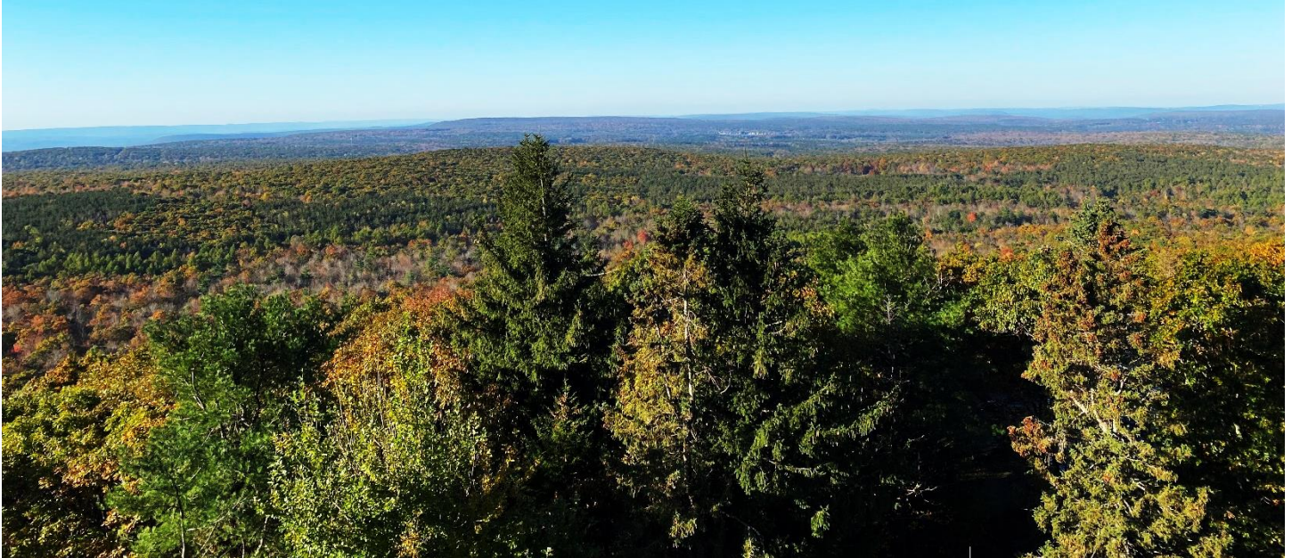
Fall hues from the Pohopoco Fire Tower, Delaware State Forest.

The Pike and Monroe County service forester (Delaware State Forest) said the best fall colors can be seen in the Monroe County portion of the district. Good fall color can also be found in areas that received less rain and wind over the last few days. Fall color in Pike County is diminishing. The best fall colors can be viewed from Big Pocono State Park and along Blue Mountain.