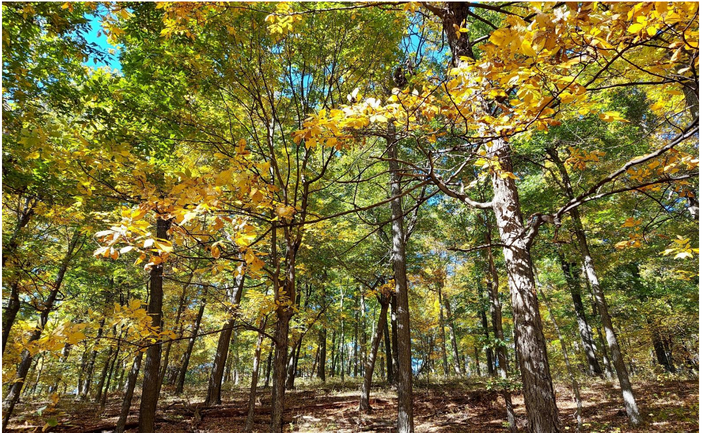
Bright colors on Martin Hill, Chaneyville Division, Buchanan State Forest.