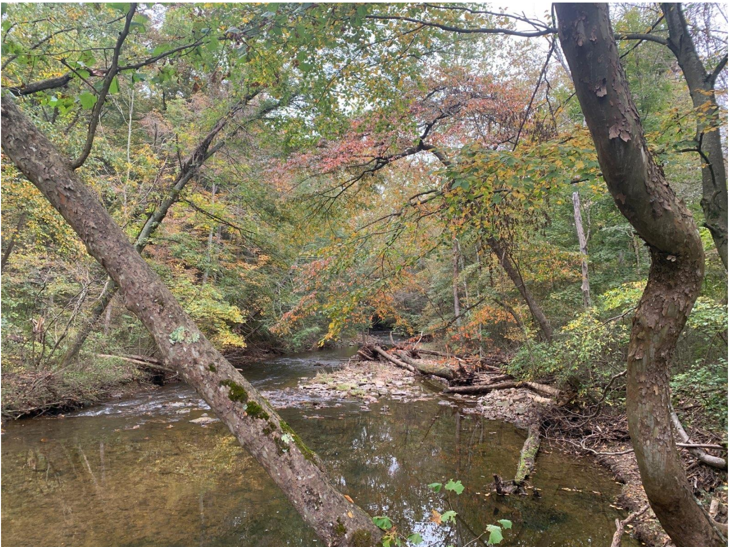
Fall color along Juniata Creek, Perry County.

The Perry County service forester (Tuscarora State Forest) reported that early color can be seen on birch, tulip poplar, black gum, sumac, and maples. For the best views and picturesque scenery in Tuscarora State Forest, sightseers are advised to visit the many vistas throughout the district.