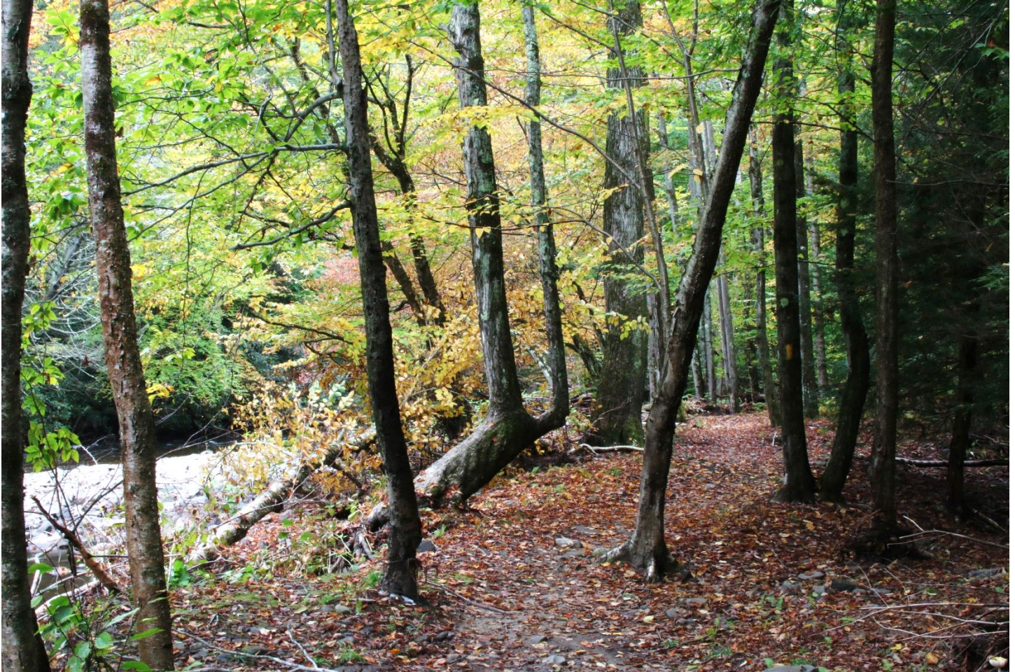
Warm fall colors along the Pocono Trail.

The Pike and Monroe County service forester serving Delaware State Forest reported that oak species are beginning to change into their russet colors. Red maple is at peak red and orange, and sugar maple is currently yellow. Black gum is turning a reddish-burgundy color, while sassafras is showing bright orange. Peak color is most likely going to be at the end of next week. The more northerly areas of the region are showing the most color currently, along with areas of higher elevation. The Route 402 and 209 corridors are optimal options for a scenic drive. Both areas have extensive tracts of publicly accessible land which provide opportunities to hike and get a closer look at the fall colors.