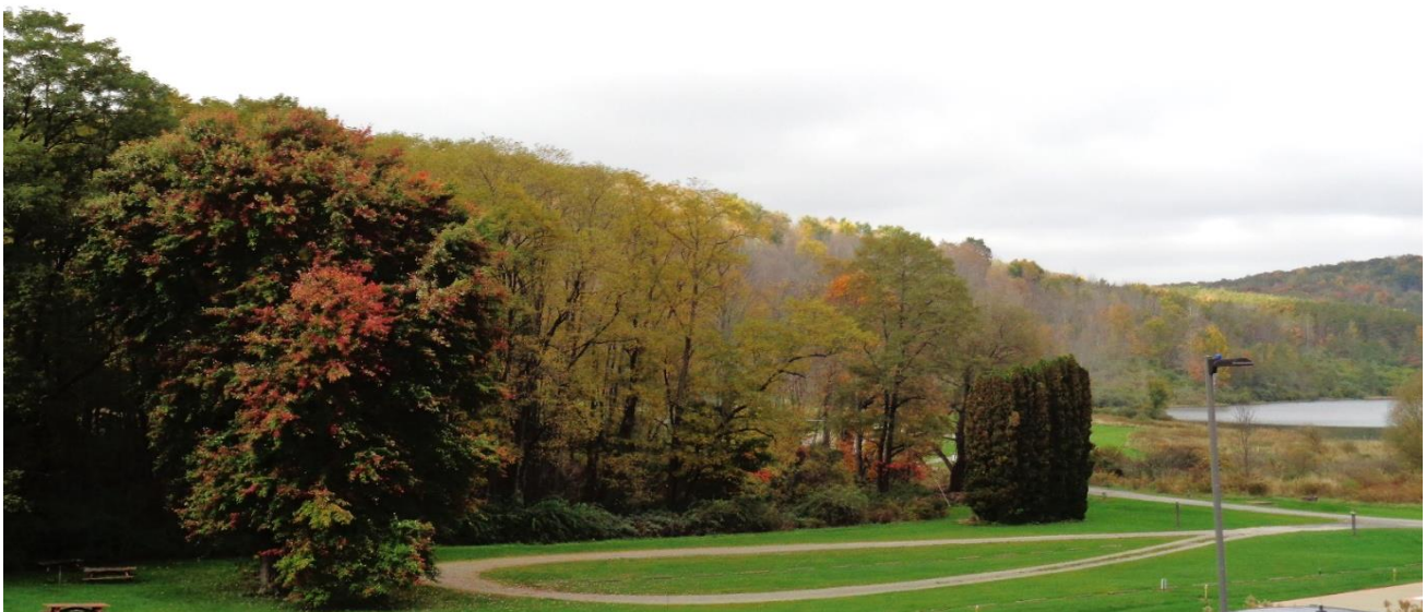
Lake Nessmuk (PA Fish and Boat Commission). (photo by T. Oliver)

The Tioga County Service Forester reported that foliage in Tioga State Forest is still highly variable. About half of the forest is showing nice color. With temperatures forecasted to drop over the weekend, the region is expected to peak next week. The Armenia Mountain area is currently at peak conditions. To the west, a drive on Colton Road is very picturesque. In Pine Creek Gorge, the colors seem somewhat muted, with the exception of some pockets of red maple standing out in the landscape.