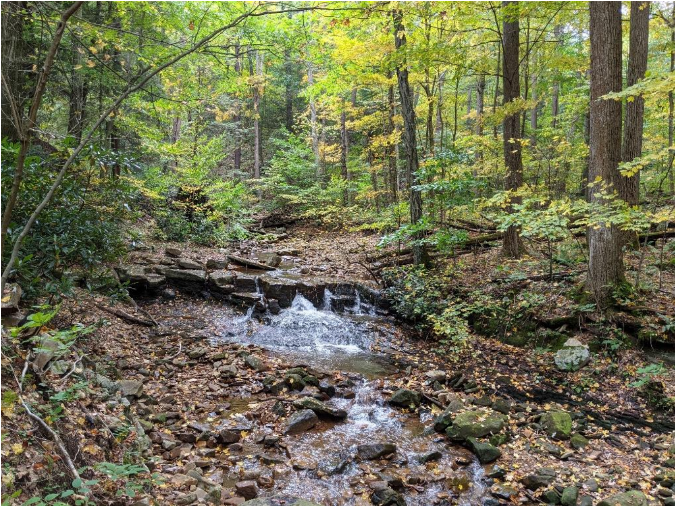
Fish Run, Laurel Mountain Division, Forbes State Forest.

The Mercer/Lawrence County service forester reported that leaf transition has recently slowed, but pleasant color is showing on maples, elms, walnuts, birches, poplars, and aspens. Occasional oaks have added some color, and bright purple asters still adorn the roads with their beauty. This area is displaying what will likely be the best color of the season.