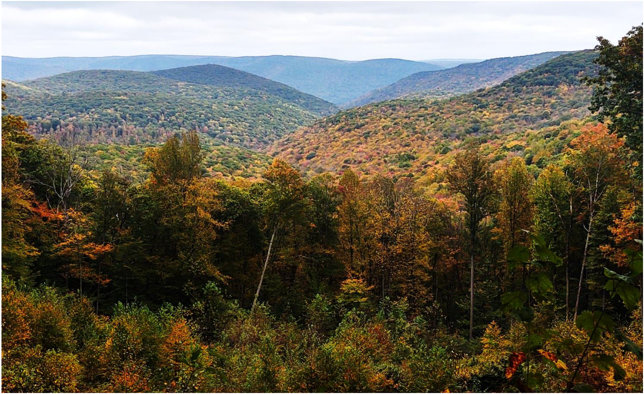
Norcross Vista, Ridge Road, Elk State Forest.

Foresters in Elk State Forest (Elk, Cameron counties) said many of the bright red maples lost leaves during rain over the weekend, but birches are about to peak along with other northern hardwood species. Oaks are starting to show color but could be a week or two away from their peak.