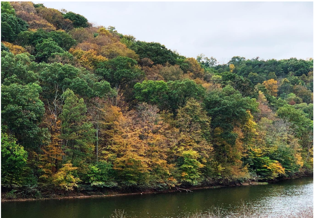
Fall color at Raystown Lake.