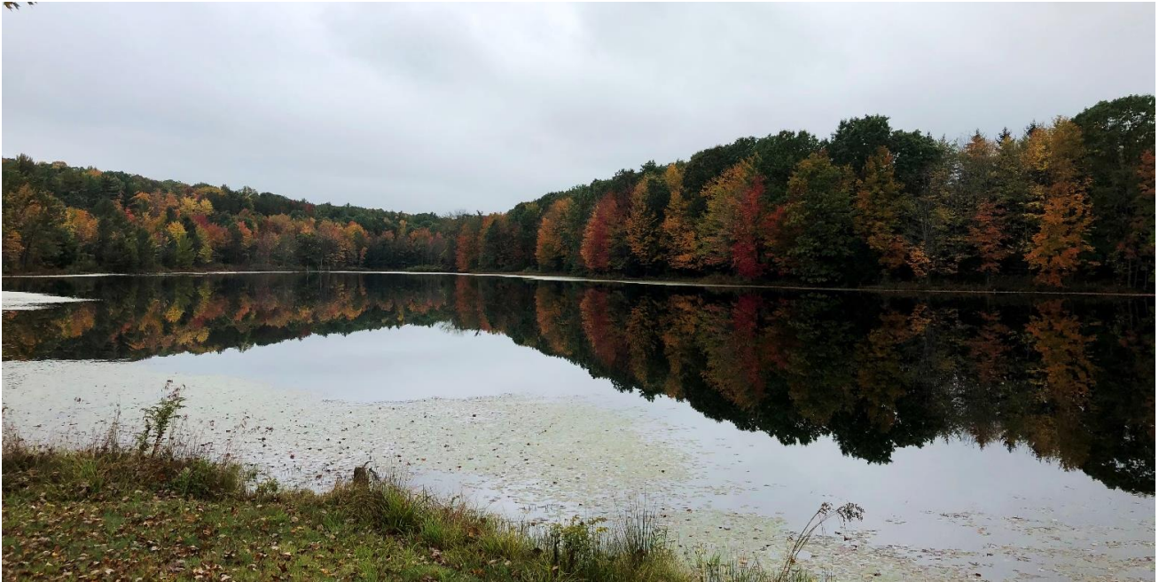
Beautiful colors along irrigation lake at Mira Lloyd Dock Center near Potters Mills.

In Bald Eagle State Forest, Centre County, foresters noted moderate change in color from last week with a few more species displaying change. Sassafras, witch hazel, Black gum, and dogwood are showing orange, yellow, and red. The area is still about a week to ten days from peak.