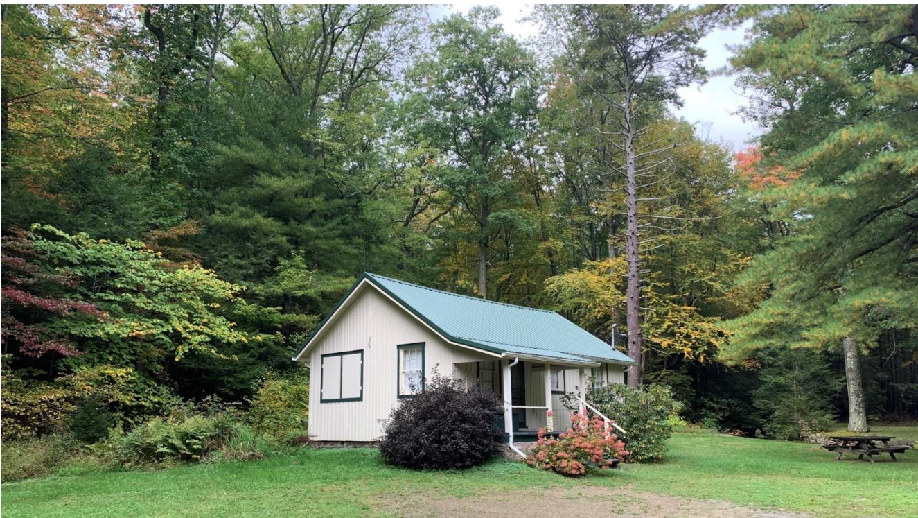
Pleasant color surrounds a cabin in Bald Eagle State Forest.