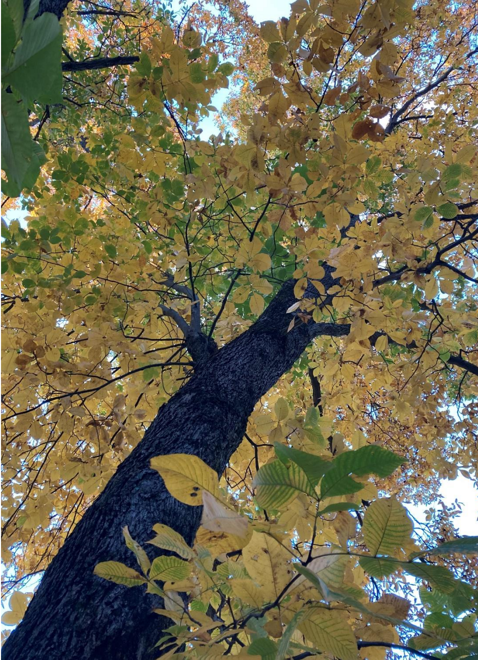
Bright hickory, Cornplanter State Forest District.

The district manager in Cornplanter State Forest District (Warren, Erie counties) reported that most maples are in full color, as are dogwoods, black gum, ash, and hickories. Many oaks are still green, but the predicted cooler night temperatures should compel their fall transition. Yellow and dark crimson are the two most prominently displayed colors; but orange, gold, and russet hues are also appearing on the landscape.