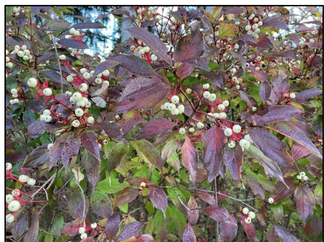
(L) Black gum. (R) Gray dogwood. Clarion County.