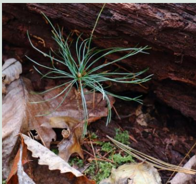
White pine seedling