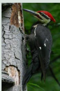
Pileated woodpeckers find insects in the deep crevices of pine bark.