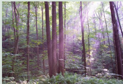
Mixed hardwoods of the natural area provide serene settings.