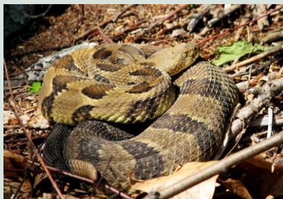
Rattlesnakes are completely protected from harvest in the natural area.