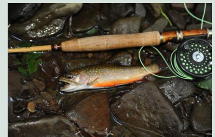
The clean, cold headwaters of Roaring Run are home to many brook trout, our state fish.