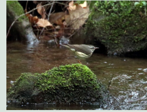
The unique Louisiana waterthrush can be found at Roaring Run.