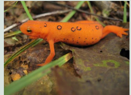
The red eft is a common salamander observed in the natural area.