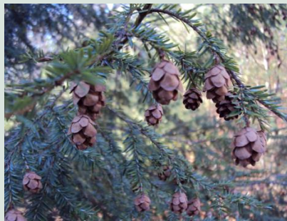
Eastern hemlock, the state tree.