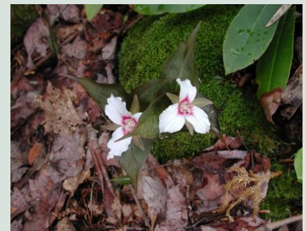
Trilliums are among many spring ephemeral wildflowers that bloom annually in the natural area.