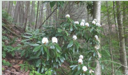
Rhododendron in bloom.