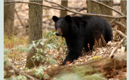
Black bears are relatively common in the natural area.