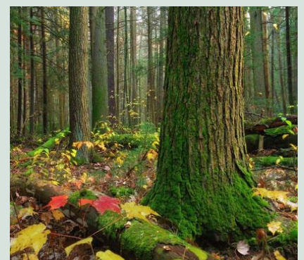
Eastern hemlock.