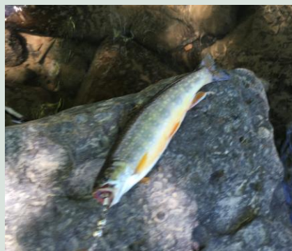
The headwaters of Standing Stone Creek support a wild population of brook trout.