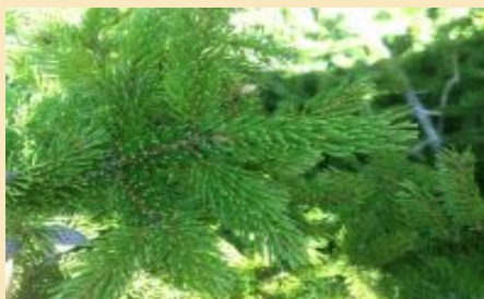
Red spruce is a common evergreen in the wild area.