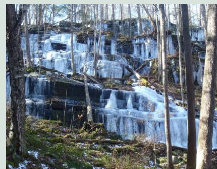
Beautiful cascades of ice can be found in the wild area in winter.