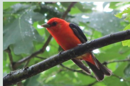
Scarlet tanagers can be found in the wild area in breeding season.