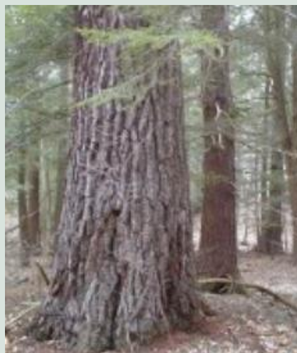
A small stand of virgin hemlock can be found at Jakey Hollow.