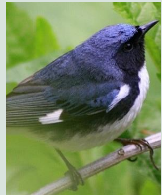
The black-throated blue warbler has been observed in the natural area.