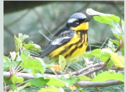
Magnolia warblers can be found in the natural area.