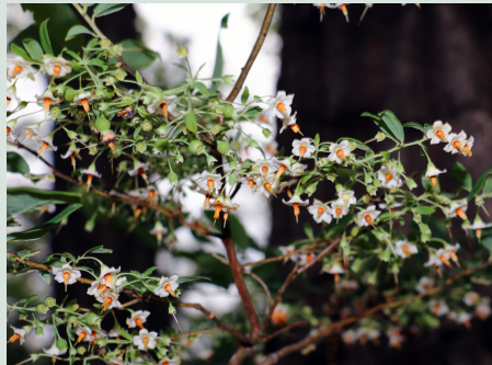
Highbush blueberries can be found at Spruce Swamp.