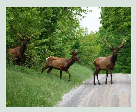
Elk can be seen along forest roads and trails throughout the wild area.