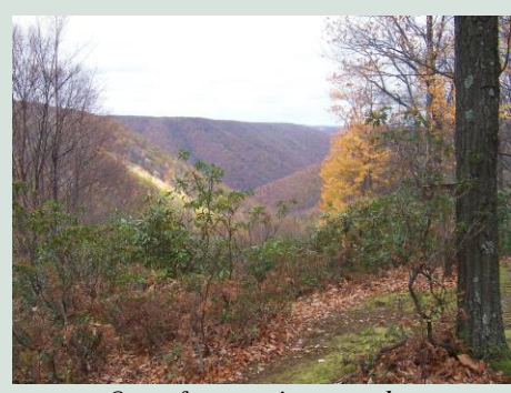
One of many vistas on the Ouehanna Trail.