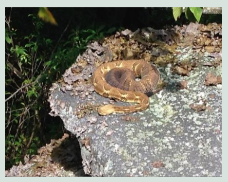
Hikers beware, rattlesnakes are found in the wild area.

Timber rattlesnakes are relatively common, as are many other reptiles and amphibians.