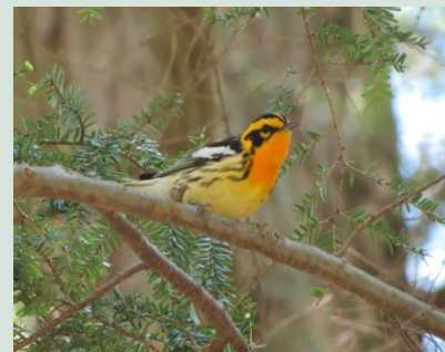
Blackburnian warblers can be seen in the natural area, especially in spring.