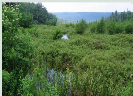
The wetland environment is an acidic bog rich in sphagnum moss.