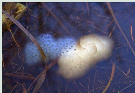
Salamanders (and their eggs), other amphibians, and reptiles are completely protected in the natural area.