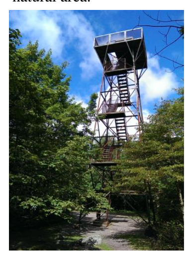
High point observation tower