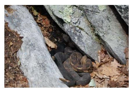
Hikers beware, timber rattlesnakes are found in the natural area.

➤ Game species like deer, turkeys, and bears can be found in the natural area and may be hunted during appropriate seasons.