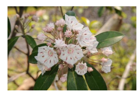
Mountain laurel, the state flower.