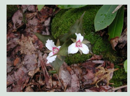
Several trillium species can be found in the natural area.