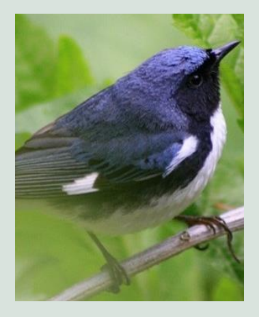
The black-throated blue warbler has been observed in the natural area.

➤ The natural area provides good cover for white-tailed deer, which can be hunted during applicable seasons.