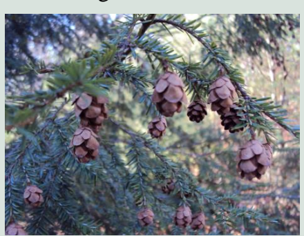
Eastern hemlock, the state tree.

➤ Terrain is gently sloping to steep in some areas, ranging from around 1400 to 1700 feet in elevation.