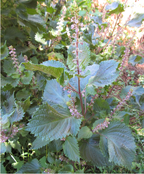
Deric Case, DCNR - BOF