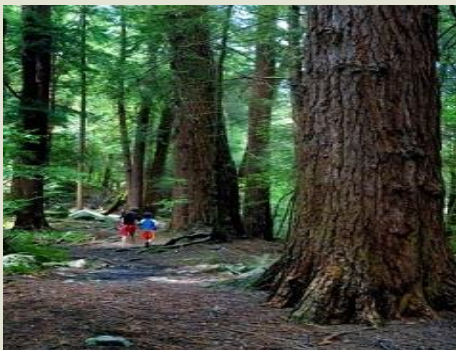
Old-growth hemlock forest