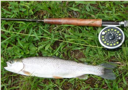
A beautiful rainbow trout taken at Penns Creek