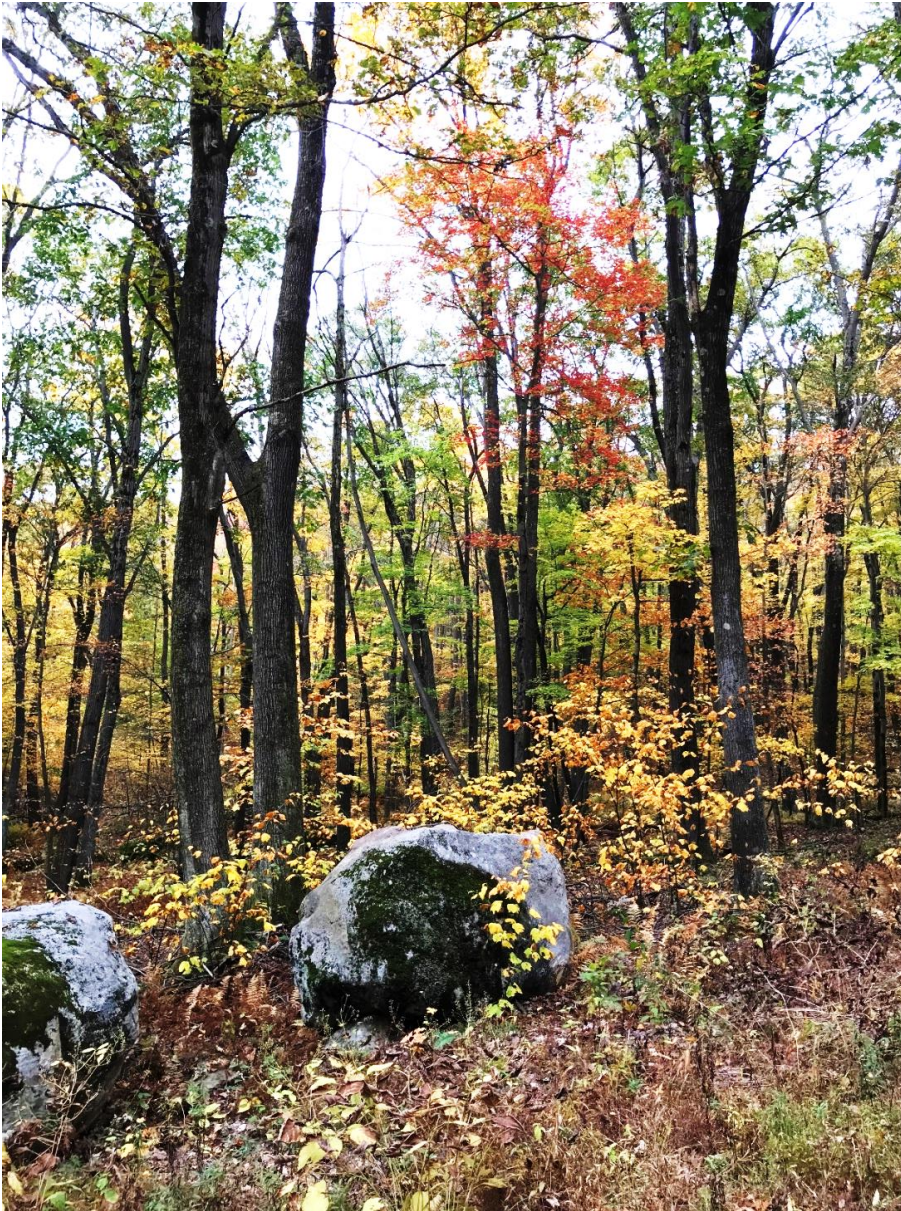
Cheerful color remains at Mt. Davis.

The Clarion County service forester (Clear Creek State Forest) reported fading color. Rain, frost, and a few windy days have dropped many leaves. Oaks are showing some rich, vibrant color – burgundy, mustard-yellow, and muted orange mixed with various shades of green and brown.