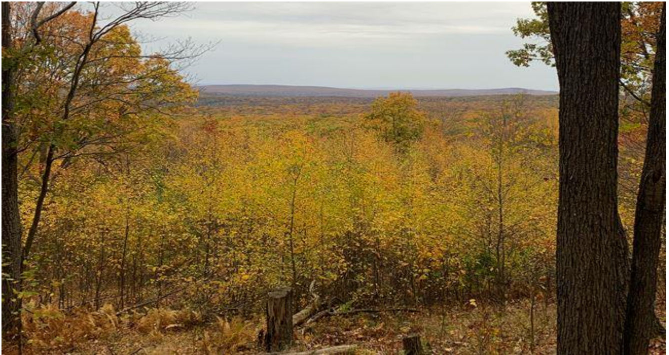
Chestnut Ridge Vista, Moshannon State Forest.

Forestry staff in Moshannon State Forest reported maple and cherry are past peak, and wind last week blew down many leaves. Beeches are a golden yellow with a hint of orange, and black birch is bright yellow as well. Huckleberry and blueberry are at peak bright red. The progression of oaks continues with yellow and occasionally red colors observed. Recommended drives to see good color are the Quehanna Highway, routes 504 and 153, and US 322.