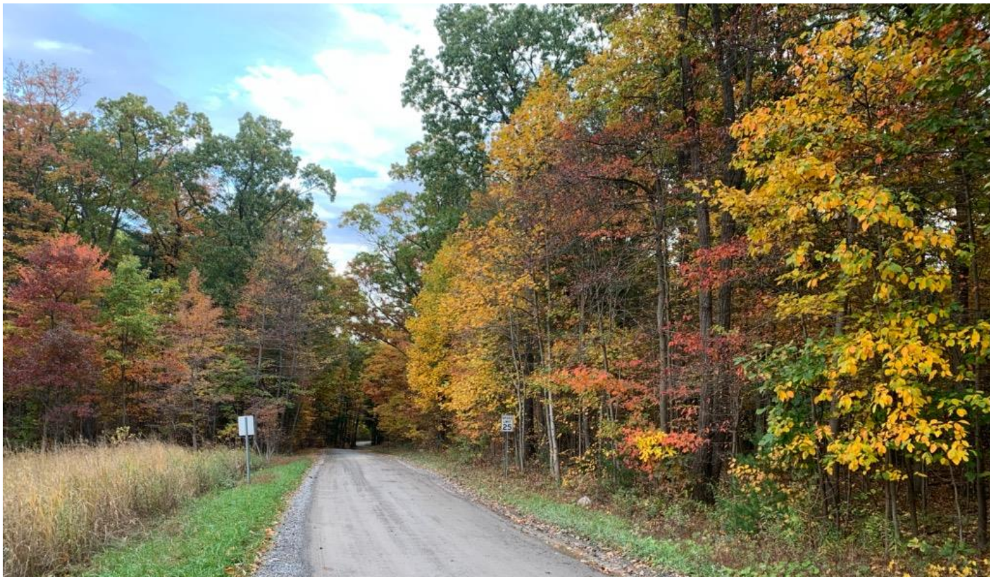
Brilliant fall foliage at Haldeman Tract, Weiser State Forest.