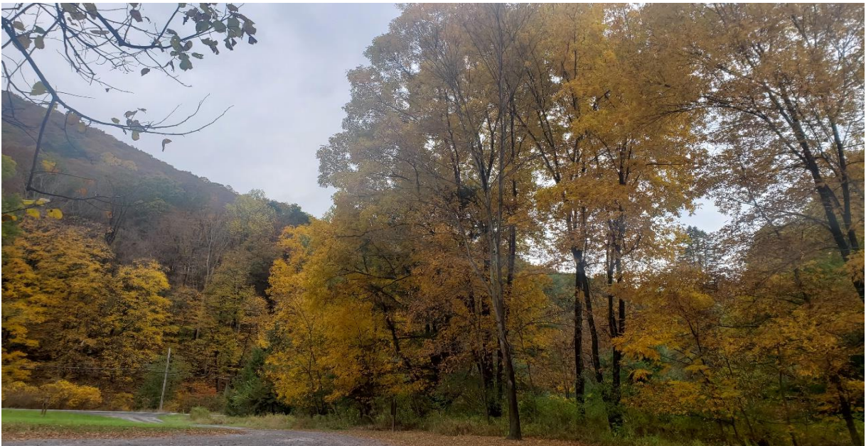
Beautiful hickories at Hamilton Bottom.

https://events.dcnr.pa.gov/event/fall_foliage_vista_driving_tour#.X4cH79BKjIU