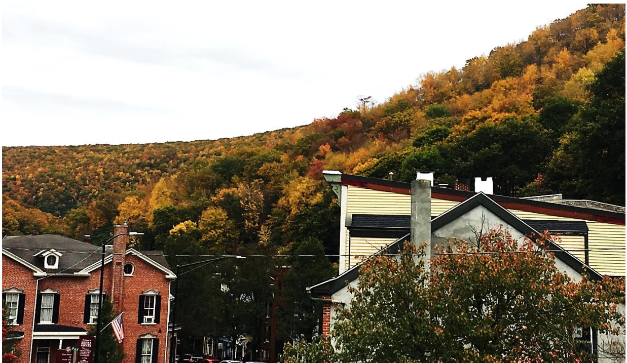
The town of Jim Thorpe, enveloped in fall's vivid display.

In the northeastern portion of Weiser State Forest District (Schuylkill and Carbon counties), foliage is spectacular. Vibrant fall color can be found at Lehigh Gorge State Park and throughout the south-Pocono area. A hike or bike ride along the D&L Trail is recommended for some truly remarkable fall scenery. Observers in Lebanon and Dauphin counties reported peak foliage this week. Beautiful color has been reported at the Haldeman Tract near Elizabethville and at Mount Gretna near Game Lands 145. US 322 from Brickerville toward Cornwall is a recommended drive in the area.