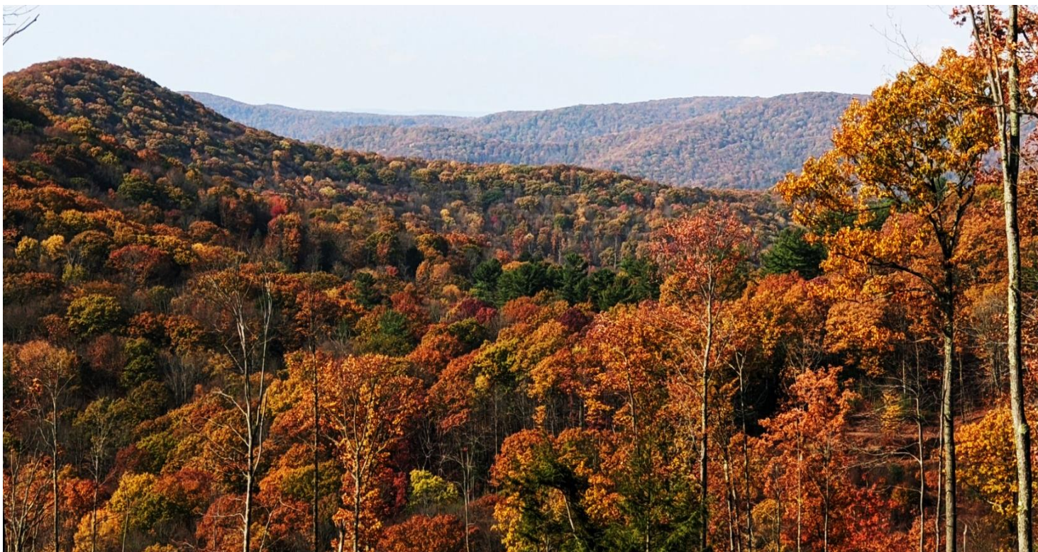
Oak forests are peaking near Wharton.

Forestry staff in Tioga State Forest District (Tioga and Bradford counties) related that there are still plenty of beautiful colors and places to see in Tioga State Forest. Oaks are at peak with beautiful orange, red, and russet shades. The western part of Tioga State Forest has the best remaining color, where the oak stands are dominant. The Route 6 corridor remains a beautiful drive.