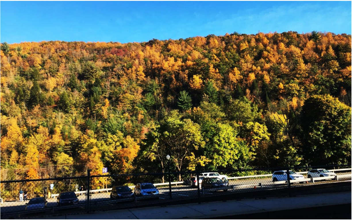
Gorgeous autumn color overlooking the D&L Trail.

In the northeastern portion of Weiser State Forest District (Schuylkill and Carbon counties), foliage is spectacular. Vibrant fall color can be found at Lehigh Gorge State Park and throughout the south-Pocono area. A hike or bike ride along the D&L Trail is recommended for some truly remarkable fall scenery. Observers in Lebanon and Dauphin counties reported peak foliage this week. Beautiful color has been reported at the Haldeman Tract near Elizabethville and at Mount Gretna near Game Lands 145. US 322 from Brickerville toward Cornwall is a recommended drive in the area.