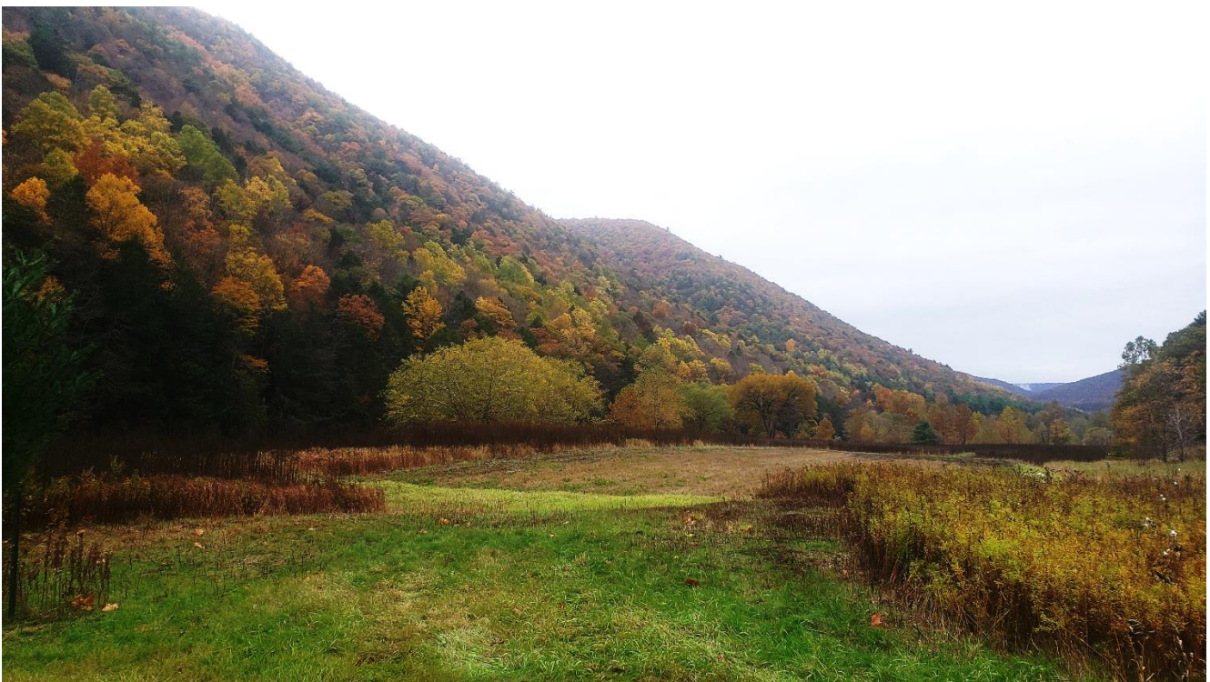
Beautiful color at Ross Run Parking Area, Tiadaghton State Forest.