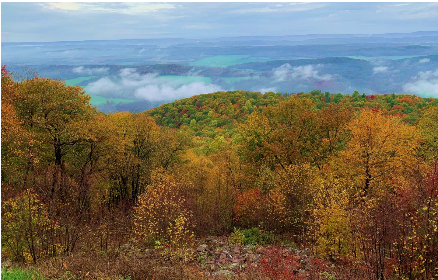
Colerain Vista, Rothrock State Forest.

Michaux State Forest is currently at spectacular peak color. White oaks are fantastic, and red oaks are gradually brightening. Tulip poplars are yellow and sugar maples are exceptionally bright this year. Breathtaking fall scenery can be seen on a drive from Caledonia State Park to Pine Grove Furnace State Park along Route 233.