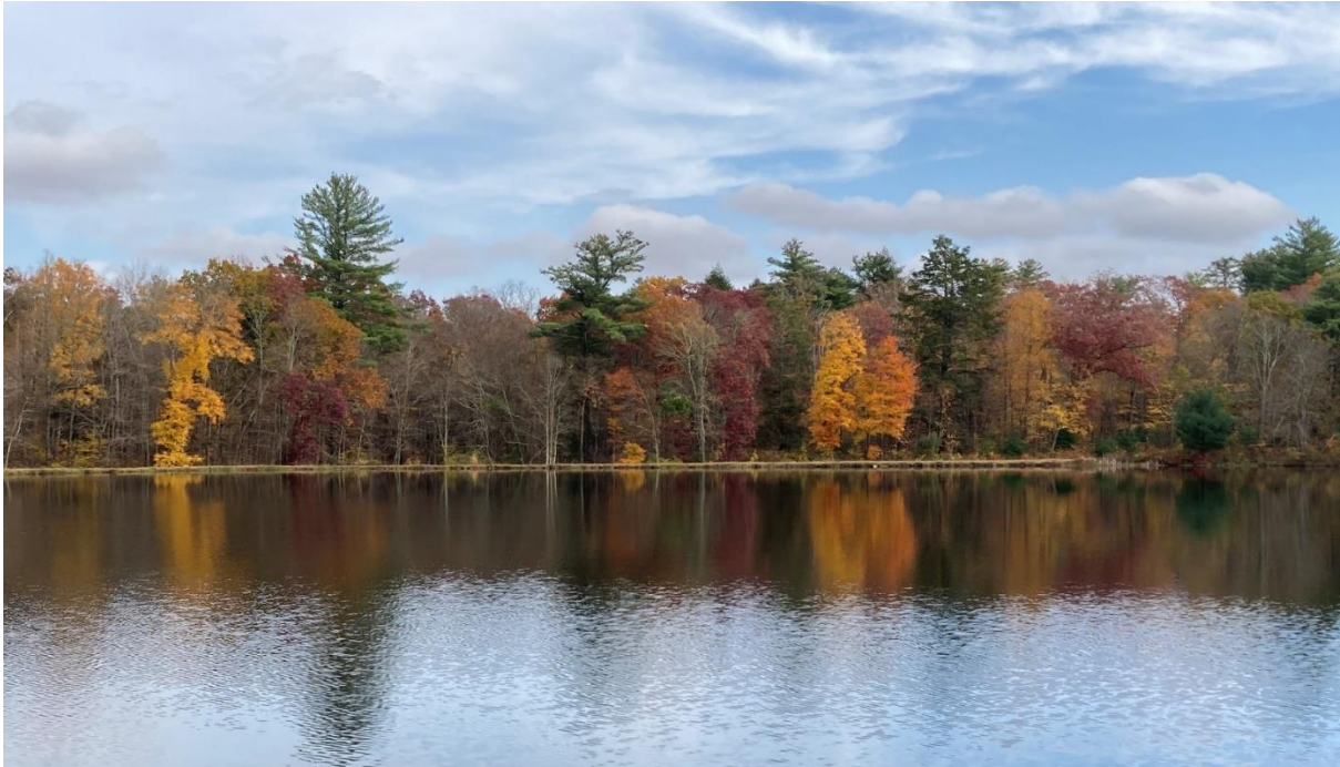
The view at Camp William Penn, Delaware State Forest District.

Foresters in Delaware State Forest (Pike and Monroe counties) reported the entire region continues to be at peak color this week. Most birches and red maples have dropped their leaves throughout the area, but scarlet and white oak continue to show vibrant variations of red. Hickories are currently showing vivid shades of yellow. Even some of the sugar maples that were late to change are still showing some pleasant yellow colors. Red oaks are adding rusty orange colors, while sassafras is displaying bright yellow in some areas. The best places to view fall foliage this week will be in the oak forests throughout Pike County.