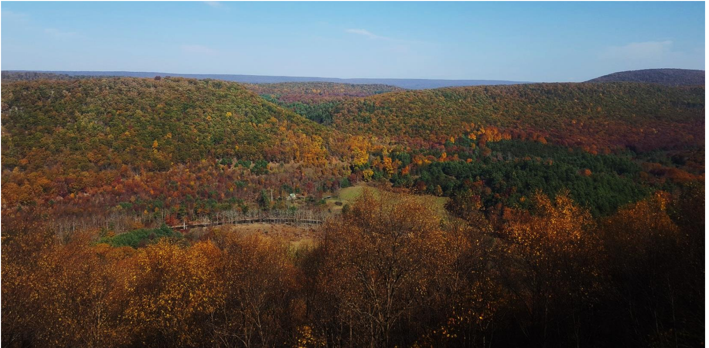
Ingelby Vista, Bald Eagle State Forest.

Foresters from the Miry Lloyd Dock Center (Penn Nursery) in Spring Mills noted fading color in the Seven Mountains area. Nearly all maple, cherry, and birch leaves have fallen. Despite the loss of these colorful leaves, fall foliage enthusiasts can still enjoy nice color from the oak forests that dominate the ridgetops and slopes.