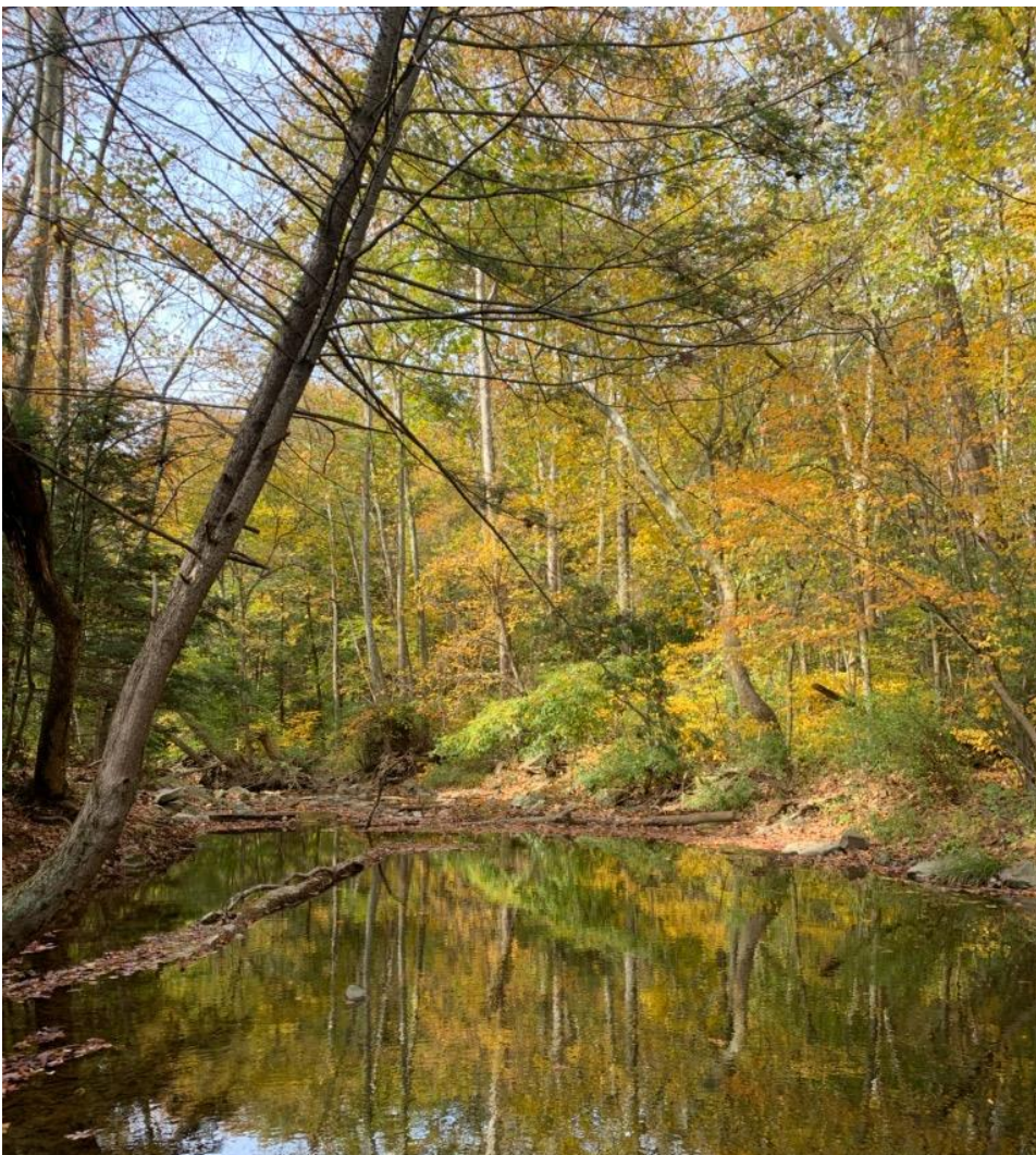
Wagner Gap, Tuscarora State Forest District.

In Buchanan State Forest (Franklin, Fulton, Bedford counties), full fall color abounds. With pleasant weather on the way, this weekend is setting up for prime foliage viewing. Birches, maples, and hickories are vibrant, with oaks just beginning to add color. Consider a picnic at the Sideling Hill Picnic Area (Fulton County) to observe some beautiful fall scenery.