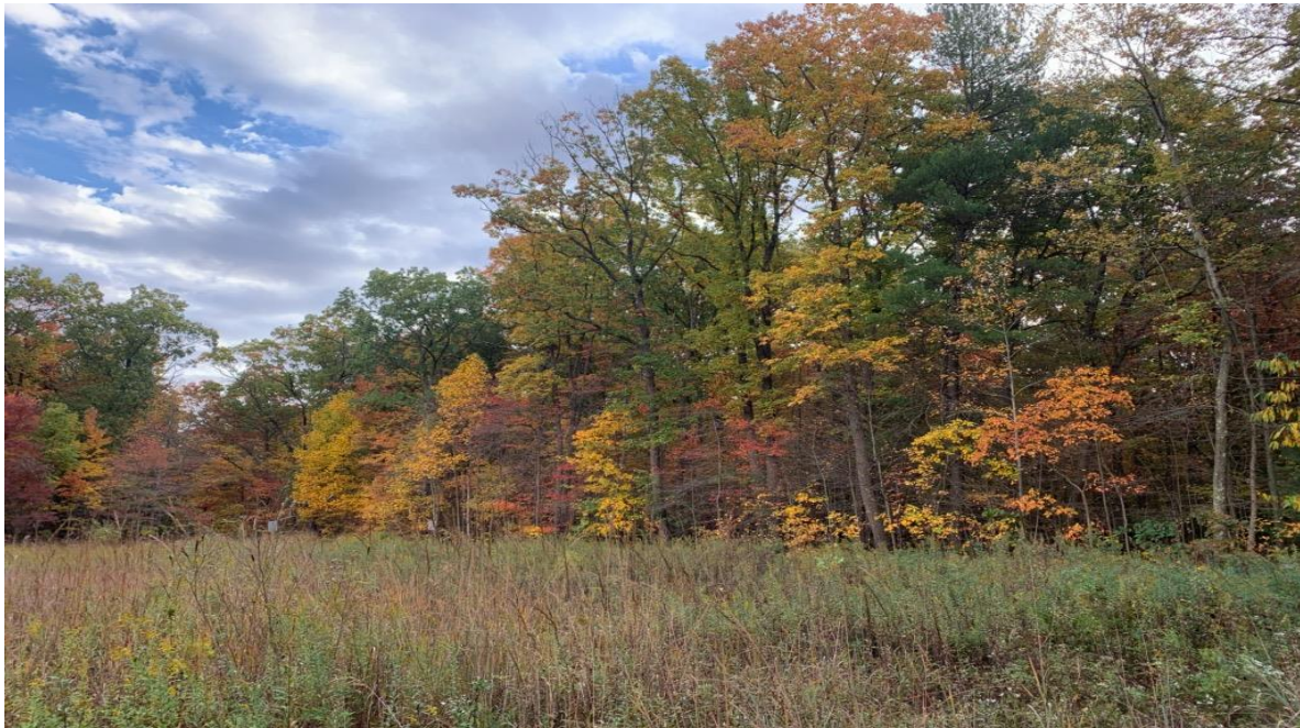
Vivid colors along a field edge, Haldeman Tract.