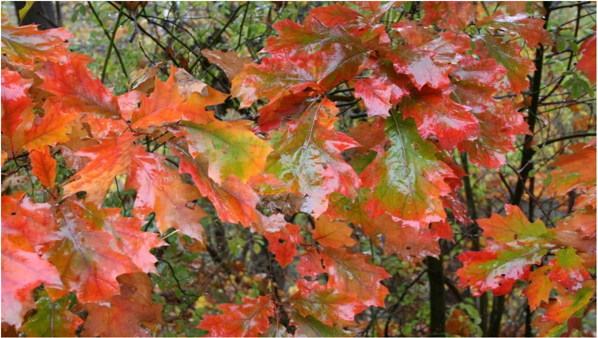
Red oak color glistens after rain in Warren County.

The district manager in Cornplanter State Forest District (Warren, Erie counties) reported recent rains have caused leaves to drop but still much color to be viewed in northwest Pennsylvania. There continues to be a beautiful mix of colors both on the landscape level and on individual trees. Some darker, richer shades are beginning to stand out on nature's palette, including deep gold, chestnut brown, and cranberry.