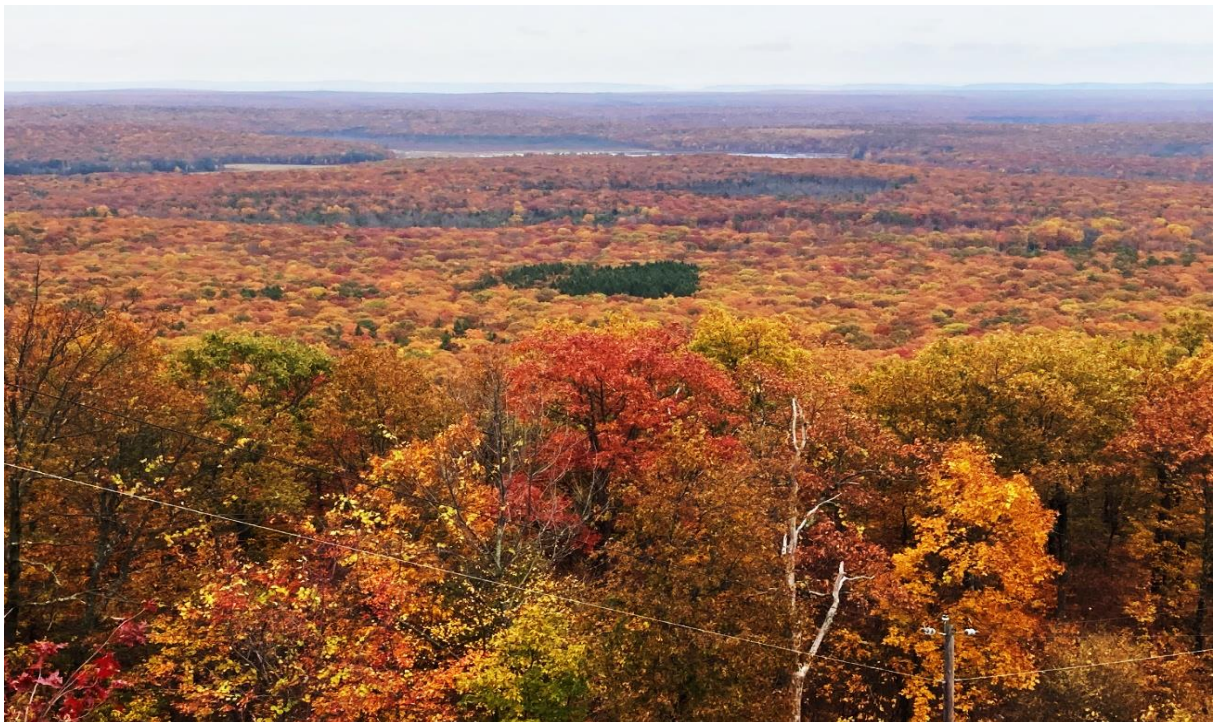
High Knob Firetower, Delaware State Forest District.