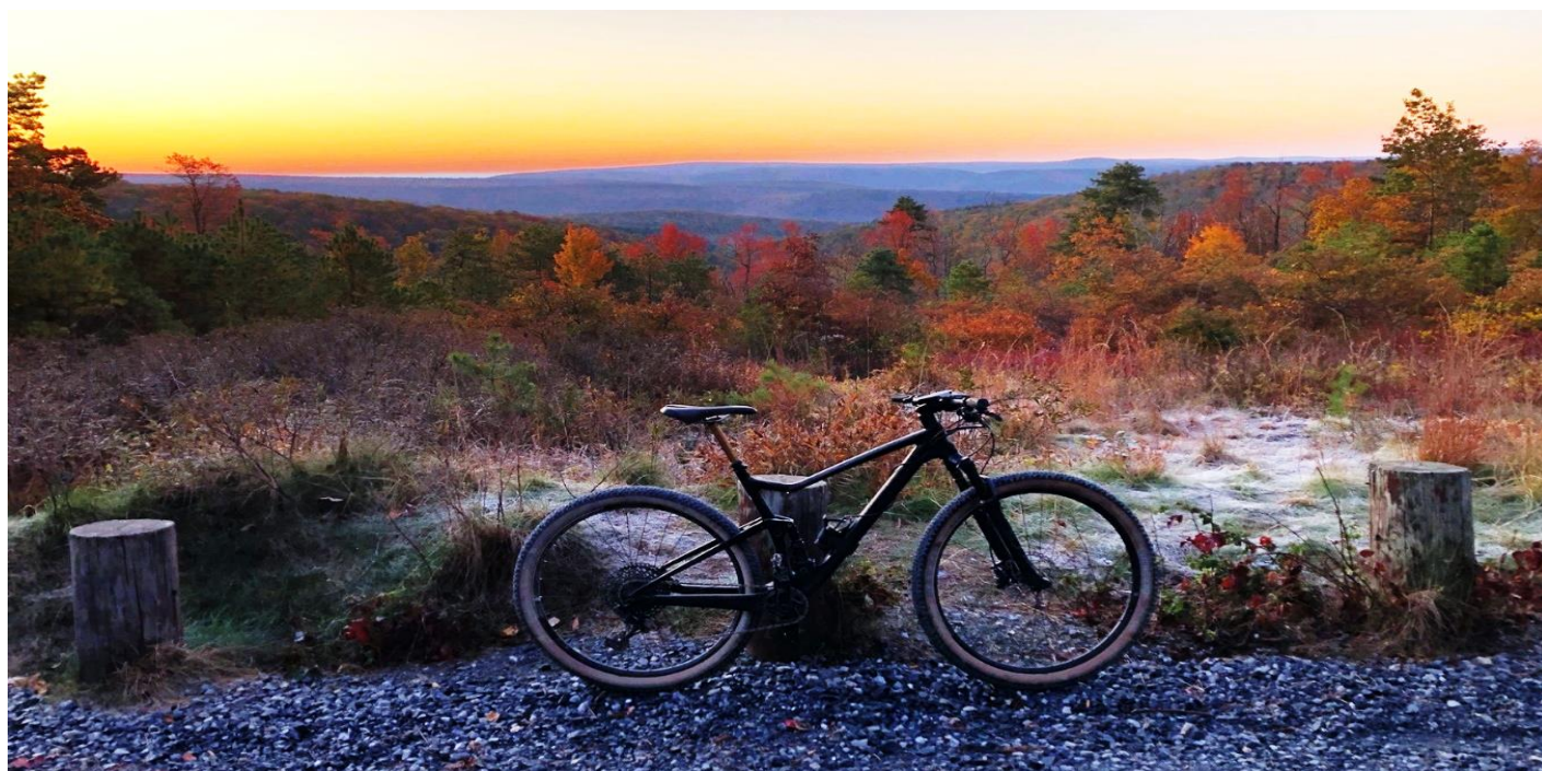
Sunrise atop Dark Hollow Vista in Michaux State Forest.

Michaux State Forest is currently at spectacular peak color. White oaks are fantastic, and red oaks are gradually brightening. Tulip poplars are yellow and sugar maples are exceptionally bright this year. Breathtaking fall scenery can be seen on a drive from Caledonia State Park to Pine Grove Furnace State Park along Route 233.