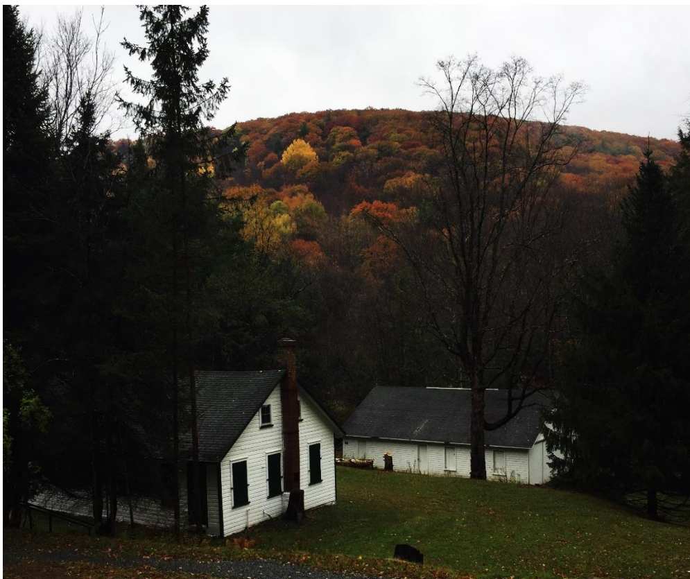
Warm fall color at the historic Watrous CCC camp.

The district manager reported fading overall color in Susquehannock State Forest (Potter, McKean counties), but beech and aspen leaves are hanging on with some nice yellows and oranges. Oaks have progressed since last week and are starting to peak with rusty reds and oranges across the hillsides. A drive on Route 6 from Galeton to Ansonia in Tioga County should show some nice oak color on south-facing slopes. Other recommended scenic drives include routes 872, 44, and 144.