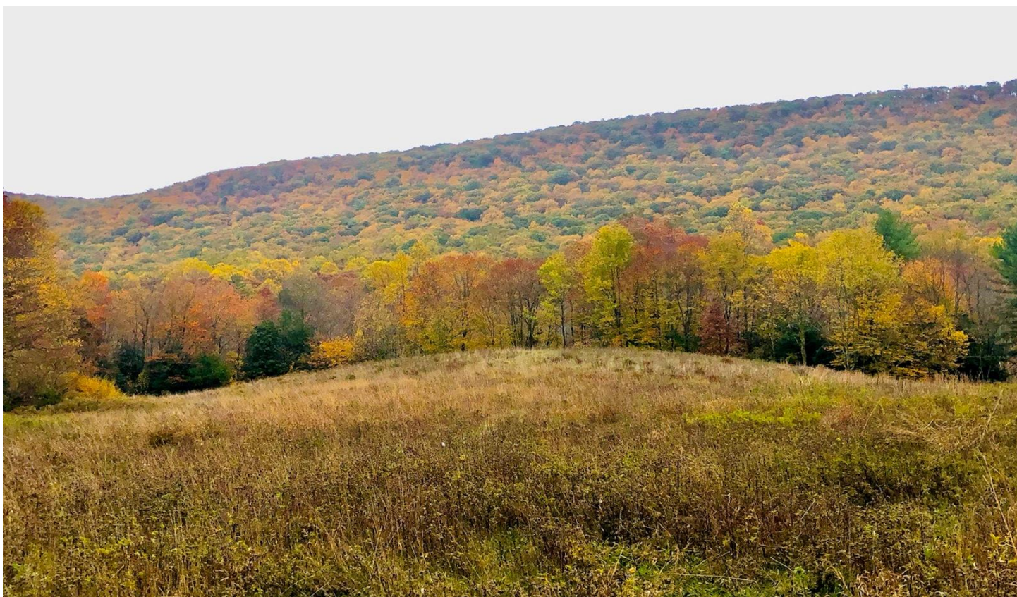
Incredible fall color in Stony Valley, Dauphin County.