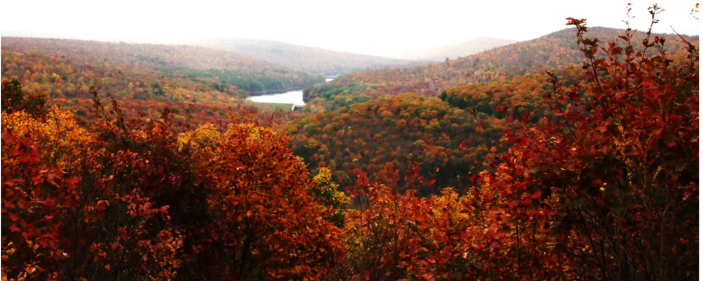
Montage Tract, Pinchot State Forest.

Foresters in Pinchot State Forest reported past peak conditions in Susquehanna and northern Wayne counties, while Lackawanna and southern Wayne counties are starting to fade. Wyoming County forests are still peaking but will begin to fade over the forecasting week. Luzerne County forests are at full peak, which should continue into next week and begin fading near Halloween. Species in full color are red maple, black gum, sassafras, white and red oaks, birches, beech, and aspens. Recommended places to visit for gorgeous fall color include Moon Lake Recreation Area, Crystal Lake and Montage tracts, and Francis Slocum and Nescopeck state parks.